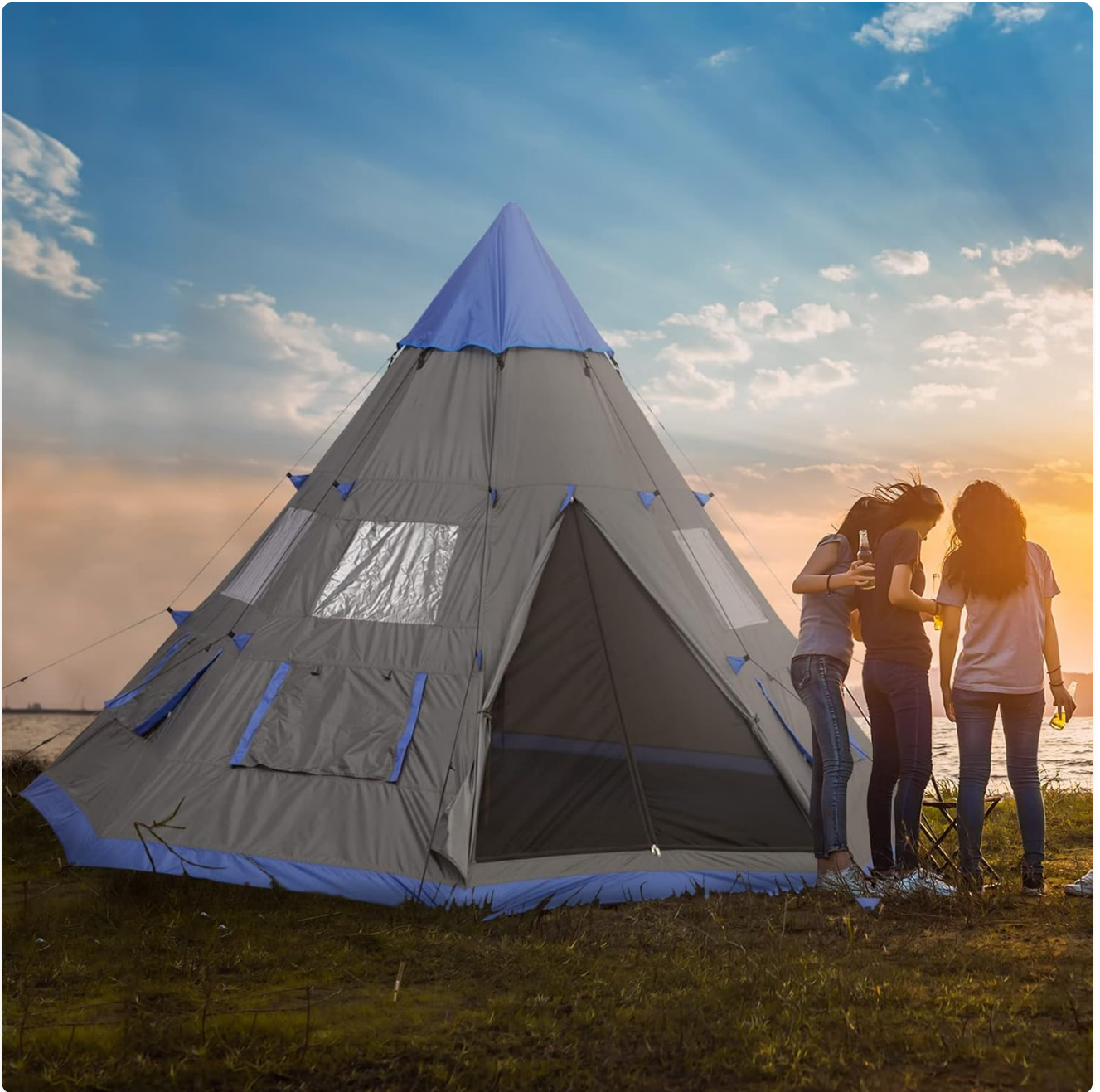
Image: The Outsunny tent pitched by a body of water, with several people standing nearby, illustrating its large size and suitability for group use.