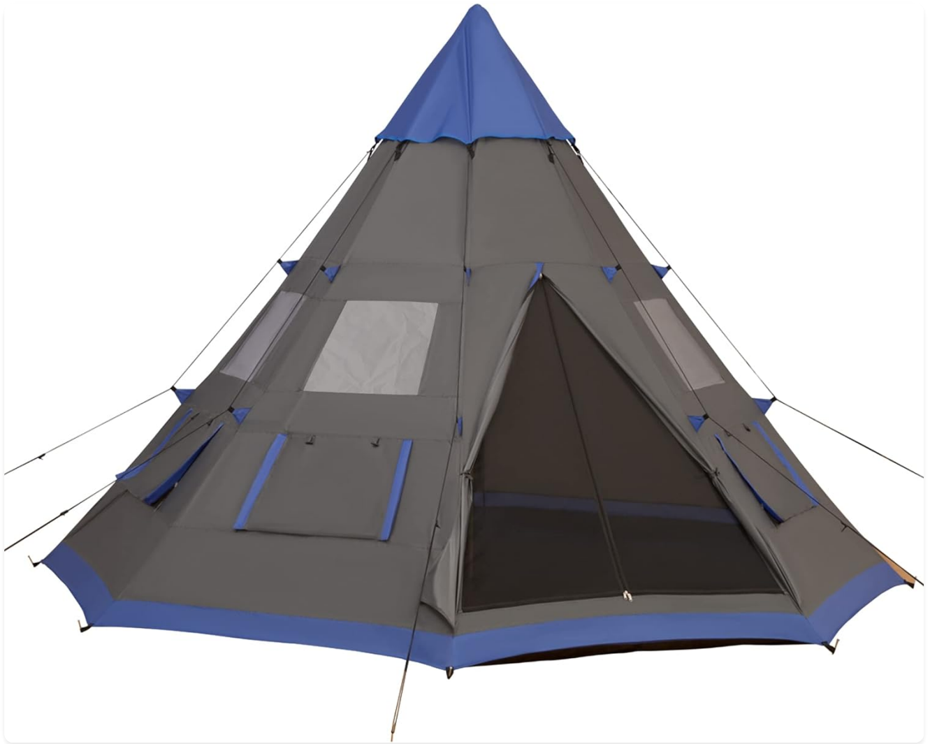
Image: The Outsunny 12Ft Camping Tent, a large teepee-style tent with a blue top and grey body, pitched in a grassy area.