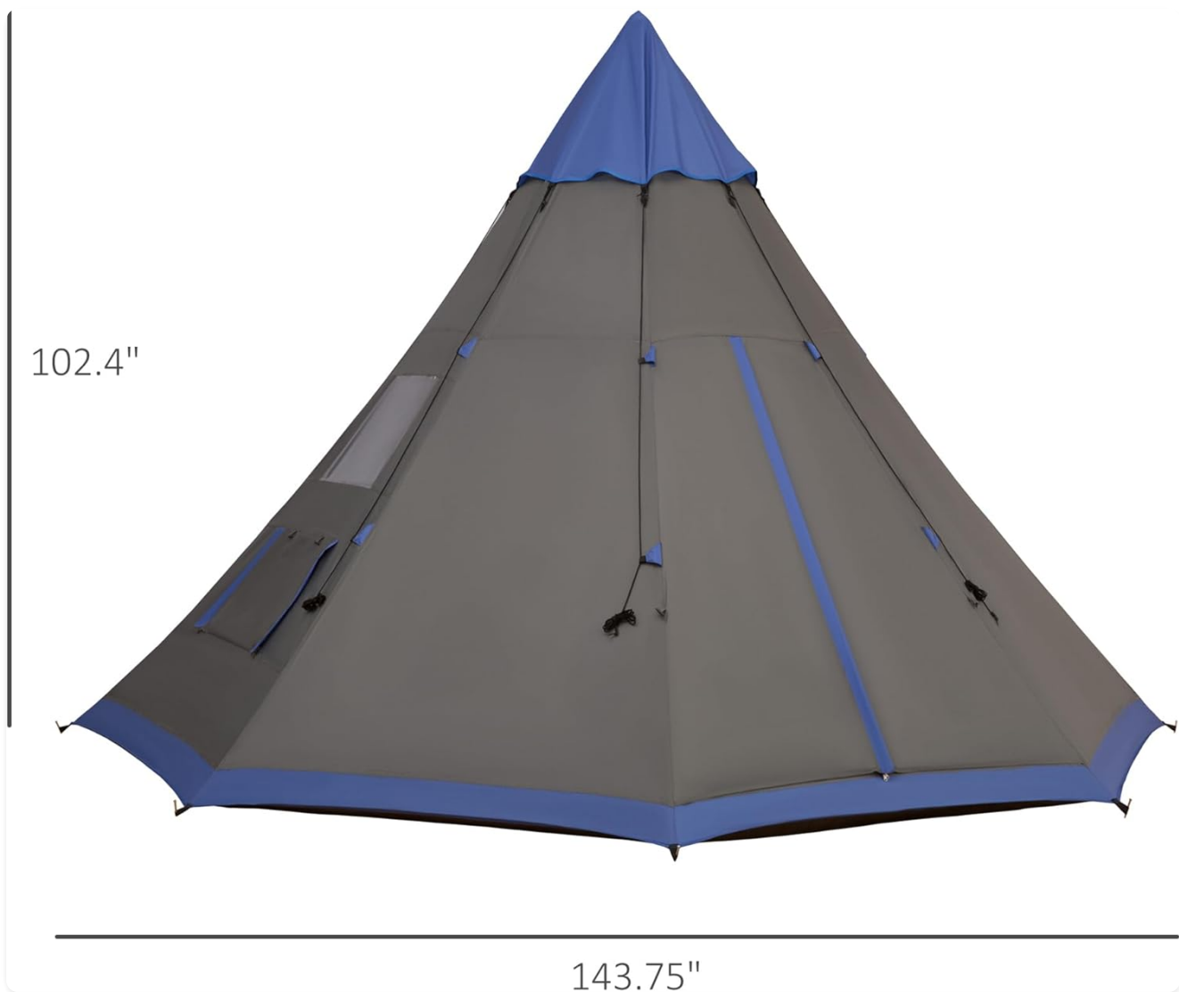
Image: A detailed view highlighting the tent's solid structure, including the ground stakes, guy ropes, and the powder-coated steel frame base, ensuring high stability.