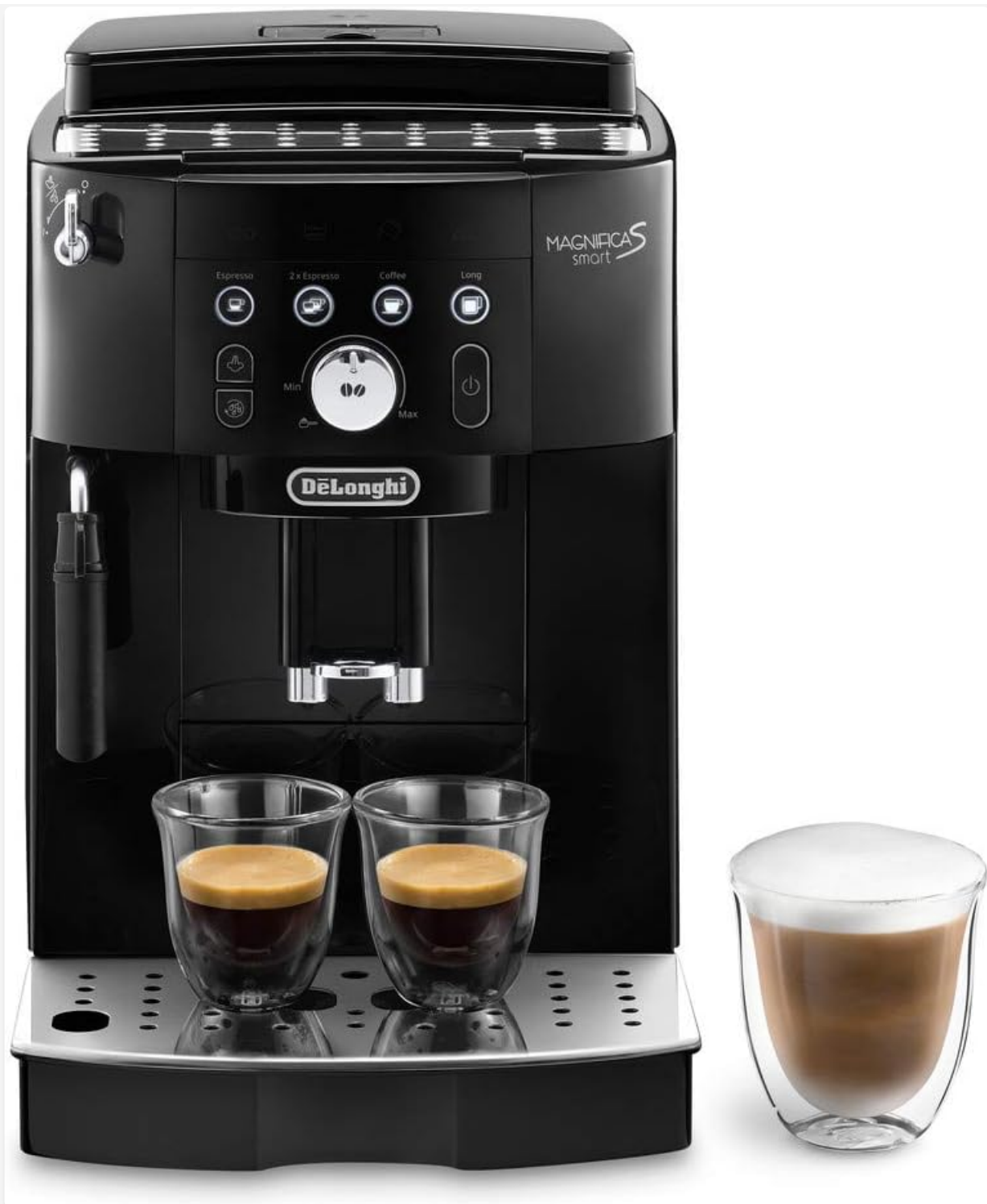
Figure 1.1: De'Longhi Magnifica S Smart ECAM230.13.B Automatic Coffee Machine.

This image displays the De'Longhi Magnifica S Smart ECAM230.13.B coffee machine in black, featuring its control panel, coffee spouts, and drip tray. Two glasses of espresso and one glass of latte macchiato are positioned next to the machine, showcasing its beverage capabilities.