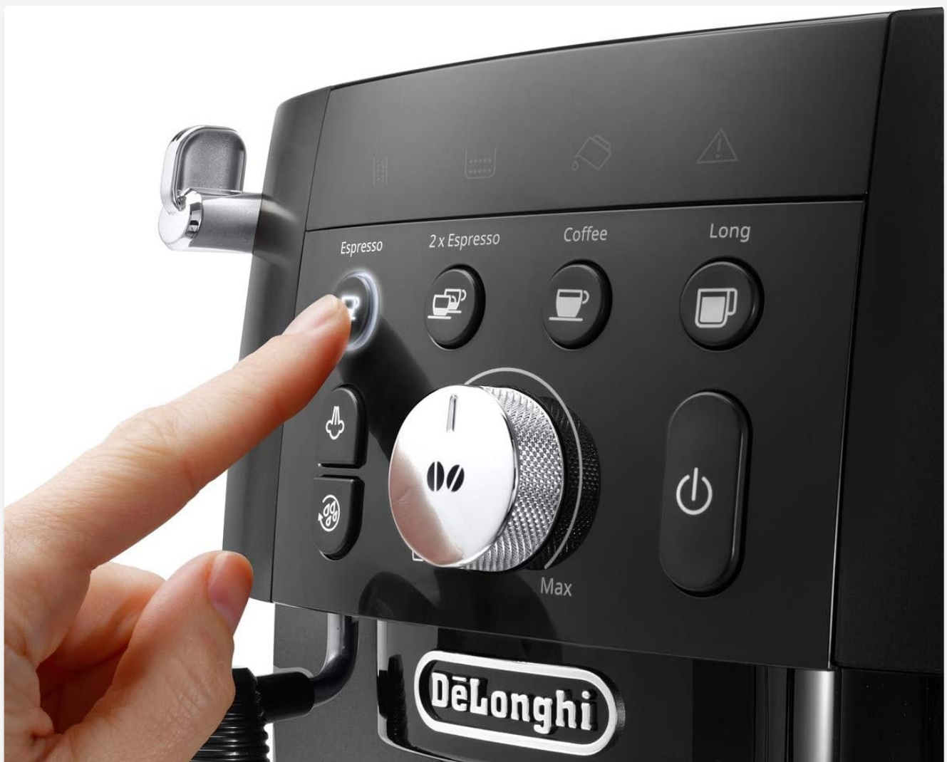
Figure 3.1: Control Panel Detail.