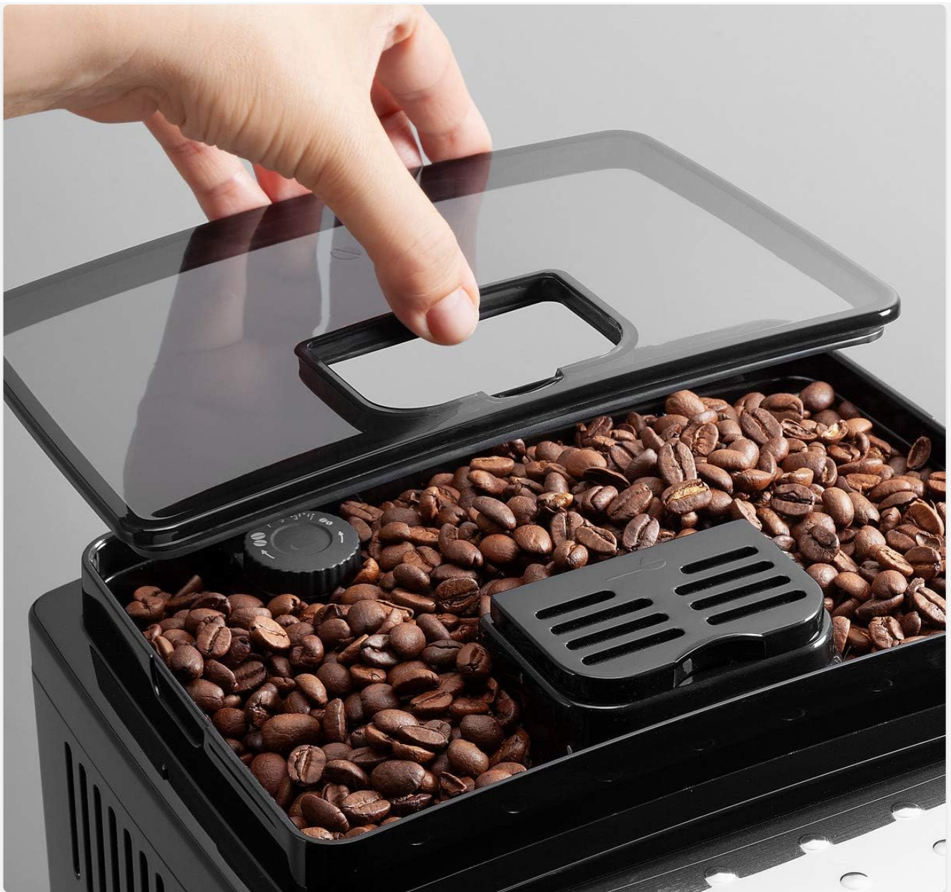
Figure 4.1: Adding Coffee Beans.

This image shows a hand lifting the lid of the coffee bean hopper on the De'Longhi Magnifica S Smart ECAM230.13.B, with a generous amount of coffee beans visible inside, ready for grinding.