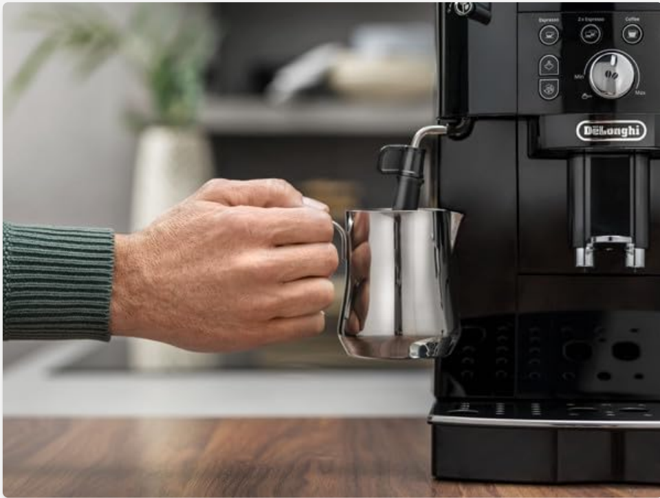
Figure 5.2: Detailed Milk Frothing.

A closer view of the milk frothing process, showing a hand holding a metal pitcher with milk under the steam wand of the De'Longhi Magnifica S Smart ECAM230.13.B, emphasizing the precise positioning for optimal frothing.