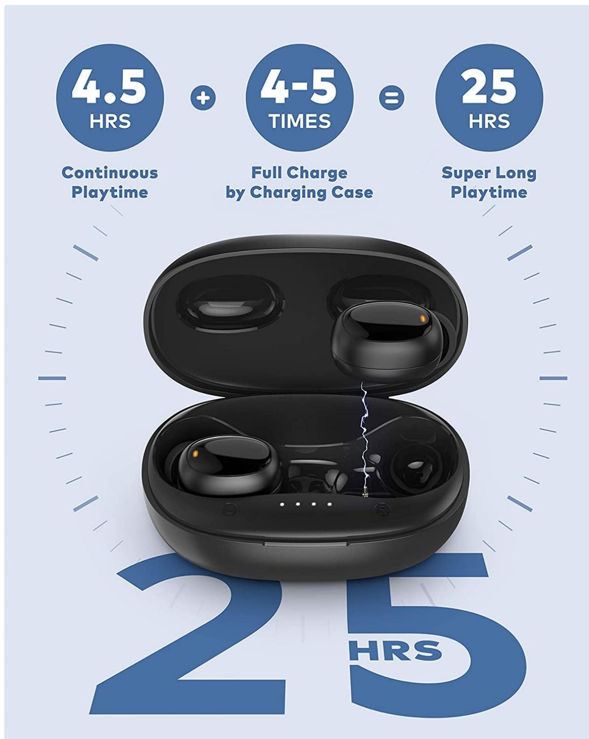
Image: Visual representation of earbuds charging within the case, highlighting battery life and charging time.