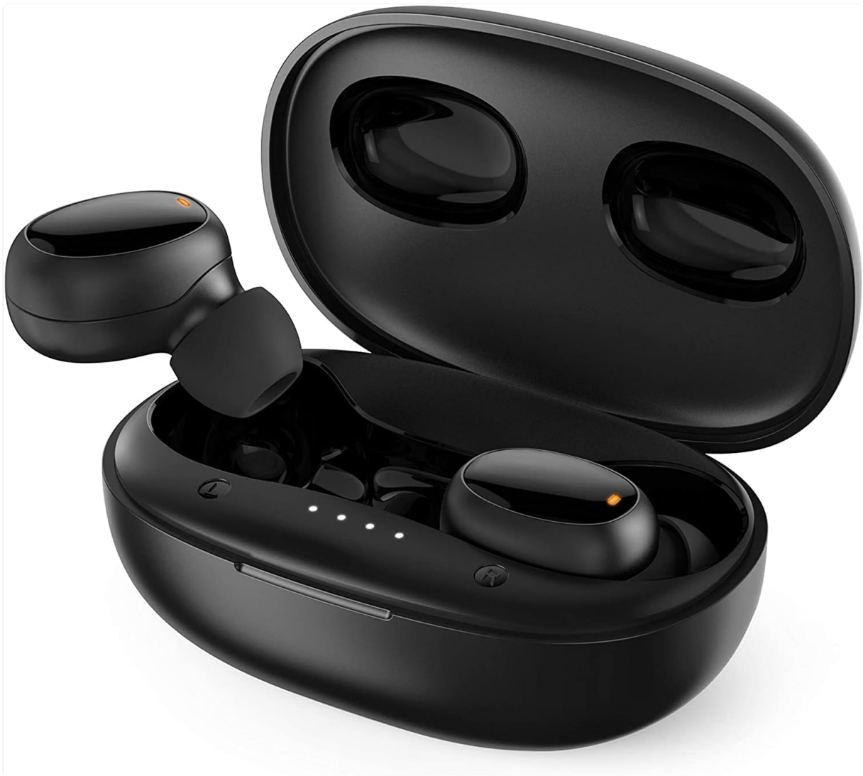
Image: FALWEDI T21 True Wireless Earbuds in their open charging case, showing the earbuds and charging indicators.