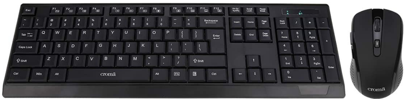
Image: The Croma wireless keyboard and mouse set, showcasing both components.