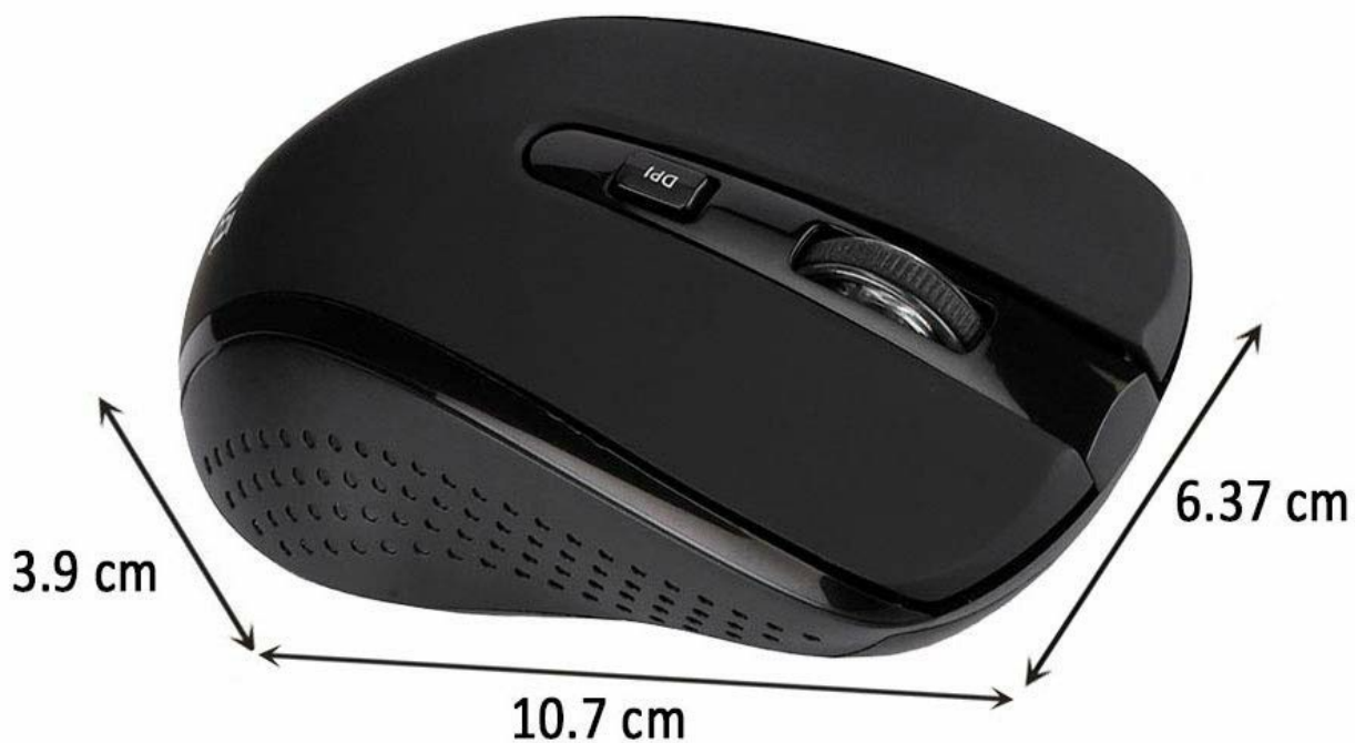
Image: The mouse with dimensions (10.7 cm length, 6.37 cm width, 3.9 cm height).