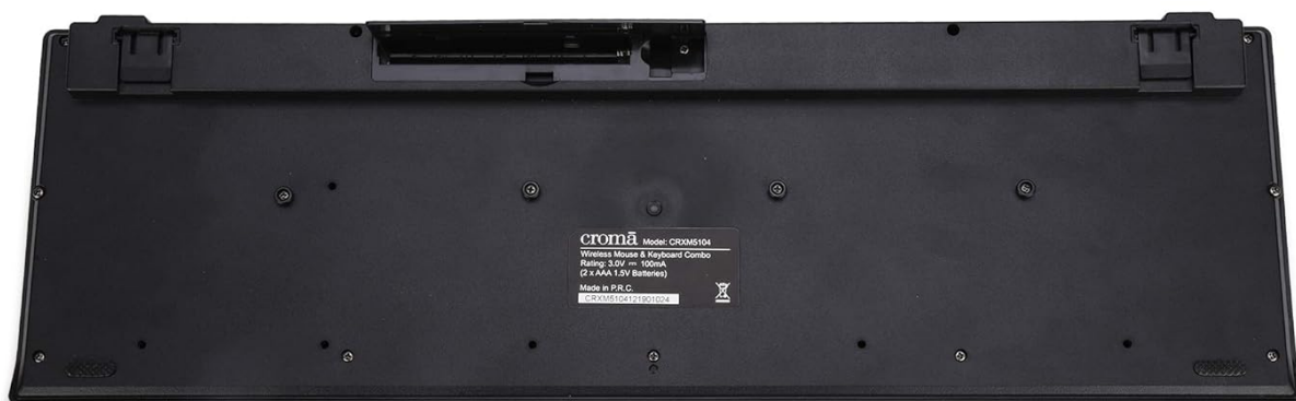
Image: Underside of the keyboard showing the battery compartment.