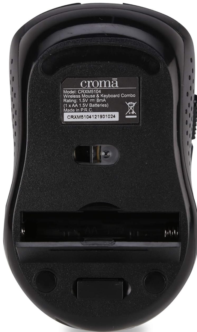
Image: Underside of the mouse showing the battery compartment.