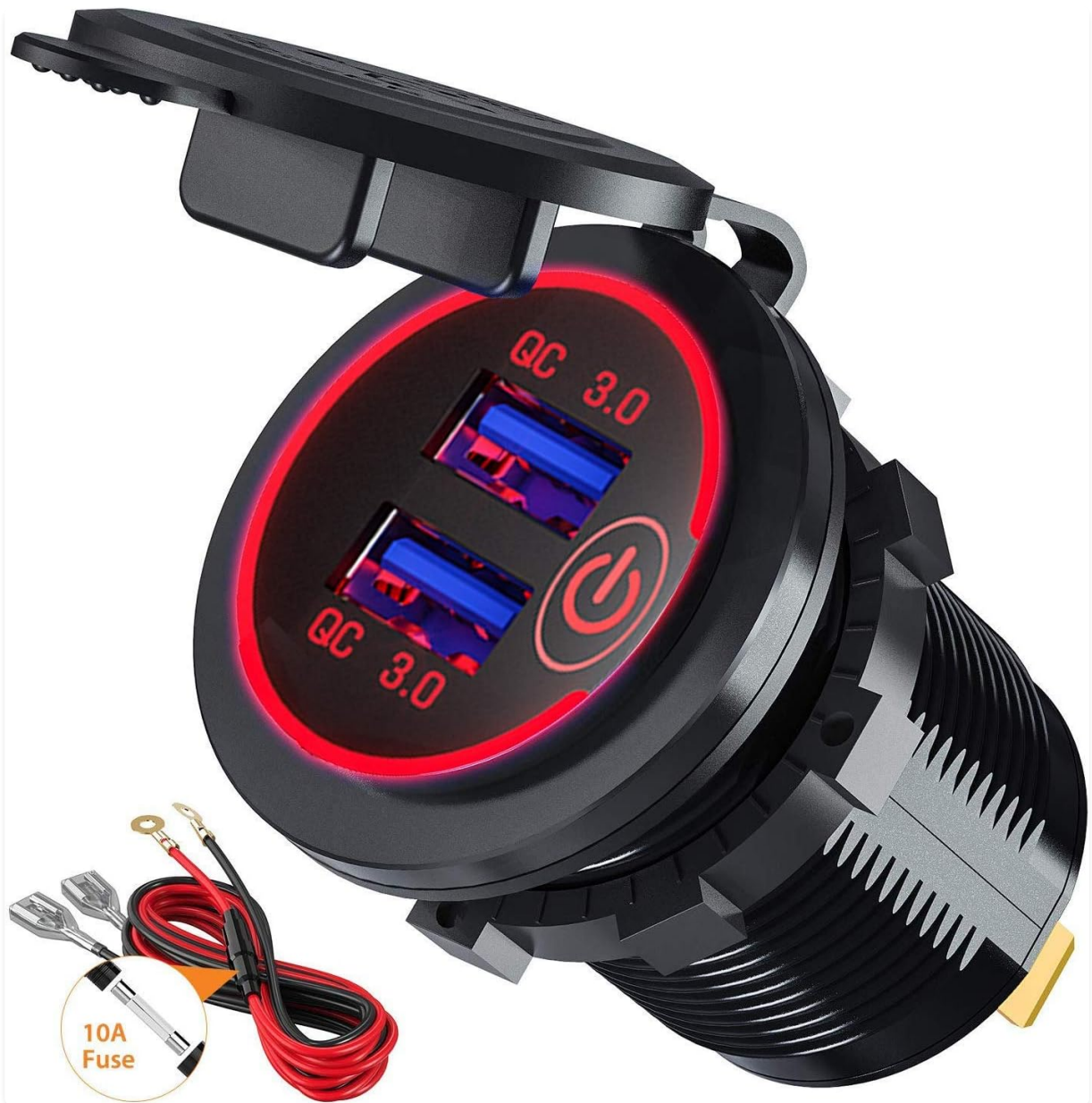
Image 1.1: GemCoo Quick Charge 3.0 Dual USB Car Charger Socket with included wiring and 10A fuse.