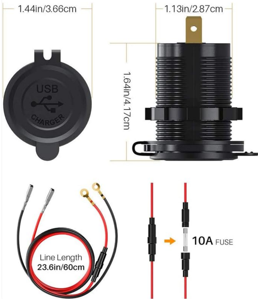
Image 5.1: Detailed diagram illustrating the charger's dimensions, wiring connections, and the placement of the 10A fuse.