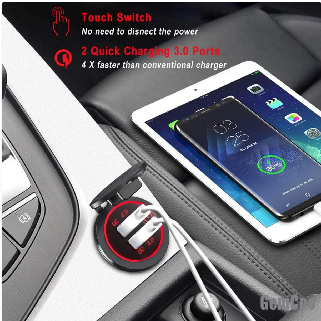
Image 2.1: The charger installed in a vehicle, demonstrating its dual charging capability for a smartphone and tablet.