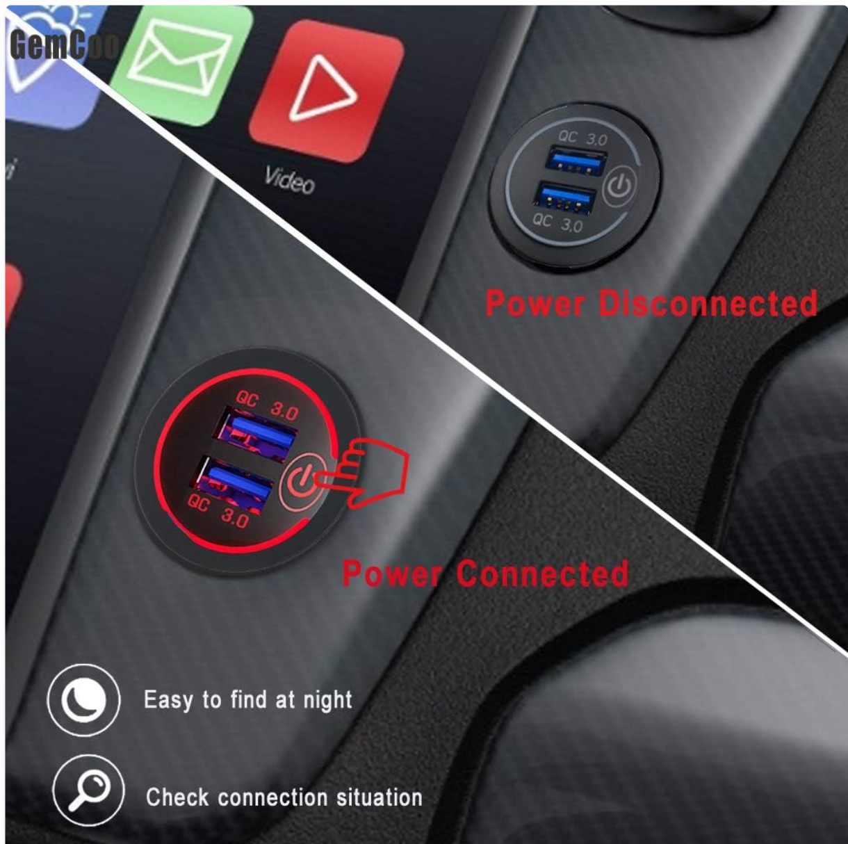
Image 6.1: Illustration of the charger's LED indicator when power is connected versus disconnected, and the touch switch.