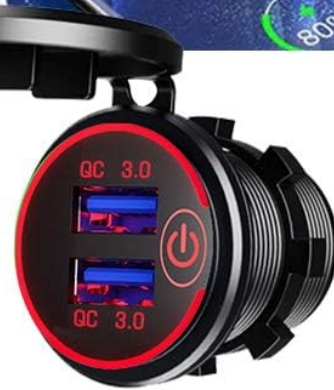
Image 6.2: Visual comparison demonstrating the faster charging capability of QC3.0 technology compared to a standard 2.1A charger.