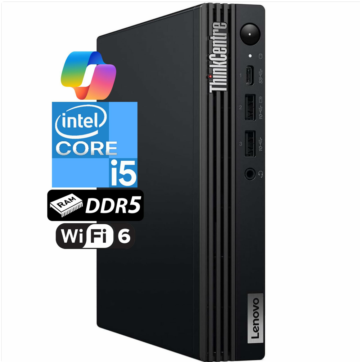
Figure 2.1: Lenovo ThinkCentre Tiny M70q Gen 5 highlighting Intel Core i5 14th Gen, 32GB DDR5 Memory, and 1TB NVMe Storage.