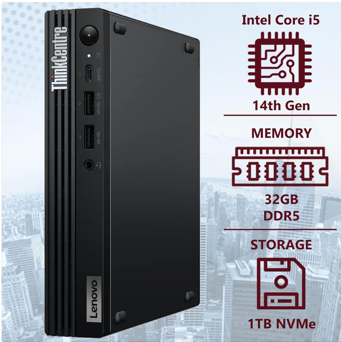
Figure 2.2: Detailed view of the Lenovo ThinkCentre Tiny M70q Gen 5 ports, including USB-A, USB-C, HDMI, DisplayPort, and Ethernet.

The ThinkCentre M70q Gen 5 provides a comprehensive array of ports for all your peripheral needs: