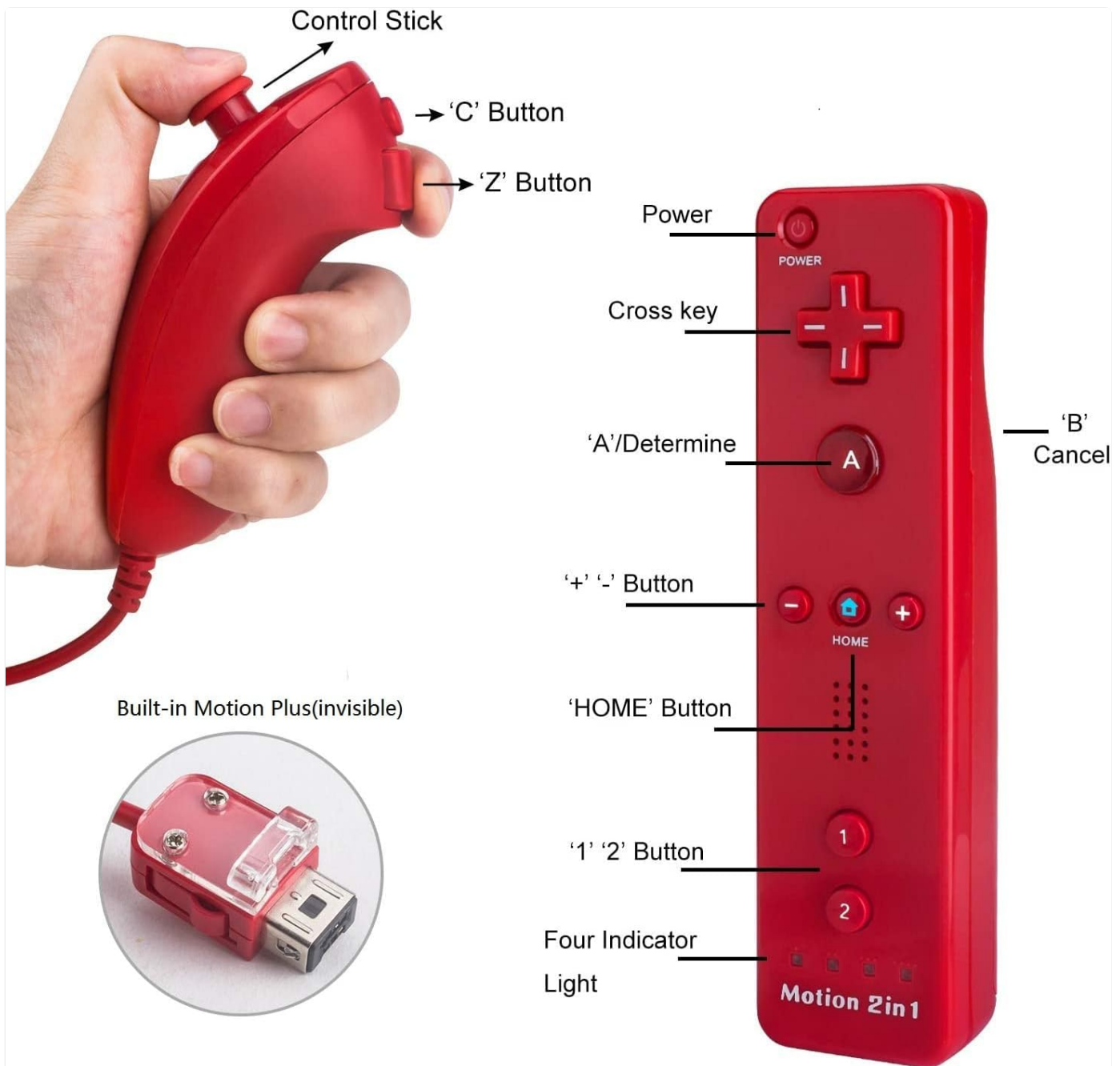
Image: Labeled diagram of the Wii Remote and Nunchuck, highlighting the function of each button and the integrated Motion Plus.