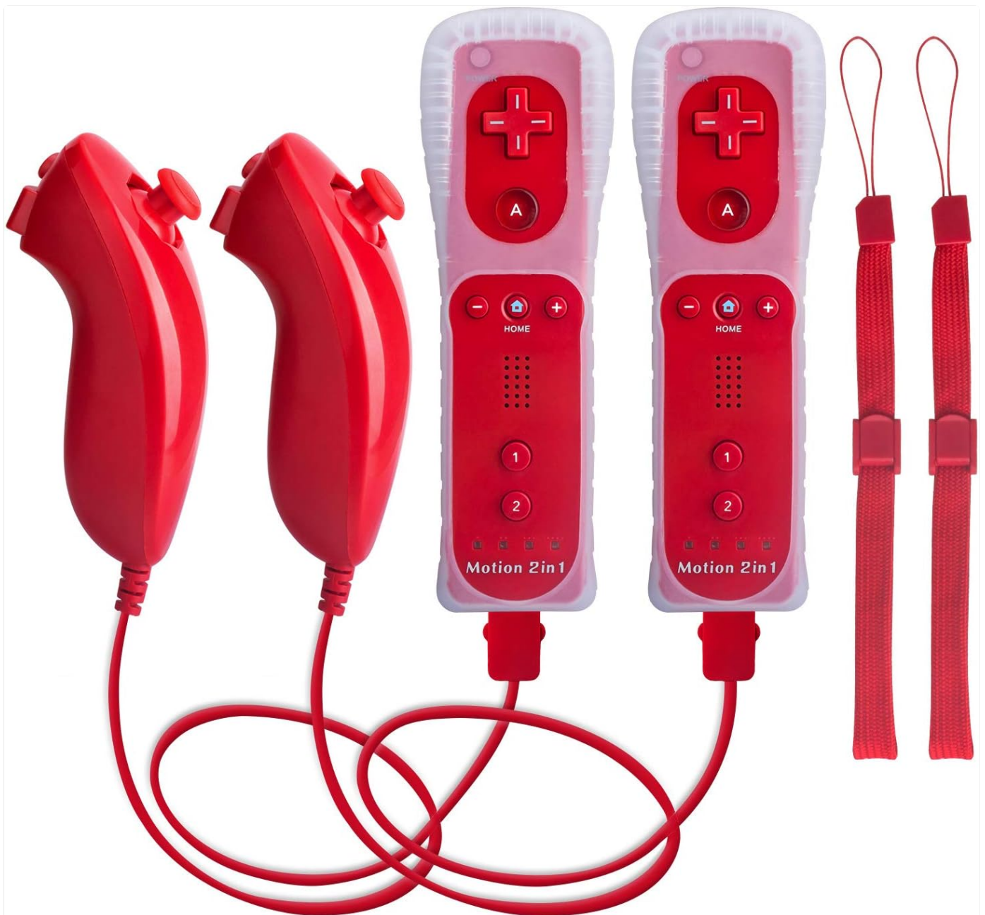
Image: Complete package contents including two red Wii Remote controllers, two Nunchuck controllers, two silicone protective cases, and two wrist straps.