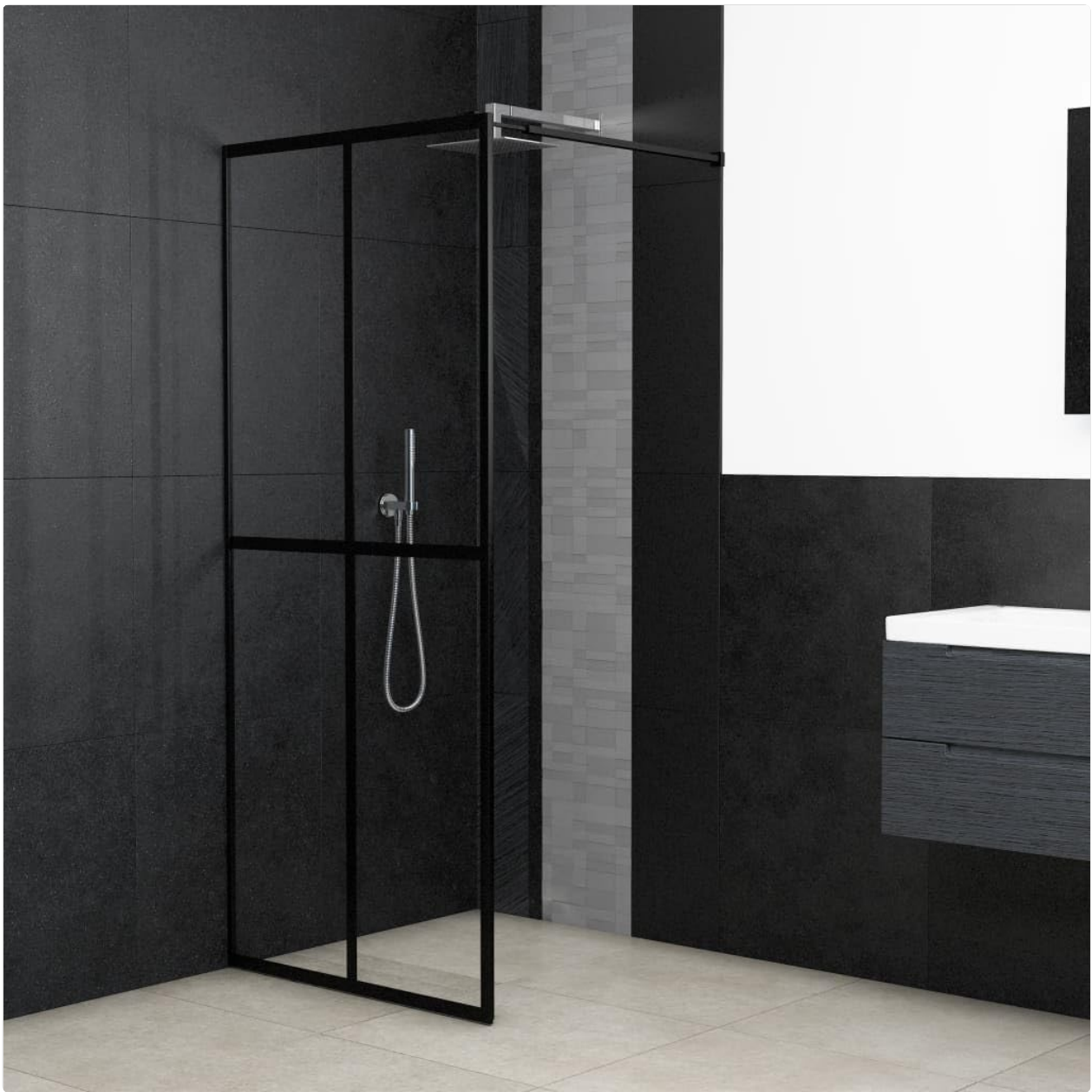
Image 1.1: The vidaXL Walk-in Shower Screen installed in a bathroom setting.