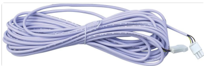
Image: A coiled white electrical cable with connectors at both ends, serving as a 10-meter extension for the remote control.