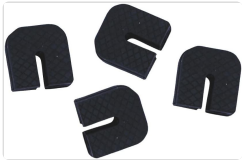
Image: Four black U-shaped anti-vibration rubber mounts.