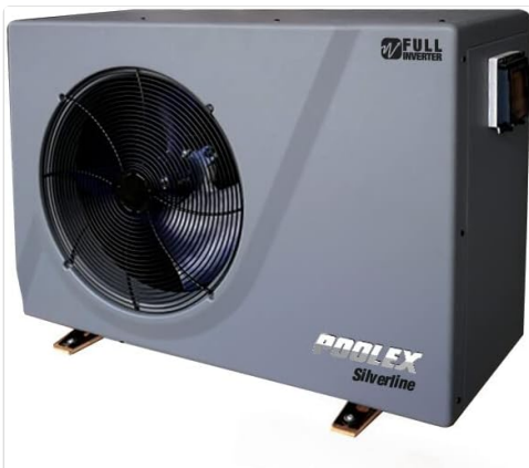
Image: The primary POOLEX Silverline Inverter heat pump unit in gray, featuring a large fan on the side and the 'FULL INVERTER' logo.