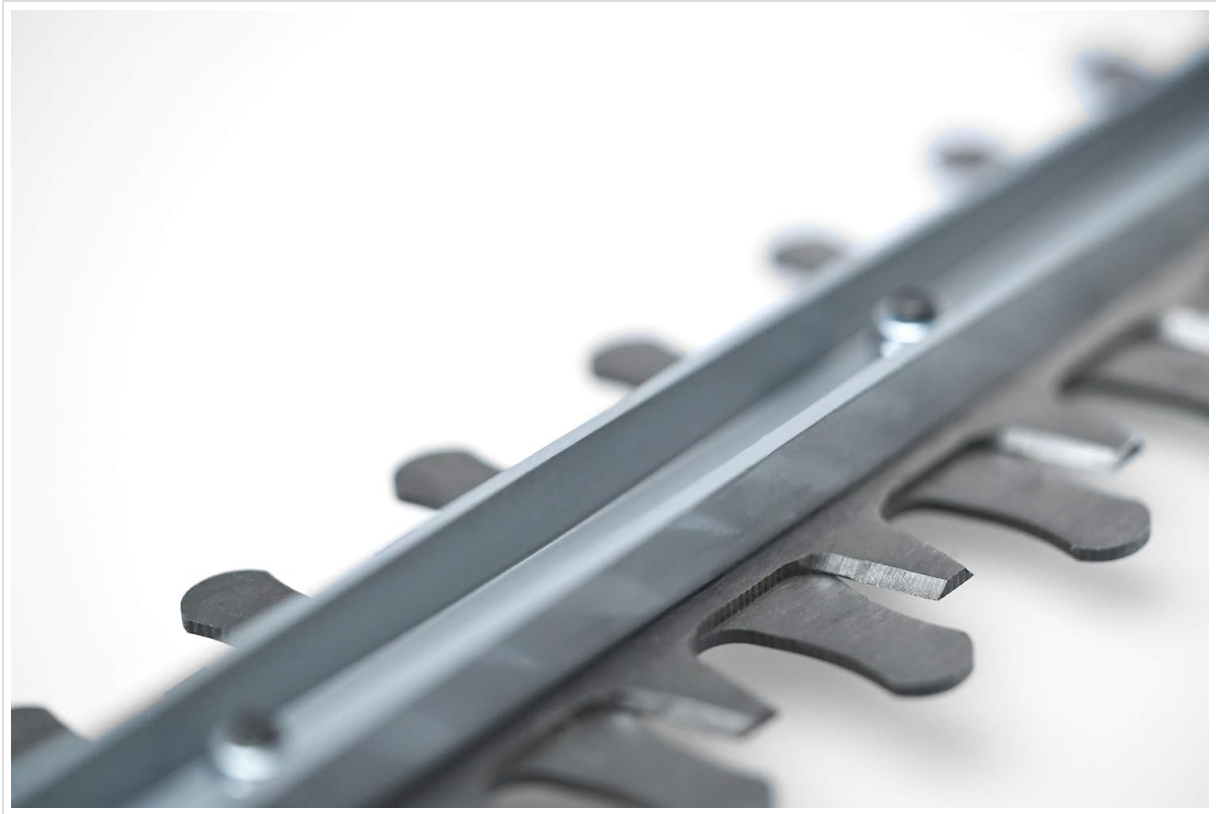
Image: Close-up view of the hedge trimmer's stainless steel cutting blades, showing their sharp edges and spacing.