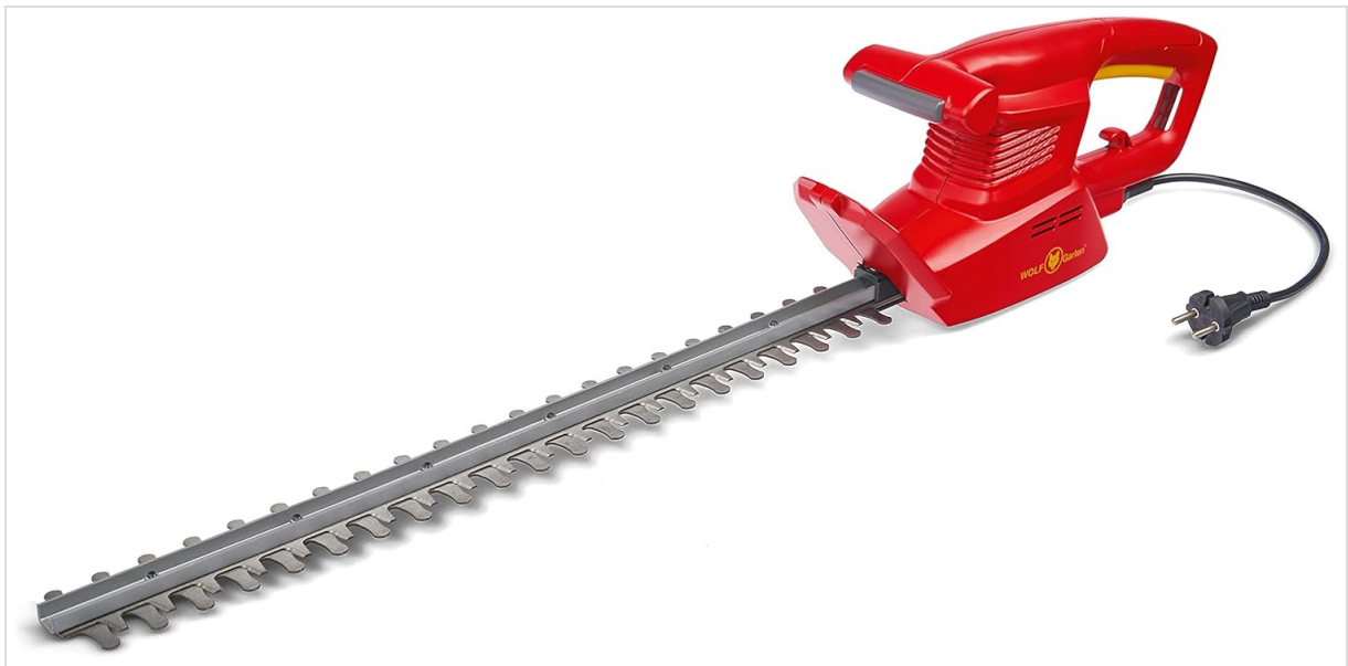
Image: Overall view of the WOLF-Garten LYCOS E/500 H Electric Hedge Trimmer, showing the red housing, long blade, and power cord.