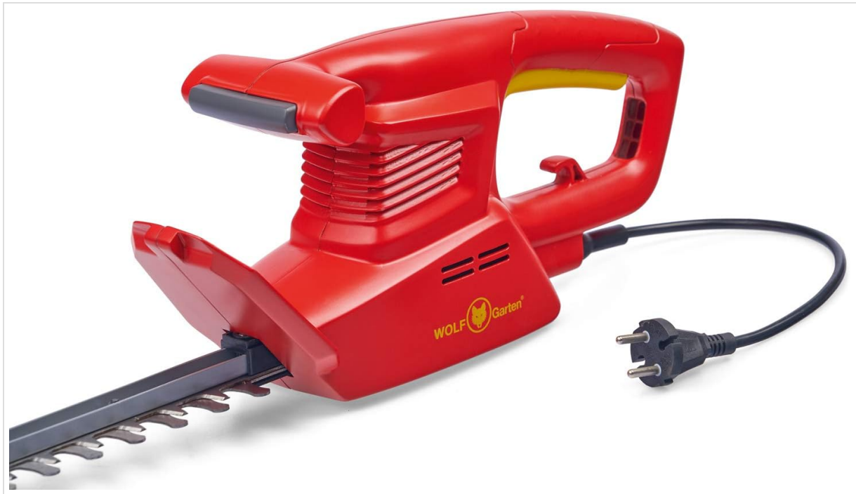
Image: Close-up view of the hedge trimmer's handles, showing the ergonomic design and the position of the safety switch and main trigger.