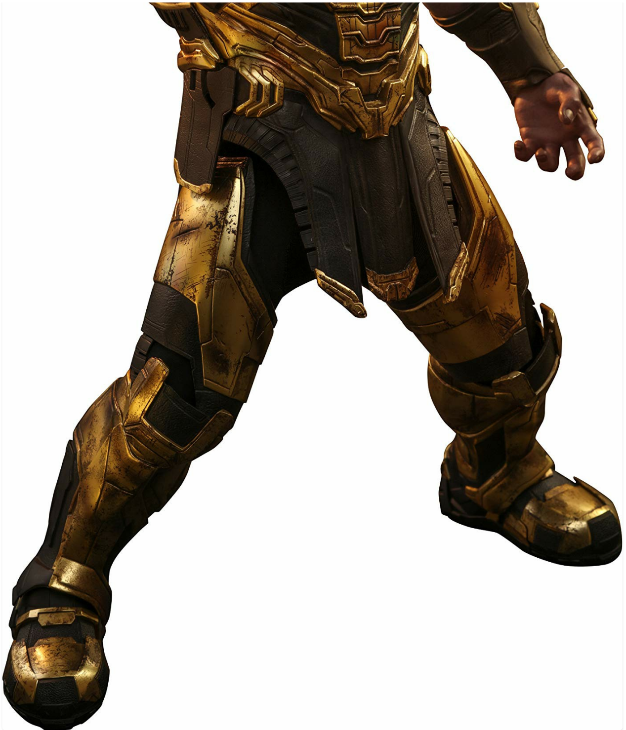
Image 1.1: The Hot Toys 1/6 Scale Thanos Battle Damaged Version collectible figure.