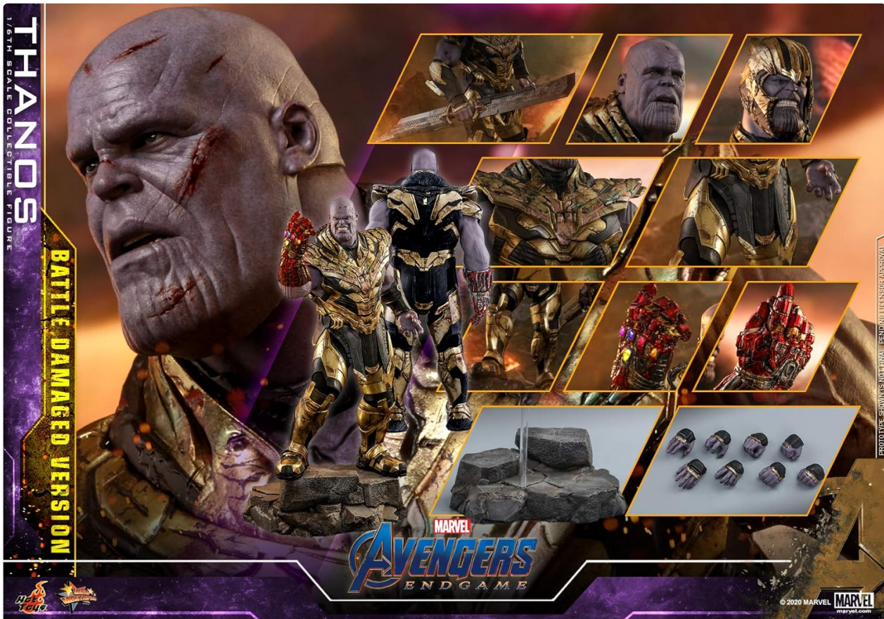
Image 3.1: All included accessories and interchangeable parts for the Thanos figure.