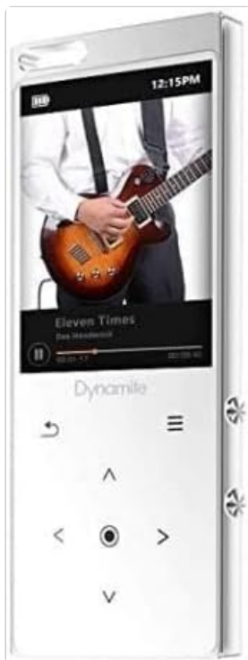
Figure 1: Samvix Dynamite MP3 Player. This image displays the white MP3 player from a slight angle, highlighting its screen which shows a music track playing with an image of a person holding a guitar. The touch-sensitive navigation buttons are visible below the screen.

The Samvix Dynamite MP3 Player is a versatile digital audio device designed for high-quality music playback and various other functions. It features a durable metal body, touch-sensitive buttons, and an integrated speaker. This model is specifically designed without radio, video, or photo capabilities, making it suitable for specific user preferences.