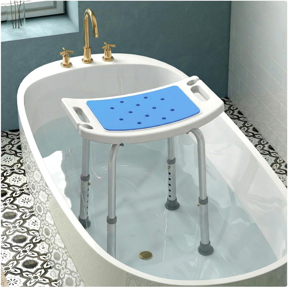
Stool in a bathtub.