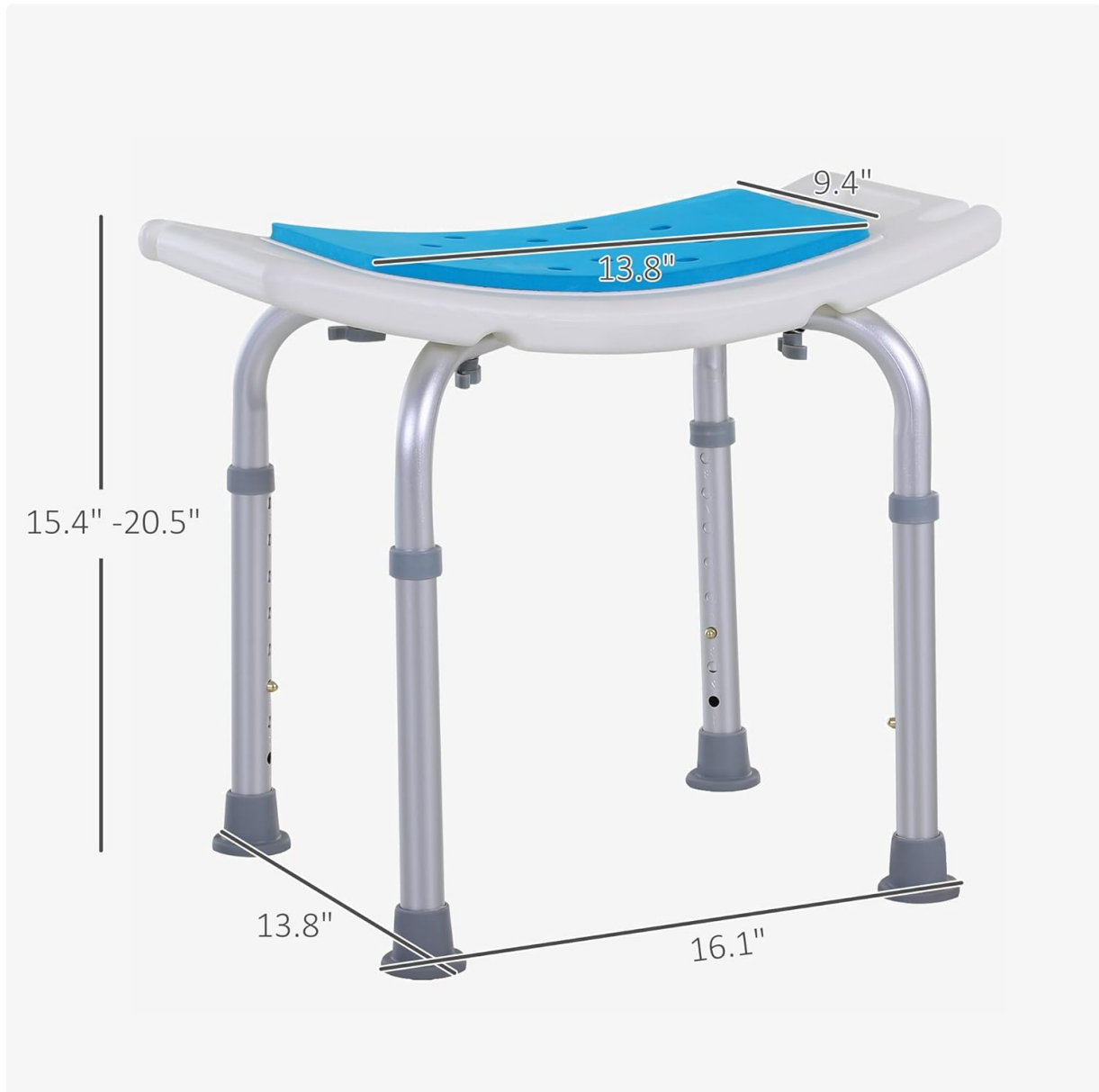
Image: Key dimensions of the bath stool.