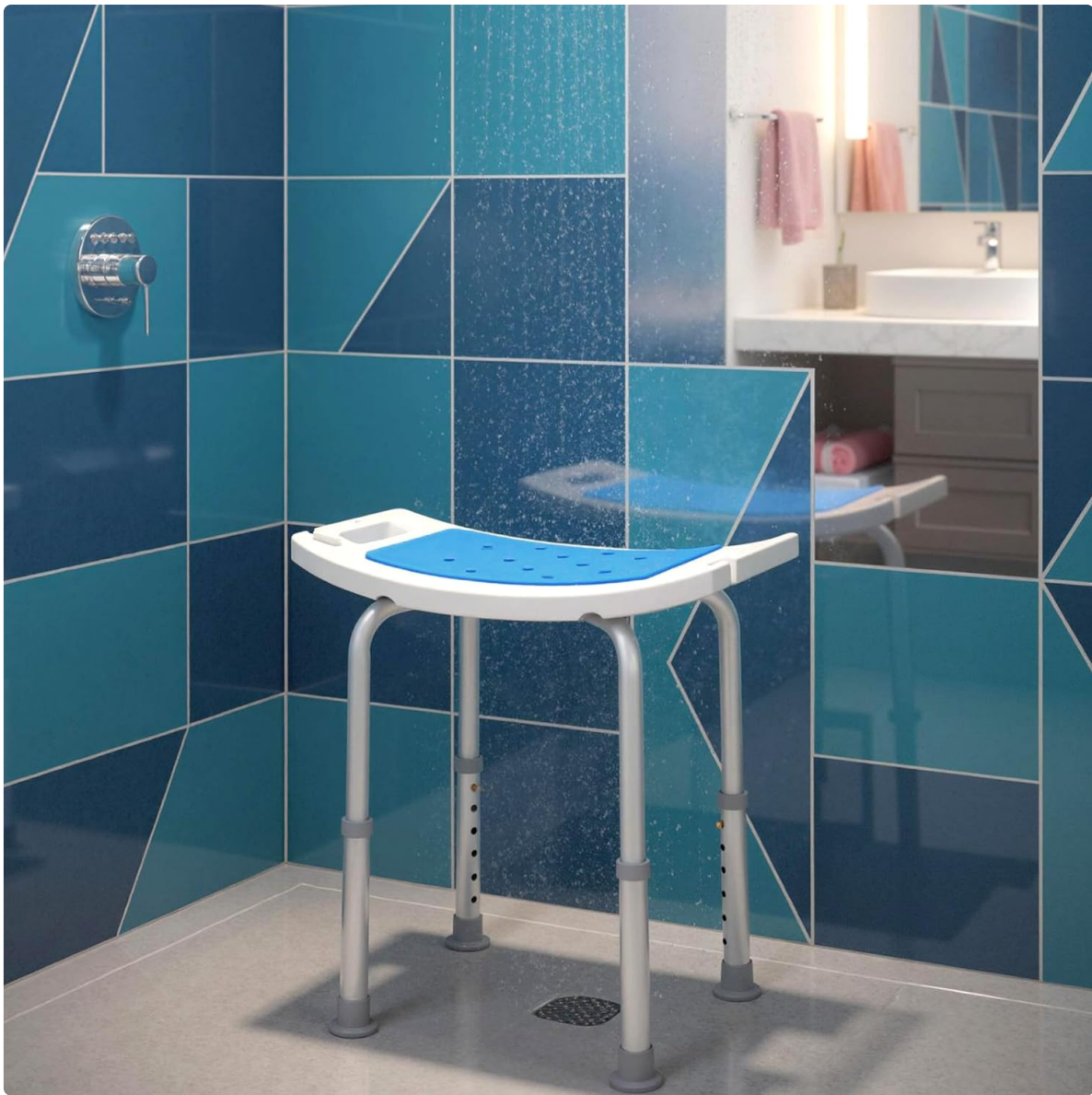
Image: Stool in a shower stall.