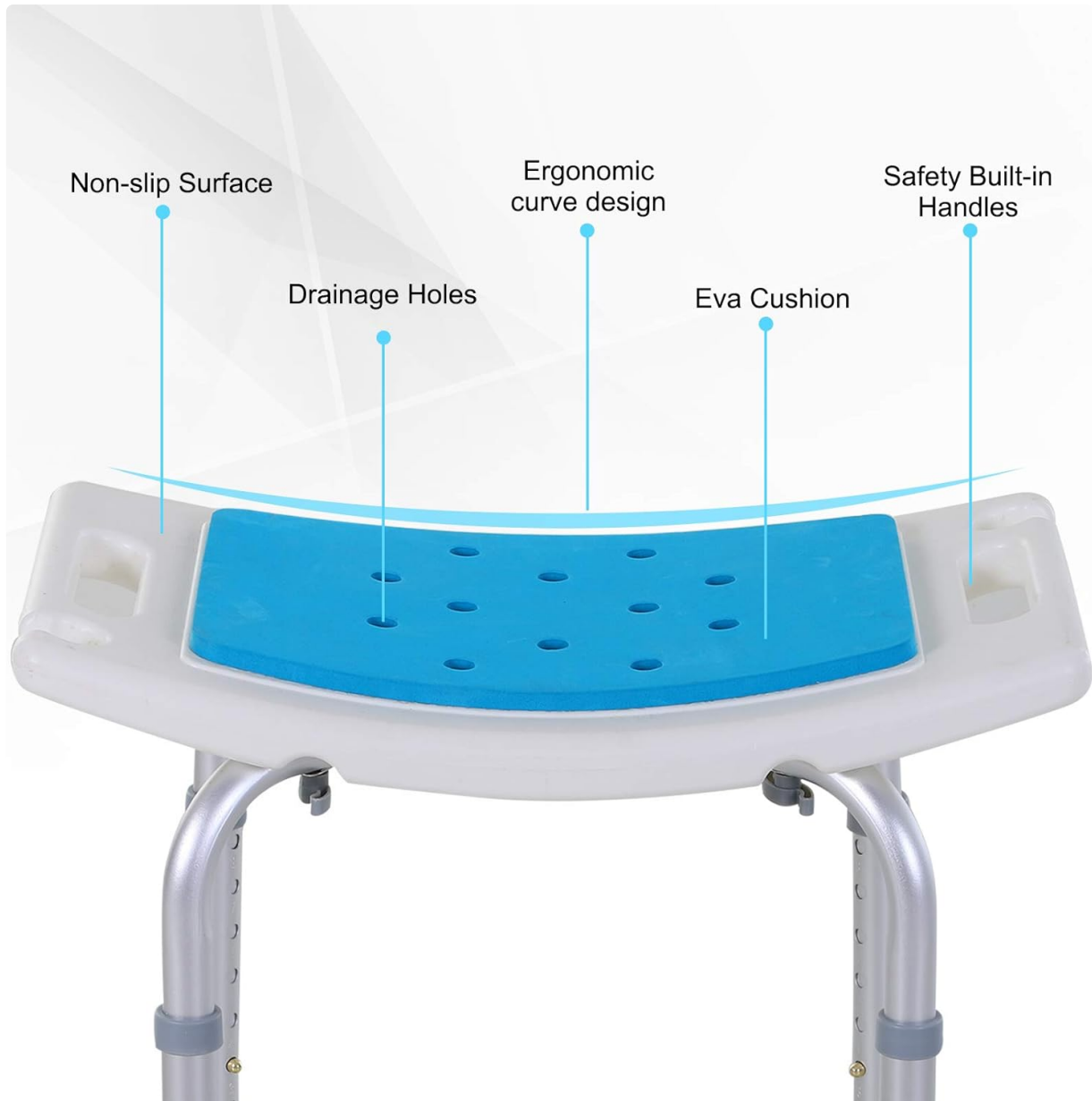
Image: Detailed view of the seat features including the non-slip cushion and drainage holes.