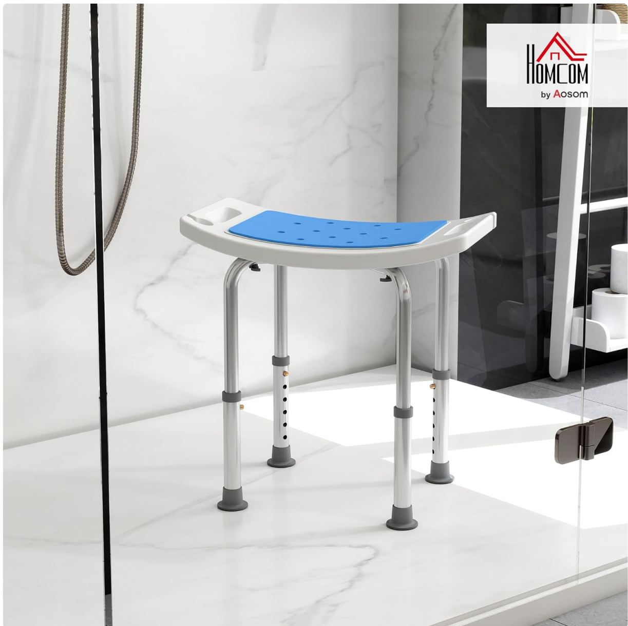
Image: The HOMCOM bath stool positioned inside a shower area.