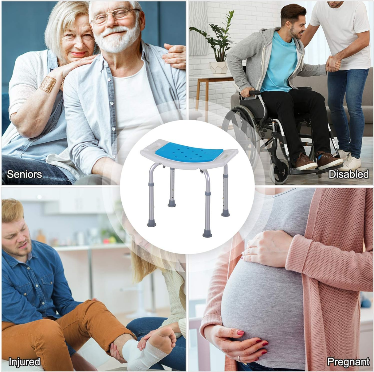
Image: Examples of users benefiting from the bath stool.