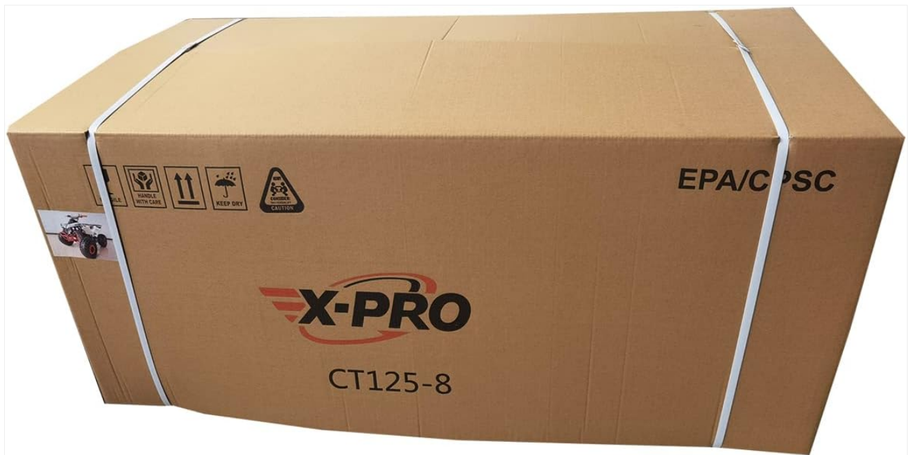
Image: X-PRO Storm 125 ATV in its shipping box.