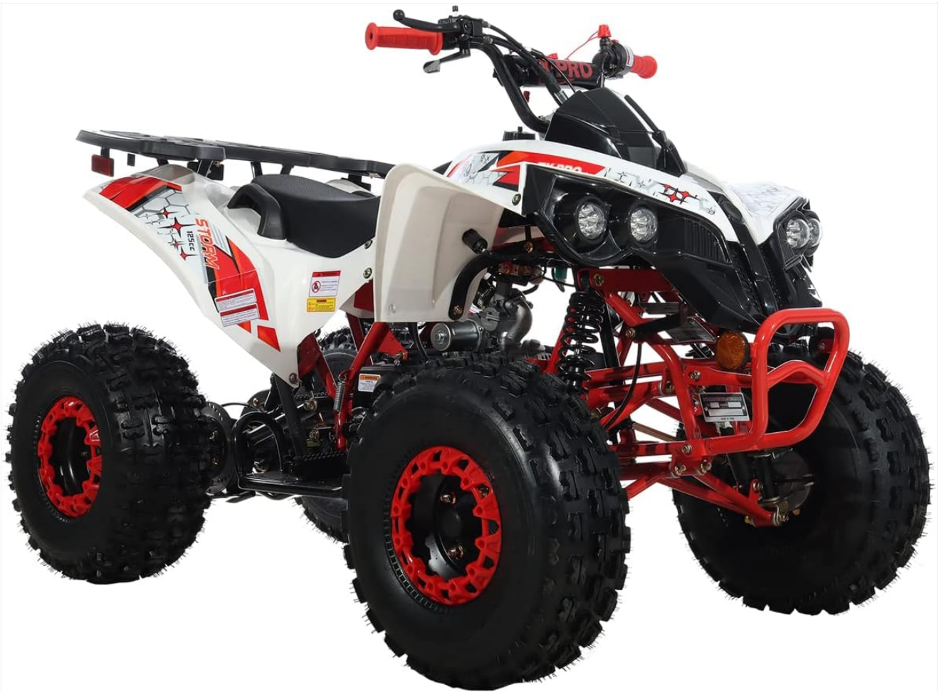
Image: Assembled X-PRO Storm 125 ATV, front-side view.