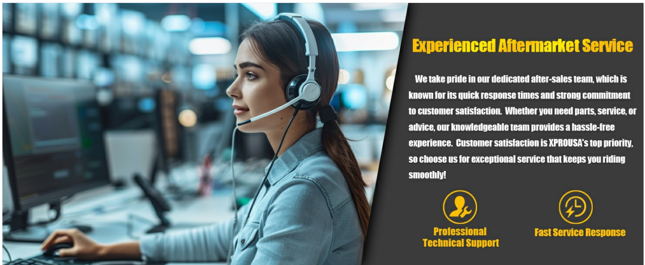
Image: X-PRO Experienced Aftermarket Service.

For parts, service, or advice, please visit the official X-PRO store or contact our customer support team. Our knowledgeable staff is dedicated to resolving issues and ensuring a hassle-free experience.