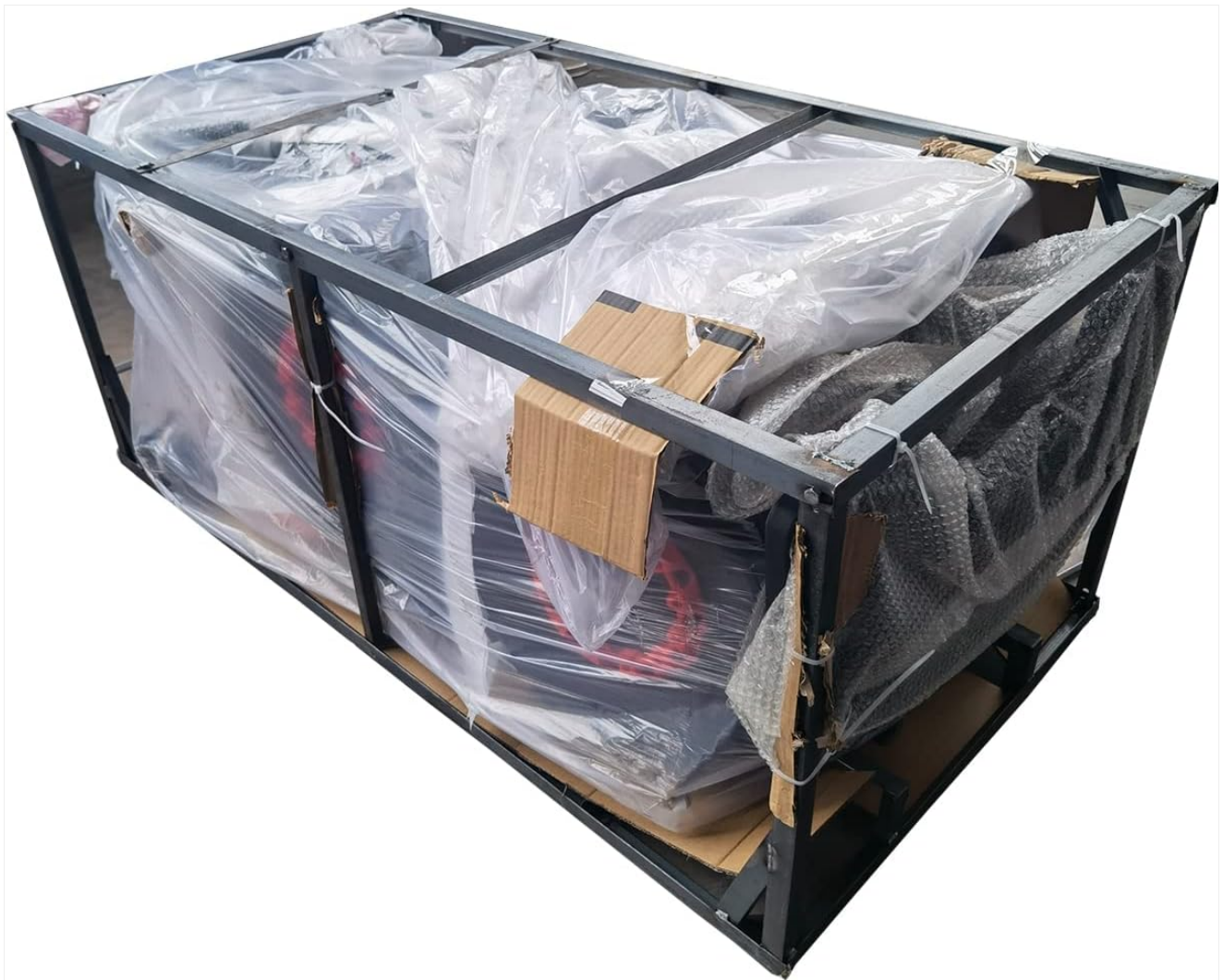
Image: X-PRO Storm 125 ATV secured within a metal crate.