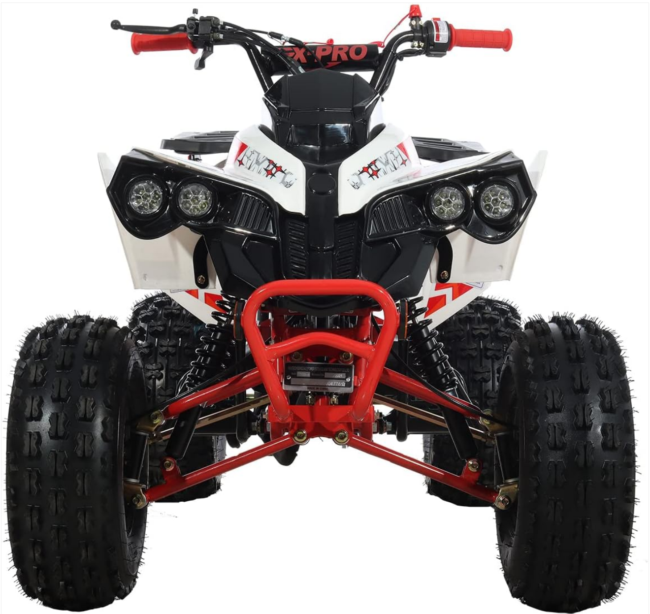
Image: Assembled X-PRO Storm 125 ATV, front view.