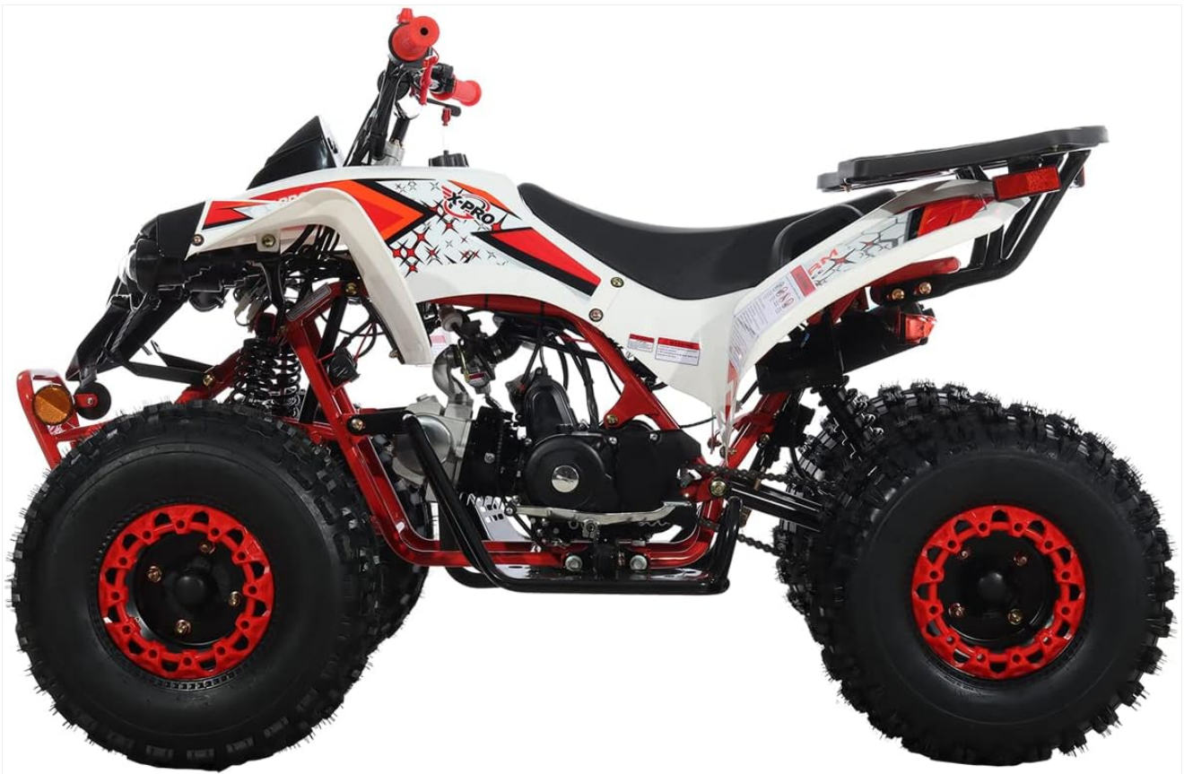
Image: Assembled X-PRO Storm 125 ATV, side view.