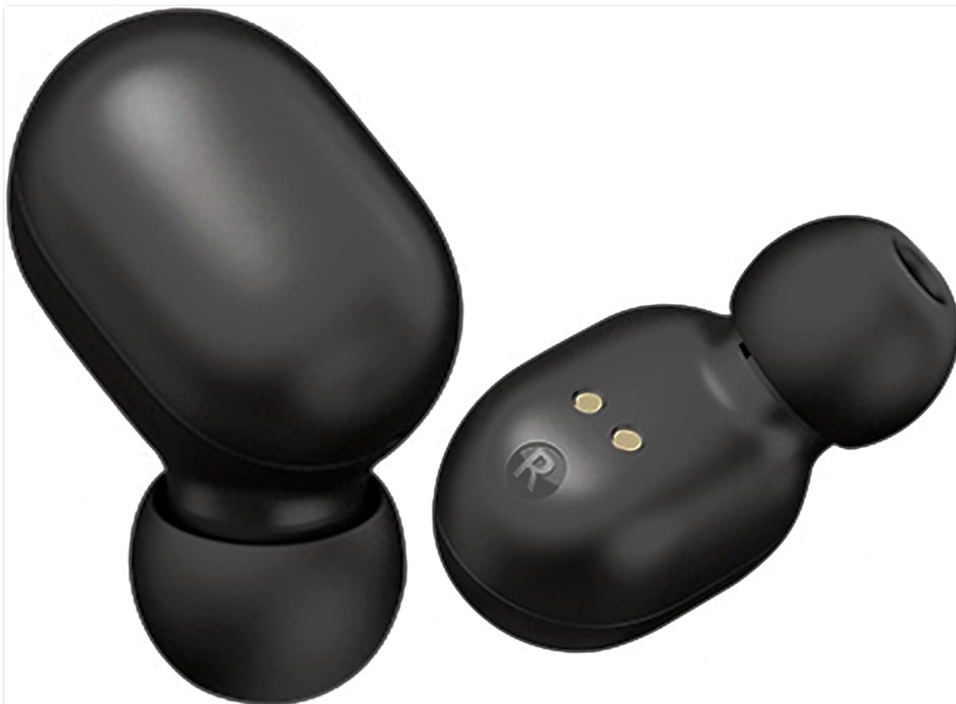
Figure 3: A detailed view of the Haylou GT1-PLUS earbuds, highlighting the charging contact points and the ergonomic shape designed for in-ear comfort.