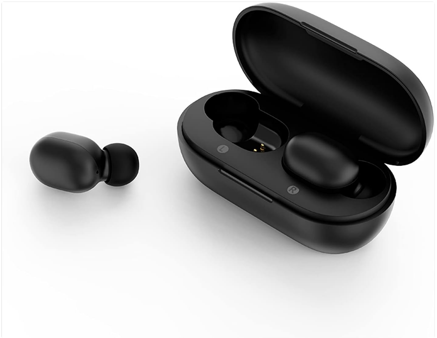
Figure 2: One Haylou GT1-PLUS earbud placed next to its open charging case, illustrating the individual earbud design and the charging contacts within the case.