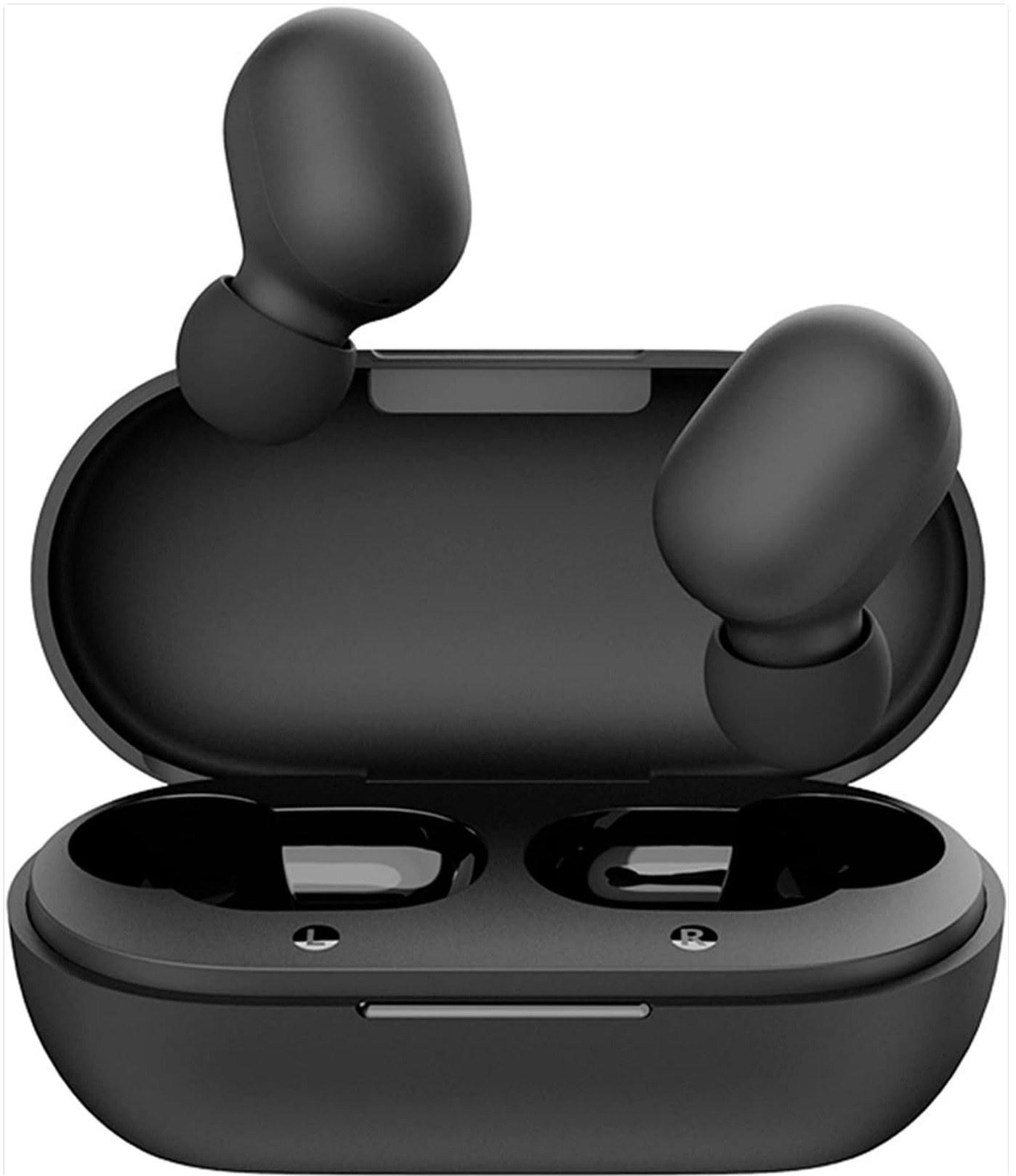
Figure 1: Haylou GT1-PLUS TWS Earbuds inside their charging case, showcasing the compact design and how they are stored.