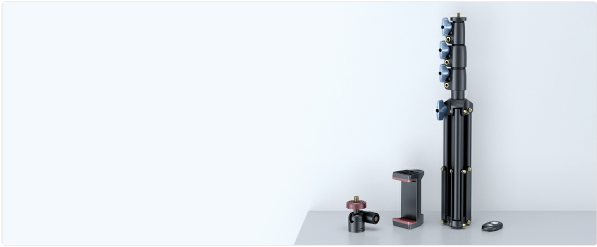
Image: The LINCO 8884SB Selfie Stick Tripod components laid out, showing the main pole, detachable tripod legs, phone holder, ball head, and remote control.