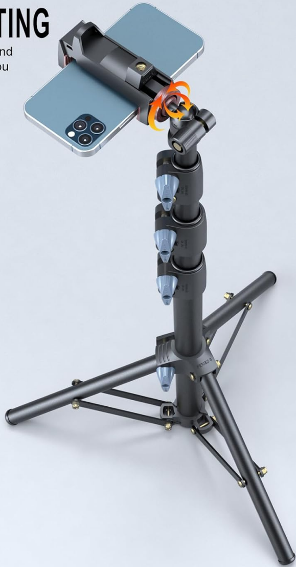
Image: The LINCO 8884SB tripod with a smartphone mounted, demonstrating the 360-degree rotation and tilt capabilities of the ball head for flexible shooting angles.