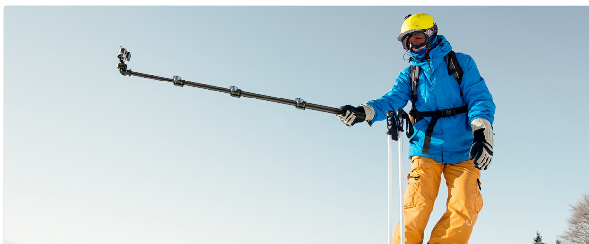
Image: A person skiing while holding the LINCO 8884SB in selfie stick mode, capturing a dynamic shot.