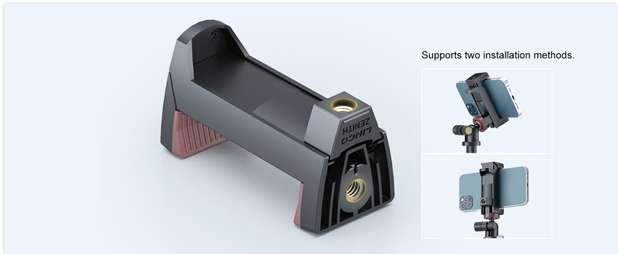
Image: Diagram showing two methods for installing the phone mount onto the ball head, allowing for both horizontal and vertical phone orientation.