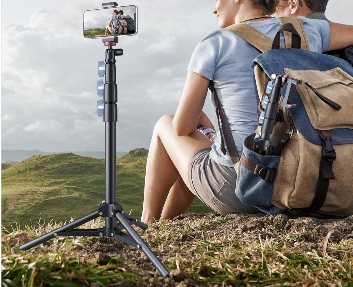
Image: The LINCO 8884SB Selfie Stick Tripod set up outdoors, demonstrating its portability and suitability for travel photography.