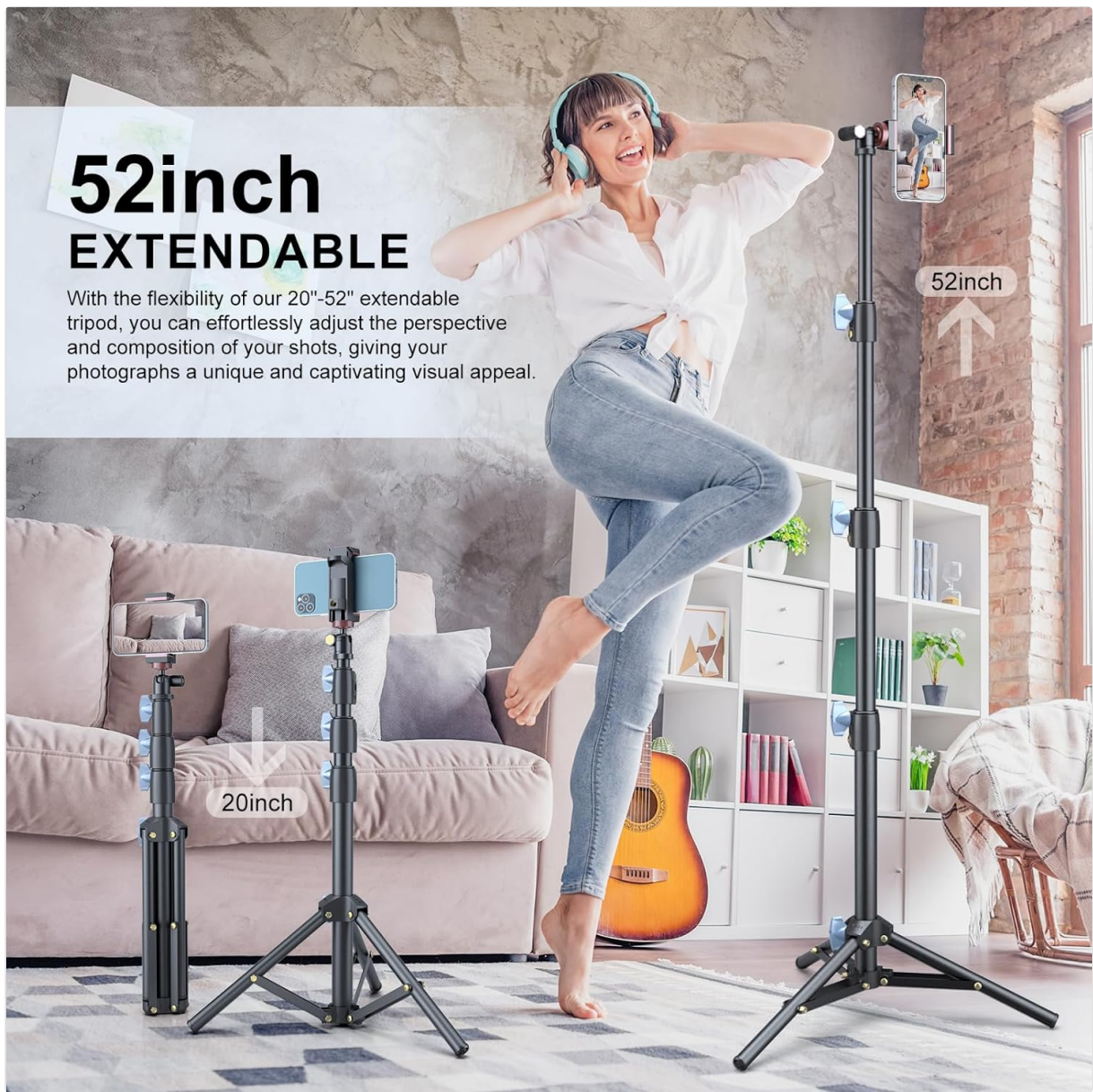
Image: The LINCO 8884SB Selfie Stick Tripod shown at its minimum (20 inches) and maximum (52 inches) extended heights, demonstrating its adjustable range.

With the flexibility of our 20"-52" extendable tripod, you can effortlessly adjust the perspective and composition of your shots, giving your photographs a unique and captivating visual appeal.