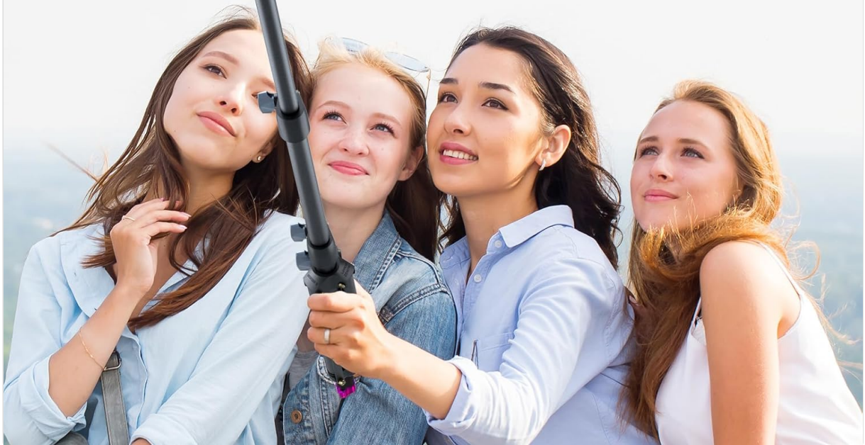
Image: A group of people using the LINCO 8884SB Selfie Stick with the Bluetooth remote control, illustrating its 33ft range for capturing moments.