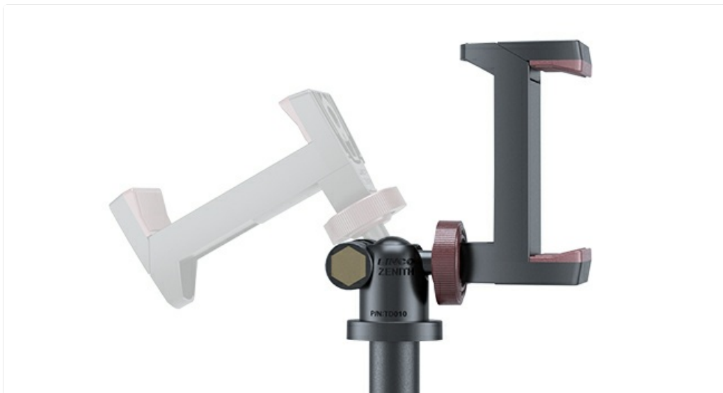
Image: A close-up view illustrating the tilting function of the phone mount on the ball head, allowing for vertical angle adjustments.