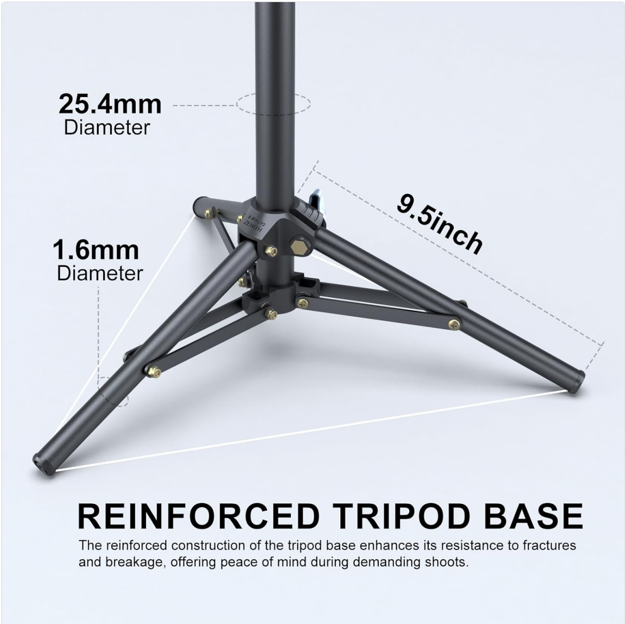
Image: Close-up view of the reinforced tripod base of the LINCO 8884SB, highlighting its 9.5-inch spread and 25.4mm diameter for stability.