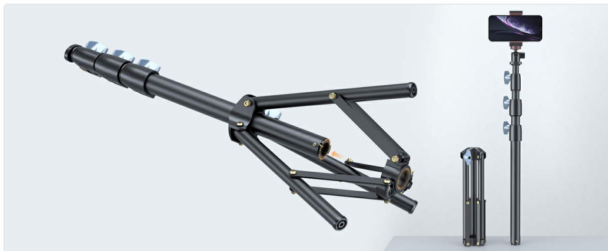
Image: Illustration showing how the tripod base can be detached from the main pole for compact storage or reattached for tripod functionality.