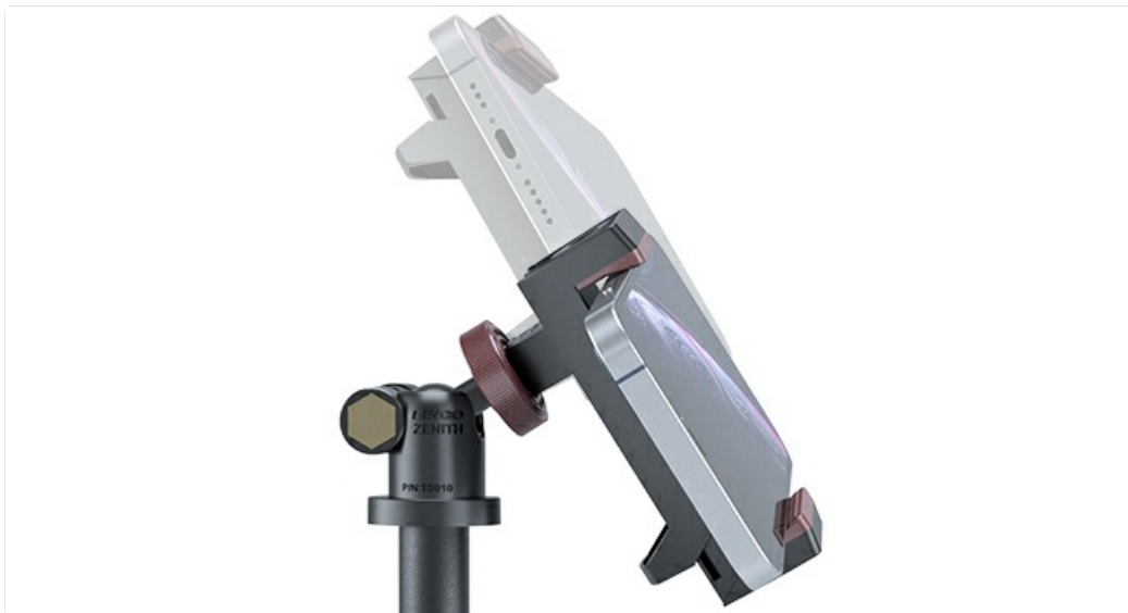
Image: A close-up view illustrating the rotational function of the phone mount on the ball head, enabling easy switching between portrait and landscape modes.