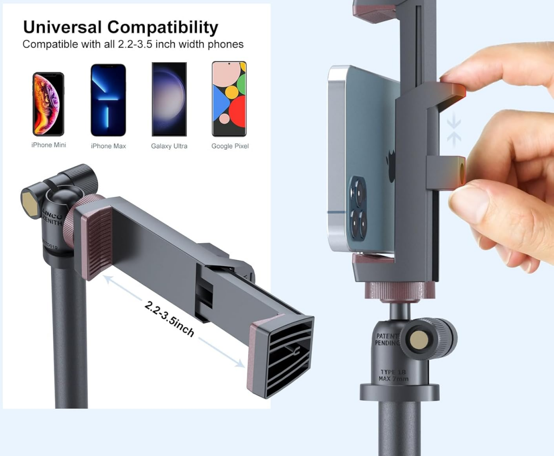
Image: A hand demonstrating the easy installation of a smartphone into the spring-loaded phone clamp, showing its universal compatibility with various phone models.

Enjoy a seamless setup experience with the phone clamp's easy-to-install design, allowing you to focus on capturing moments rather than struggling with complicated attachments.