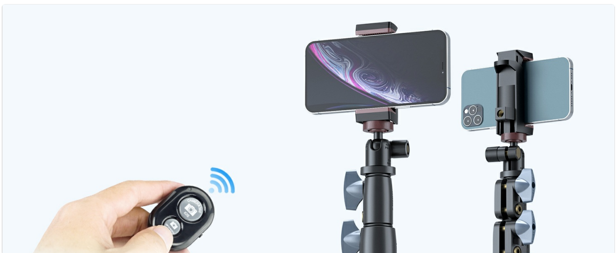
Image: A hand holding the Bluetooth remote control, with a smartphone mounted on the tripod in the background, indicating wireless control.