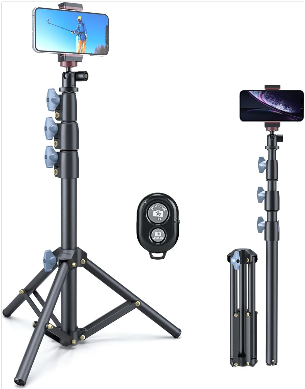
Image: All components of the LINCO 8884SB Selfie Stick Tripod, including the tripod base, extendable pole, phone mount, and Bluetooth remote control.