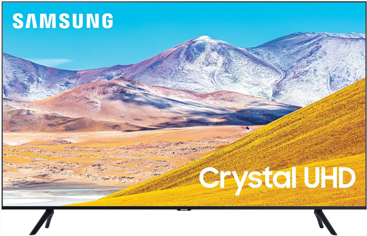
Front view of the Samsung 65-inch Crystal UHD TU-8000 Series 4K Smart TV.