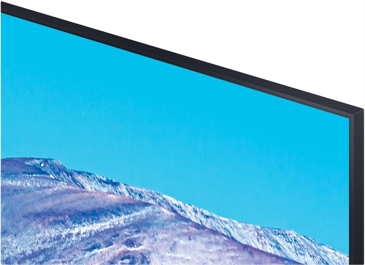
The slim profile of the Samsung Crystal UHD TV.