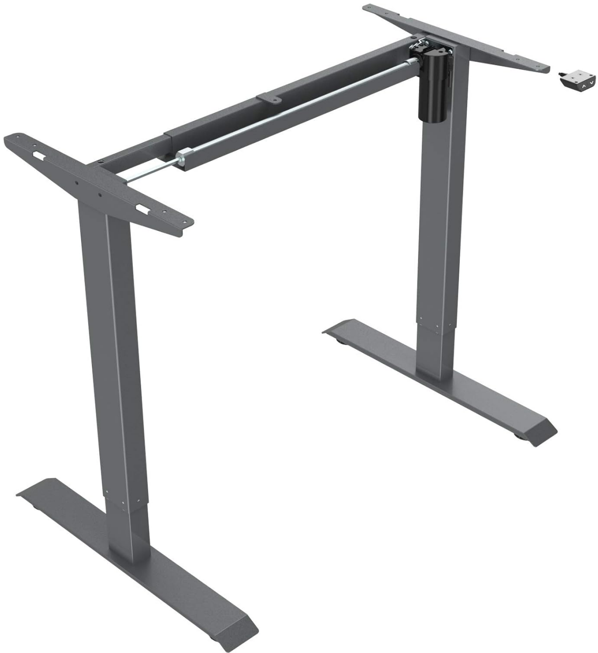
An angled view of the fully assembled Spacetronek SPE-114 desk frame, showcasing its sturdy construction and grey finish.