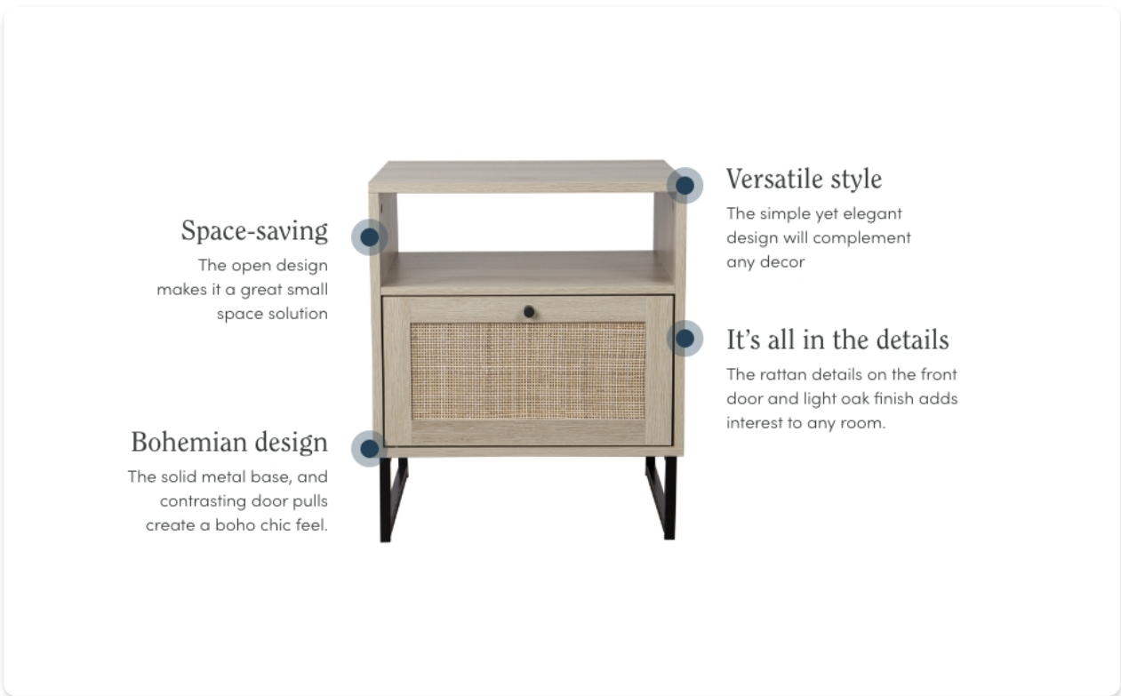
Figure 3: Key features and design elements of the table.