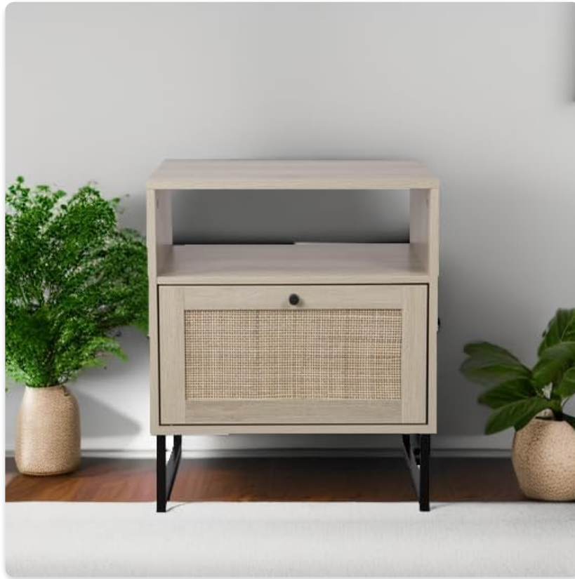
Figure 5: Detailed view of the rattan weave on the storage door.