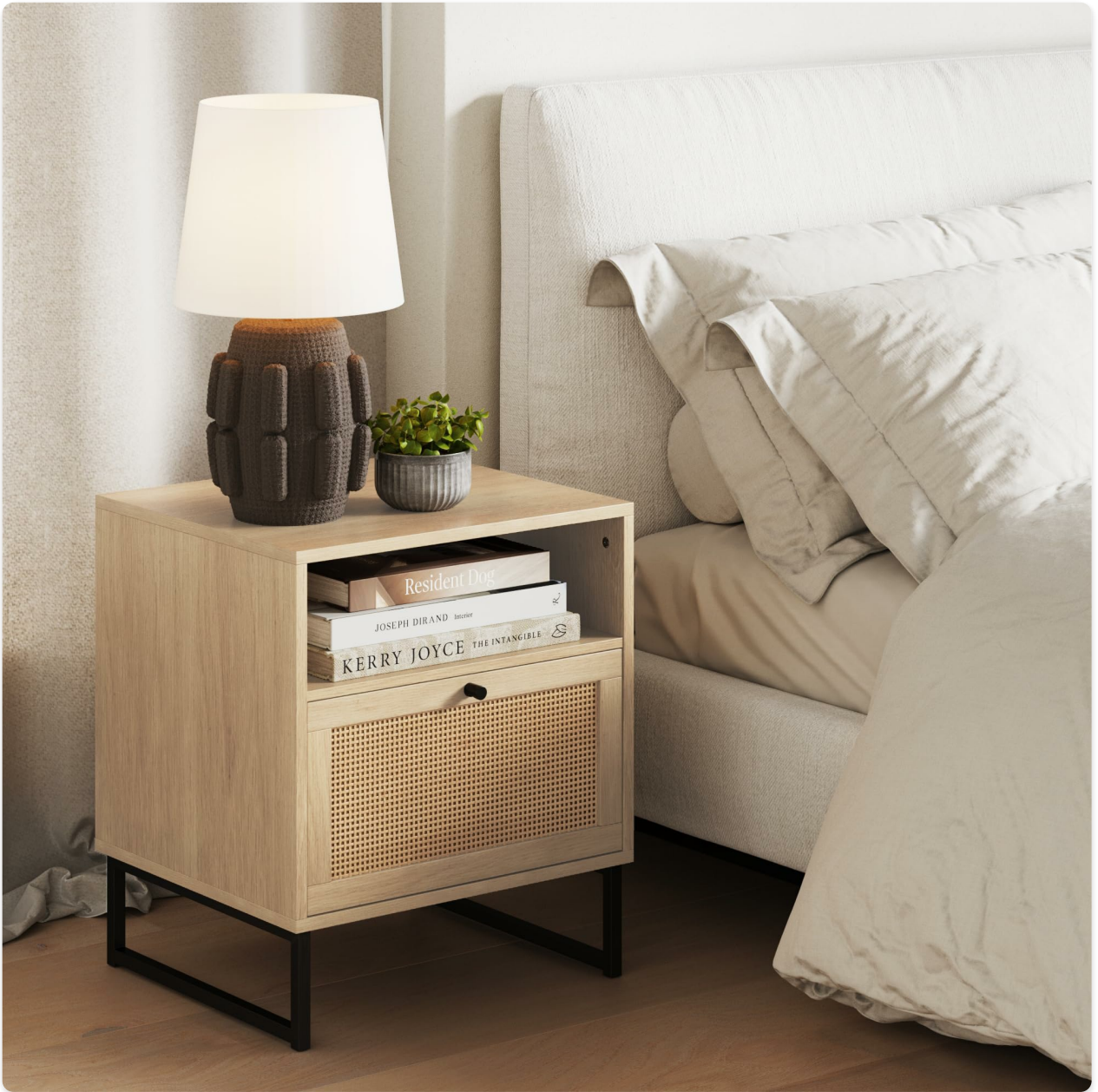
Figure 1: Front view of the Mina Rattan Wood End Side Accent Table Nightstand.