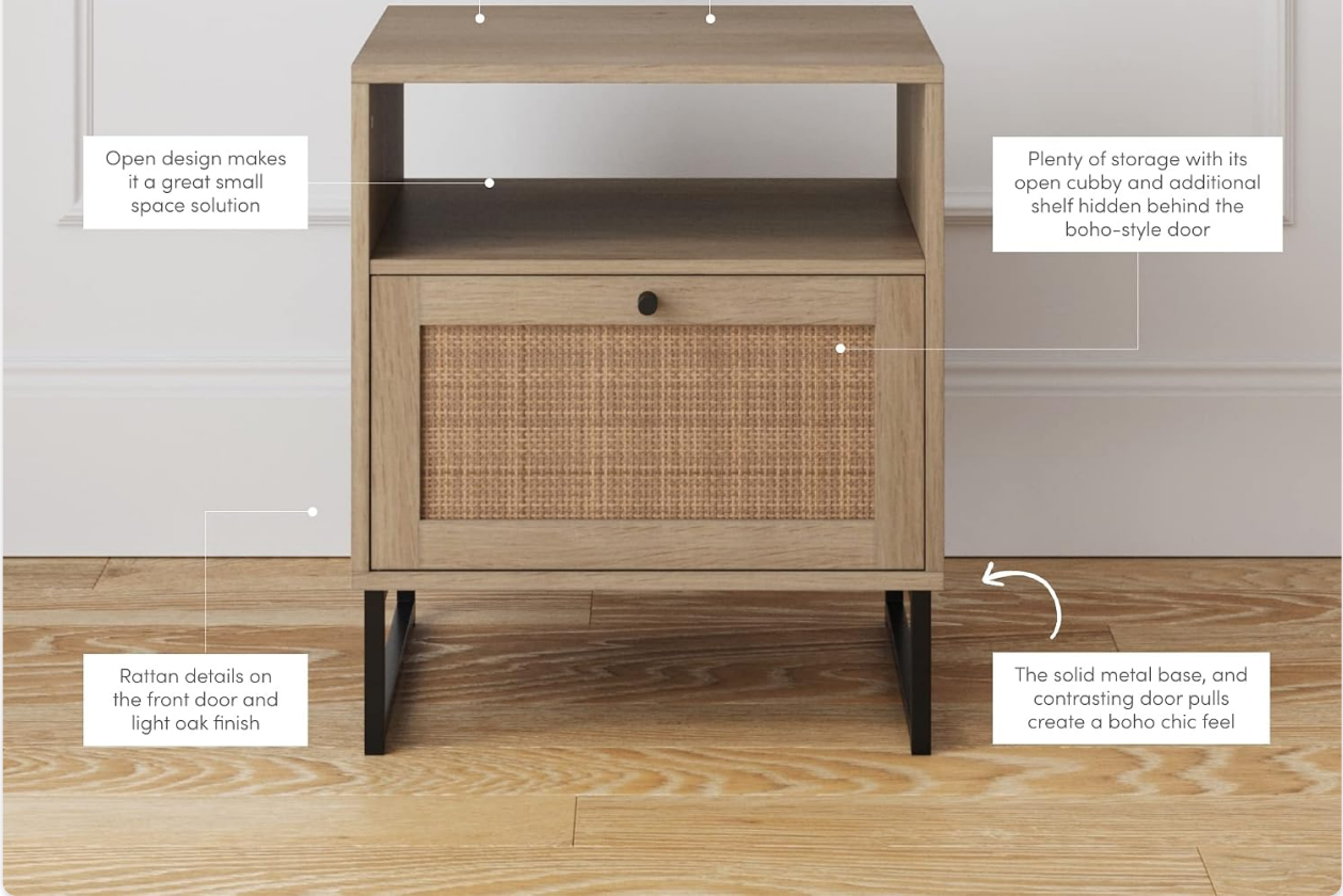
Figure 4: The table's open cubby and rattan-front door for storage.

The solid metal base, and contrasting door pulls create a boho chic feel