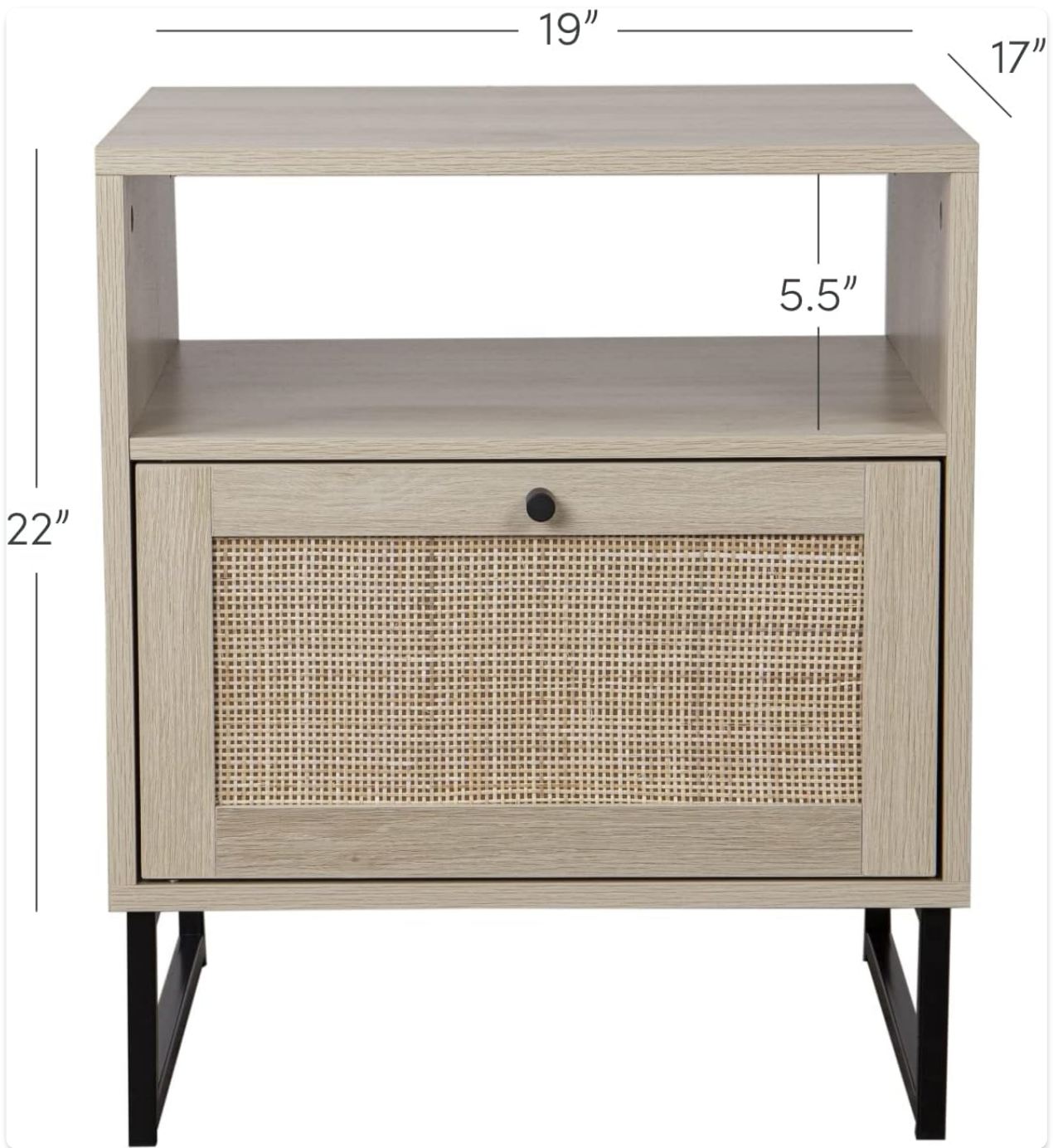
Figure 2: Product dimensions for assembly planning.