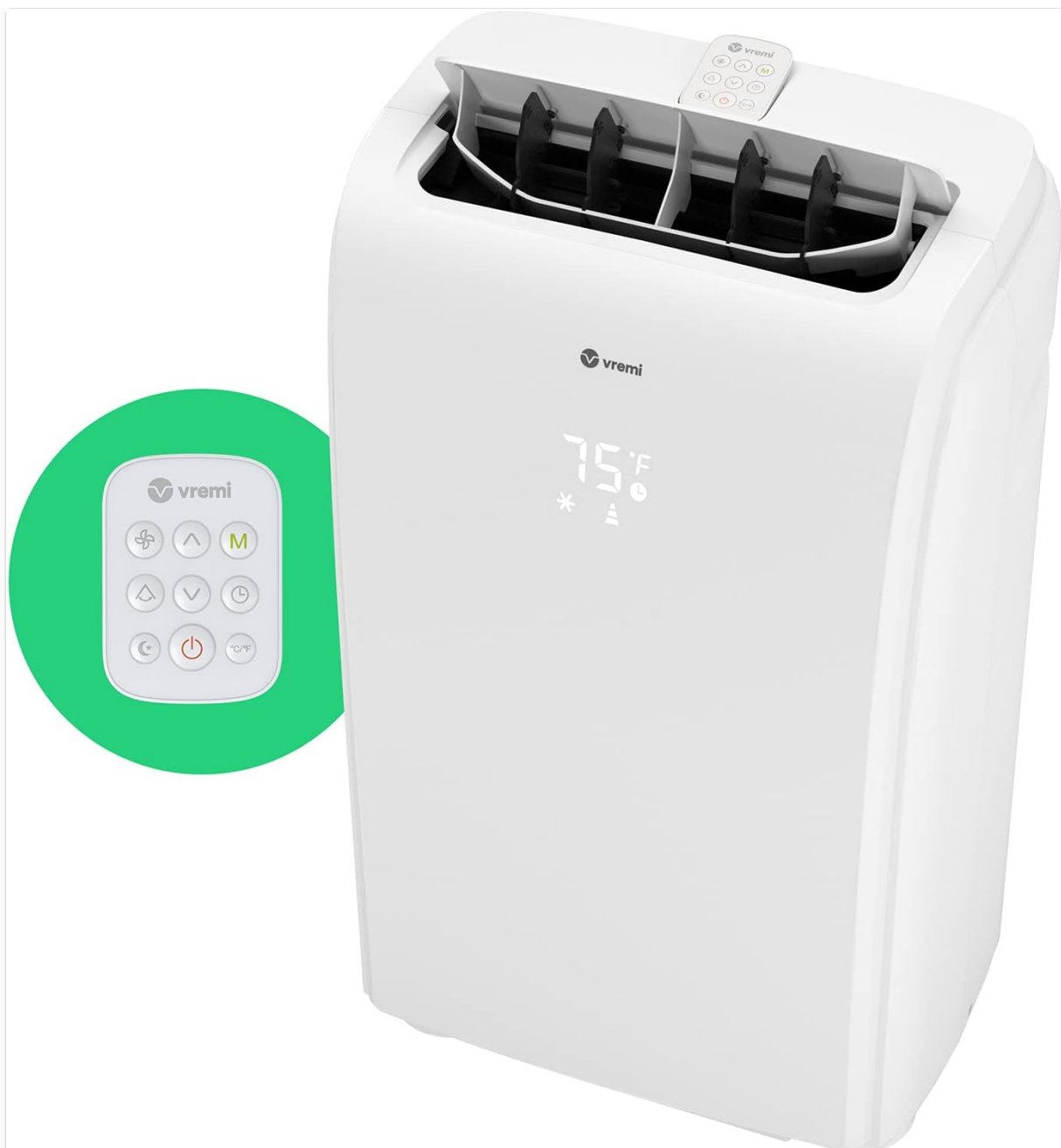
Figure 1: Vremi Portable Air Conditioner and Remote Control