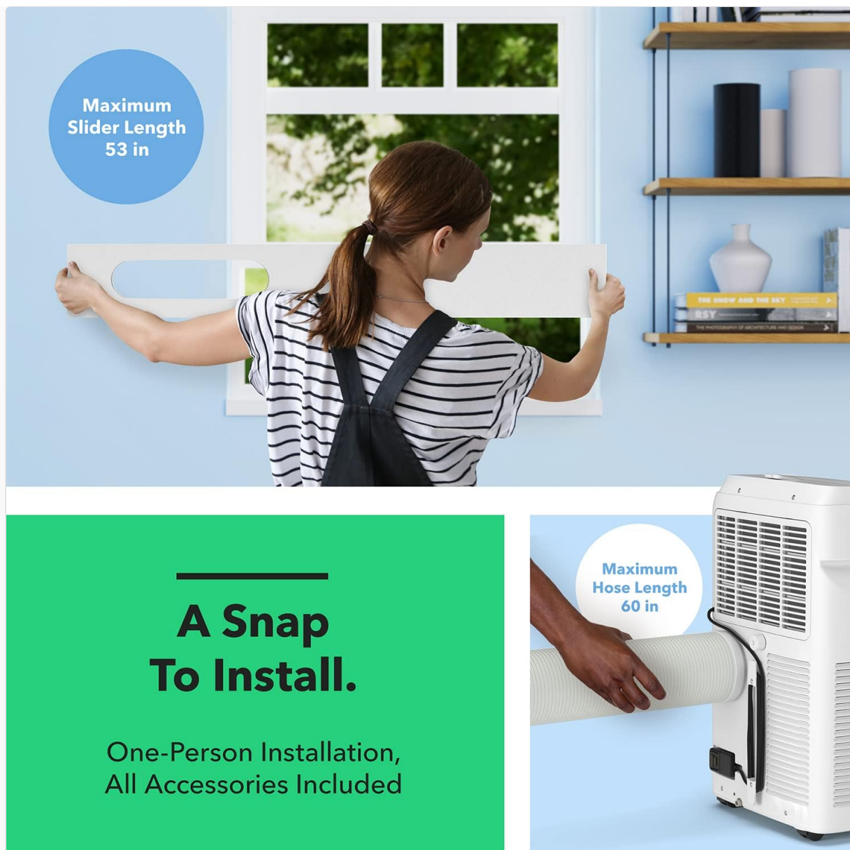
Figure 3: Window Kit Installation