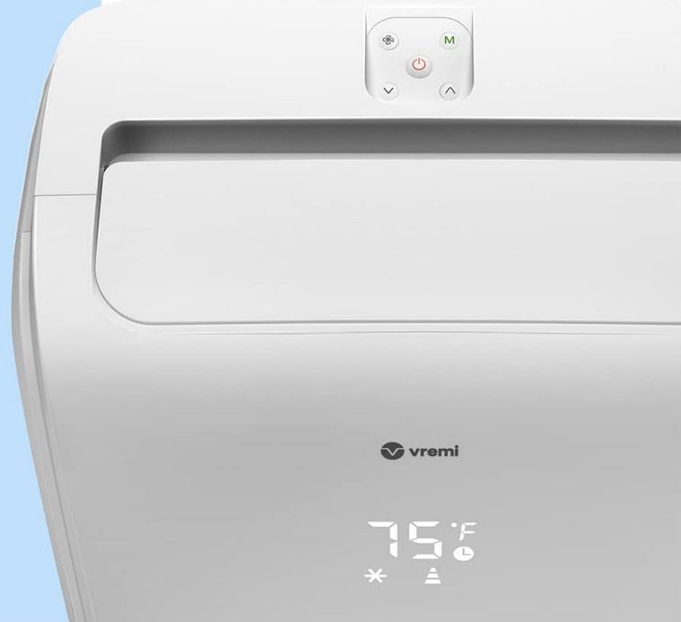
Figure 4: Available Operating Modes