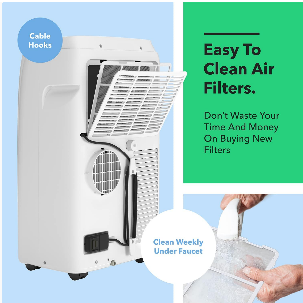
Figure 7: Cleaning the Reusable Air Filter