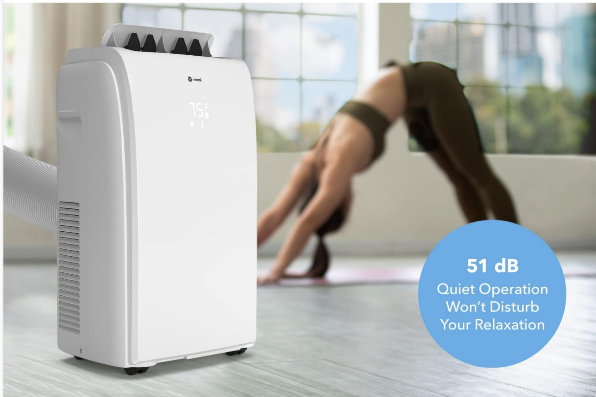
Figure 5: Timer and Quiet Operation Features

Automatic 1–24 Hour Timer Let's You Stay Cool And In Control