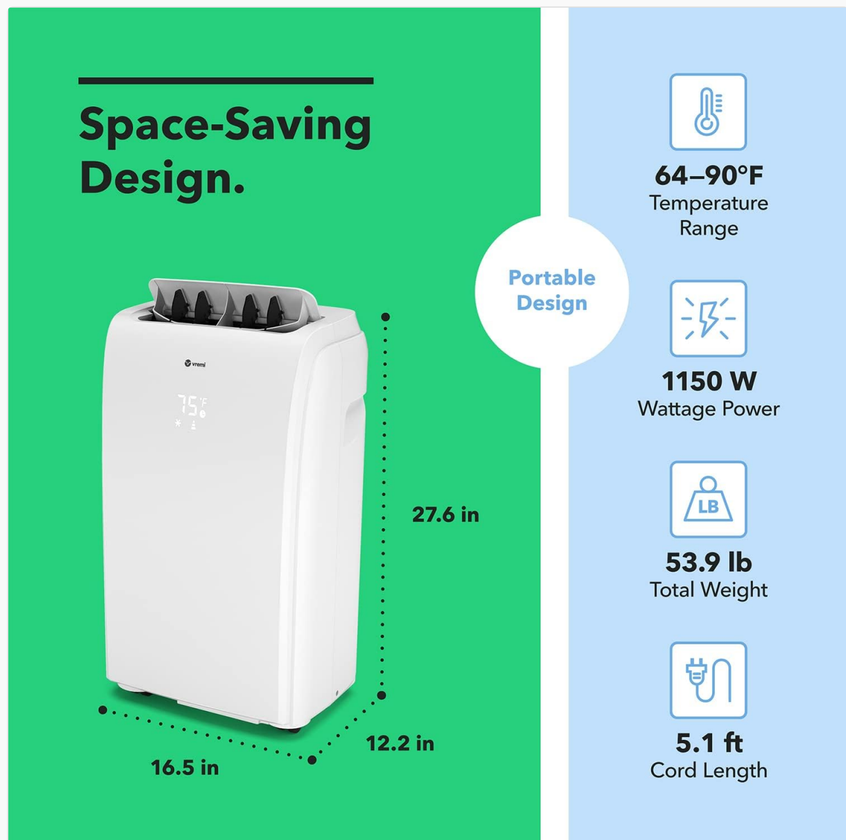
Figure 8: Product Dimensions and Key Specifications