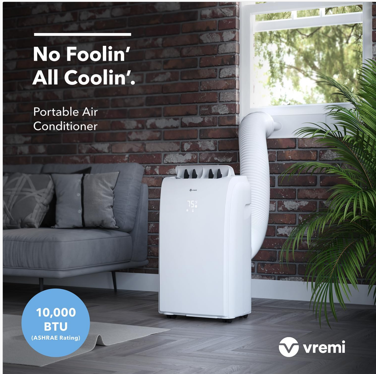
Figure 2: Unit Placement and Exhaust Hose Connection