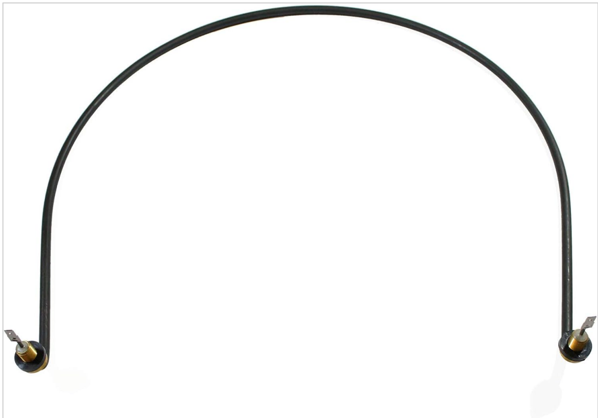
Image 3.1: Front view of the W10518394 heating element, showing the curved shape and terminal connections.