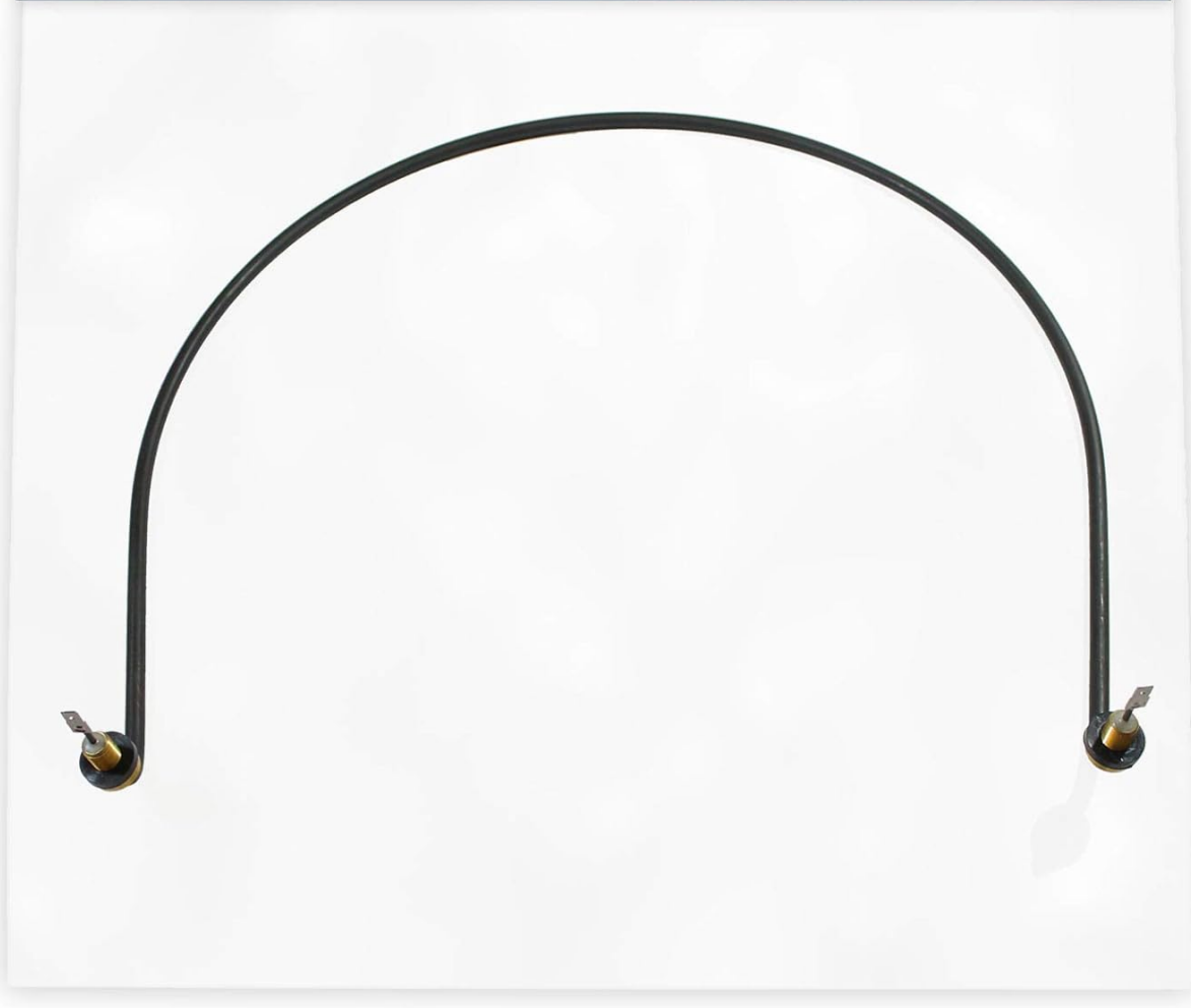
Image 1.1: The UpStart Components W10518394 Dishwasher Heating Element as packaged.