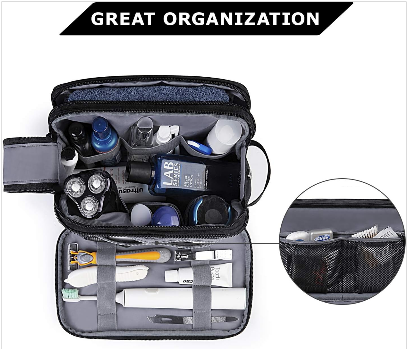
Image: Interior view of the BAGSMART Toiletry Bag demonstrating organized storage with bottles, razors, and other personal care items.