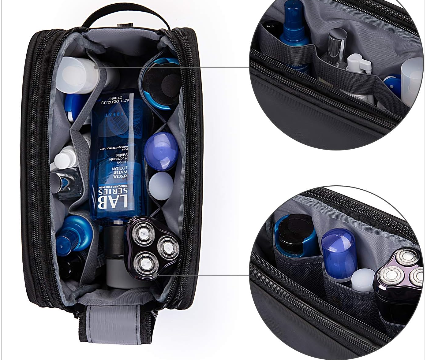
Image: Close-up of the main compartment with elastic loops securing various bottles in an upright position.