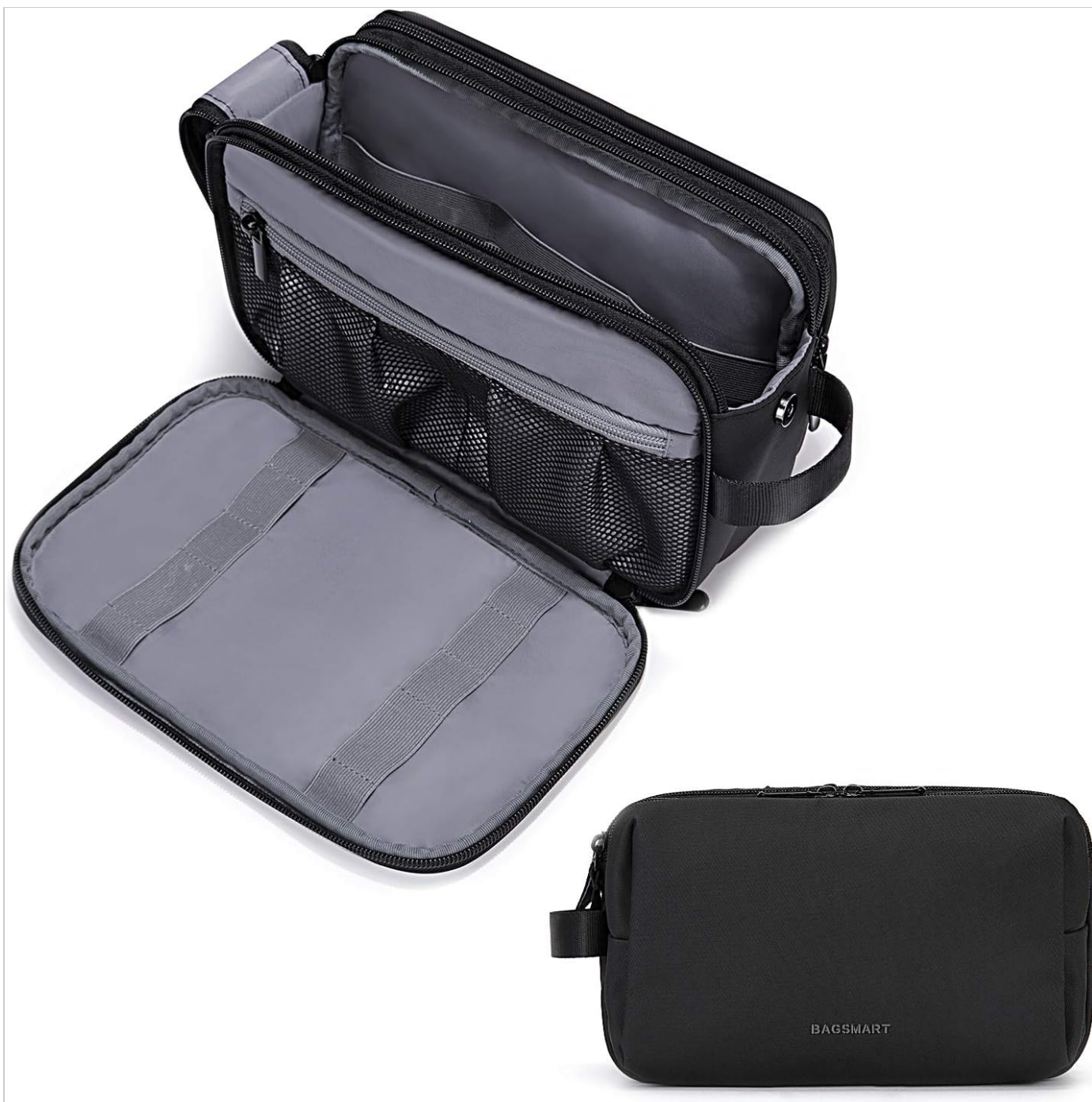
Image: The BAGSMART Toiletry Bag, illustrating its compact exterior and organized interior when opened.