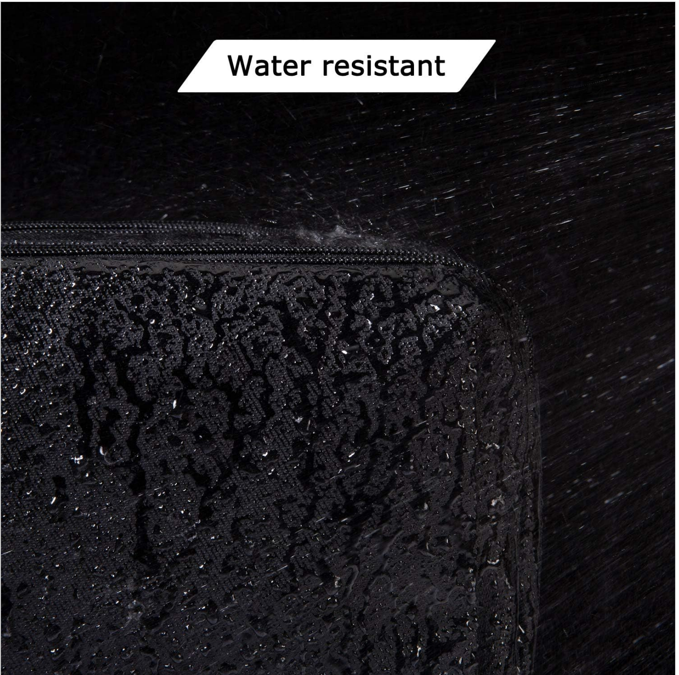
Image: Demonstrates the water-resistant property of the bag's material, showing water droplets on the surface.