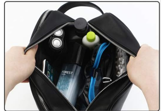
Can't stay open

Image: Illustration of the dual zipper design allowing the bag to open completely for easy access to contents.