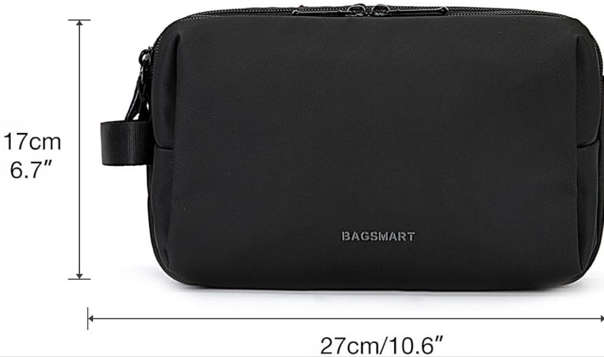
Image: Visual representation of the medium and large BAGSMART Toiletry Bag sizes with their respective dimensions.