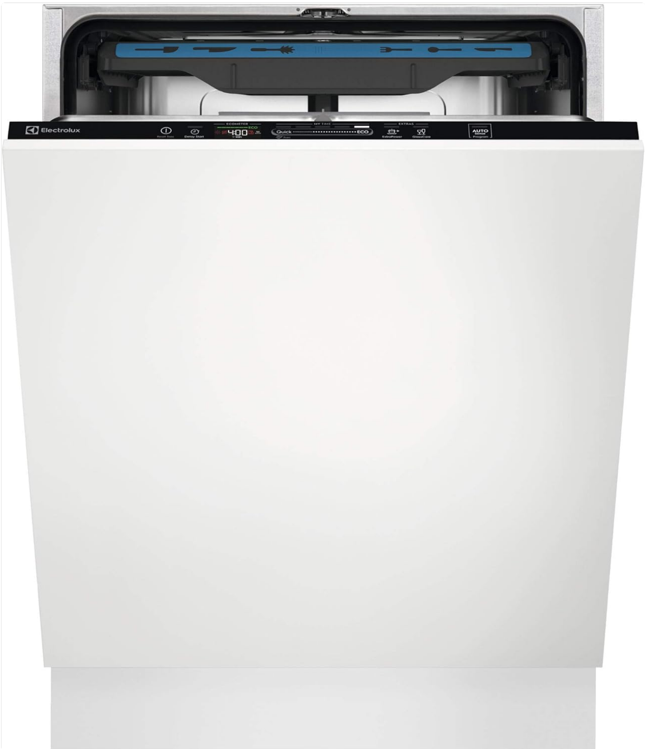
Figure 1: Front view of the Electrolux EEM48330L fully integrated dishwasher, showing the control panel at the top edge of the door.