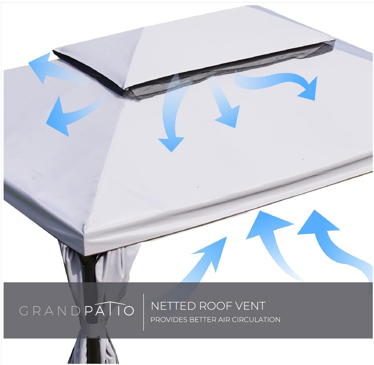
Figure 5.3: Netted roof vent for improved air circulation.