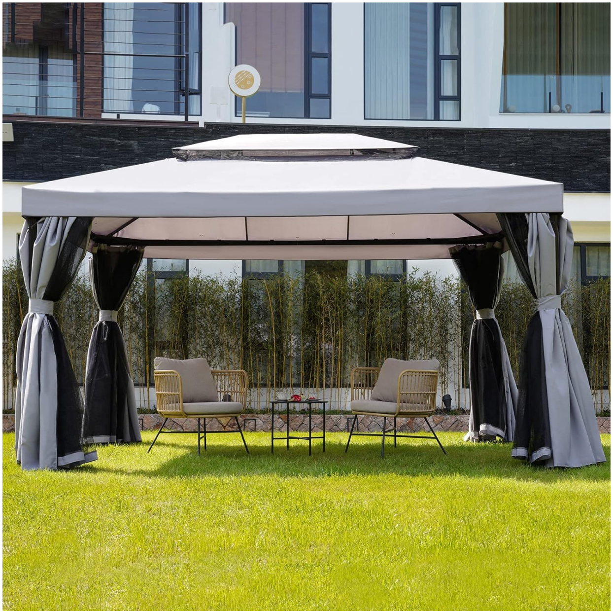
Figure 5.2: Gazebo with mosquito netting and curtains tied back, offering an open-air experience.