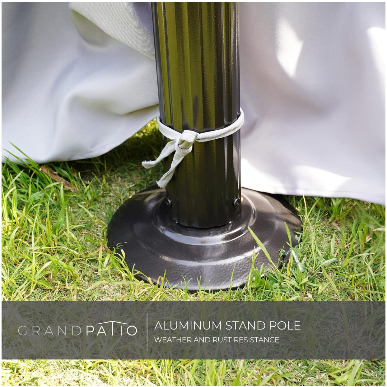
Figure 4.2: Detail of the aluminum stand pole base, designed for weather and rust resistance.