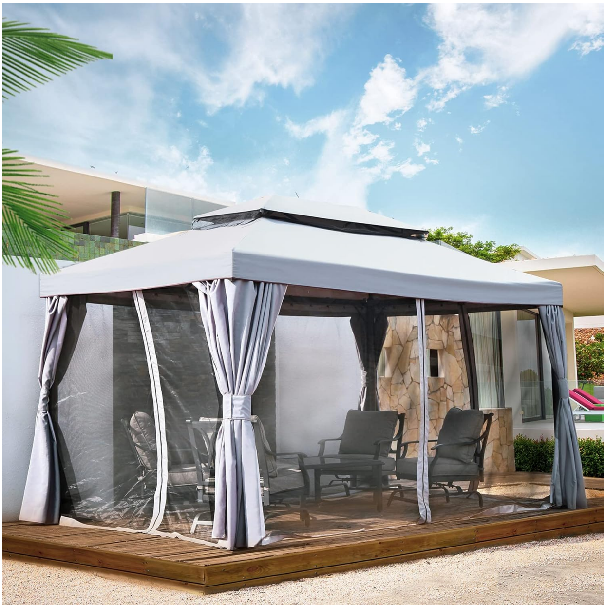
Figure 5.1: Gazebo with mosquito netting and curtains deployed for privacy and insect protection.