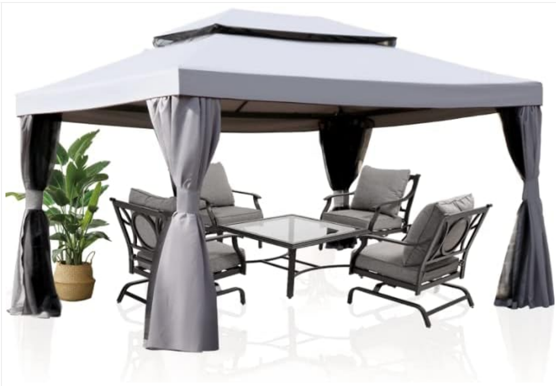
Figure 4.1: Assembled Grand Patio 10x13 Ft Outdoor Gazebo.