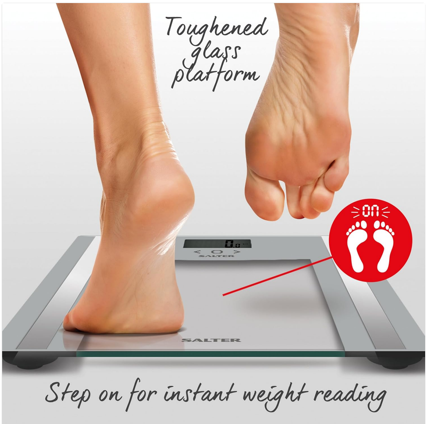
Image: Step onto the scale with bare feet for an instant weight reading.