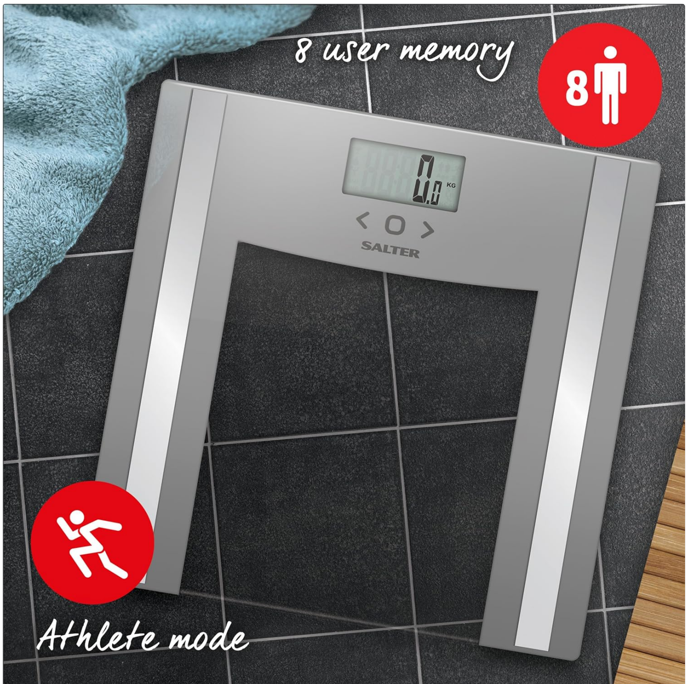
Image: The scale supports 8 user memory and includes an Athlete Mode for tailored measurements.