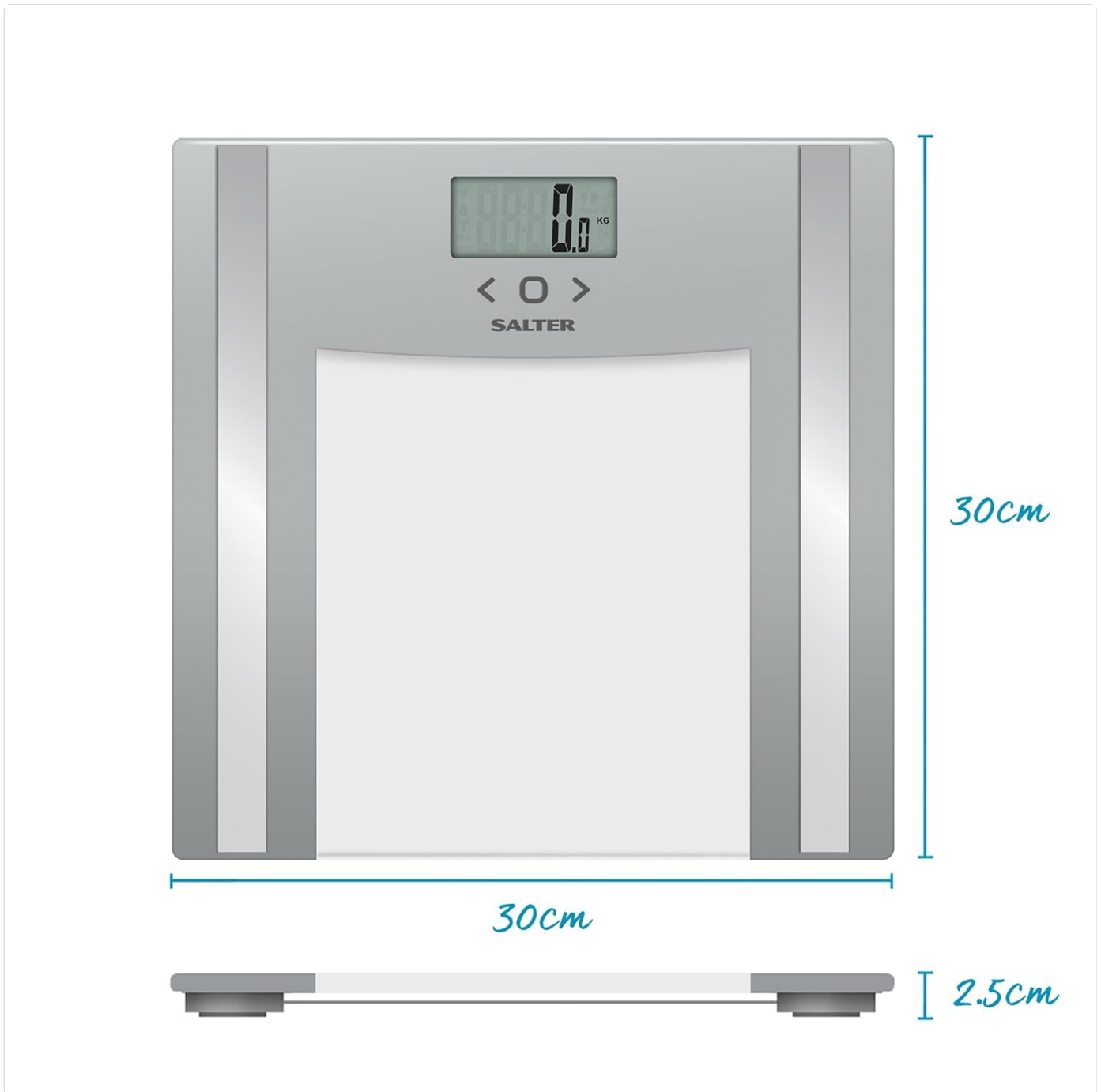
Image: Dimensions of the Salter 9182 SV3R Glass Analyser Bathroom Scale.