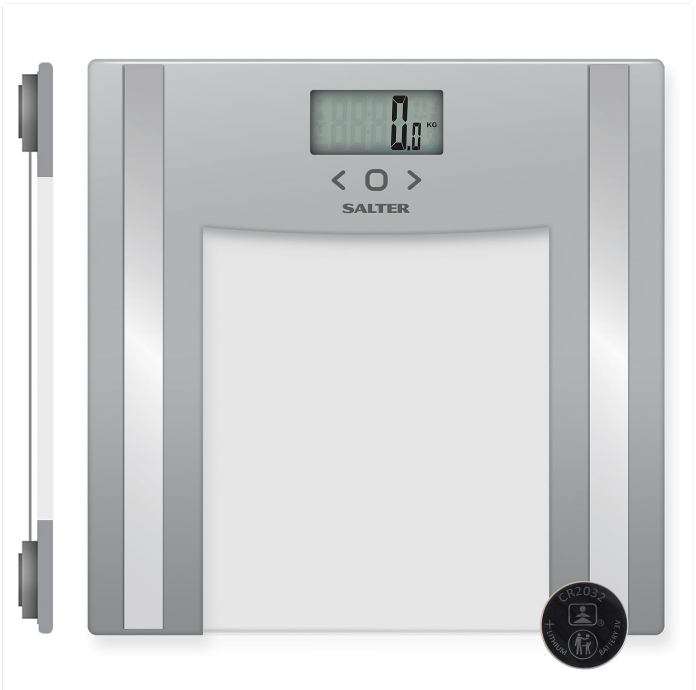
Image: The Salter 9182 SV3R scale, showing its sleek design and the included CR2032 battery.