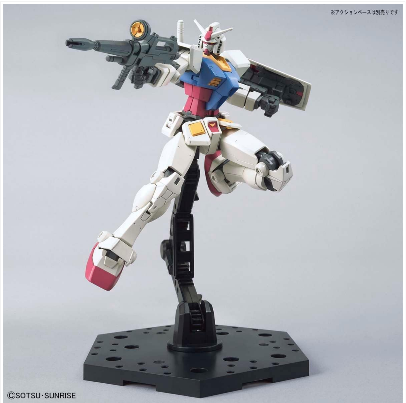
Image: The RX-78-2 Gundam mounted on an action base (sold separately), posed as if flying and firing its beam rifle, showcasing dynamic display options.