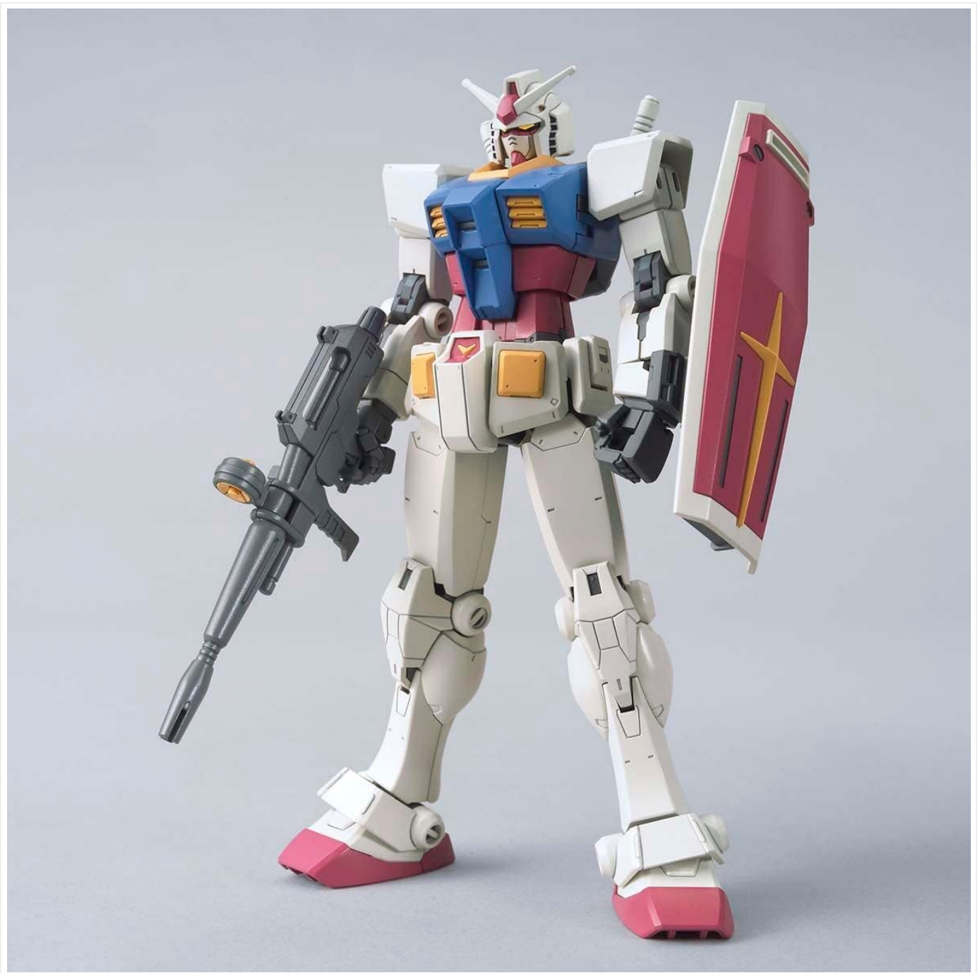
Image: The fully assembled RX-78-2 Gundam model kit, equipped with its beam rifle and shield, standing in a neutral pose.