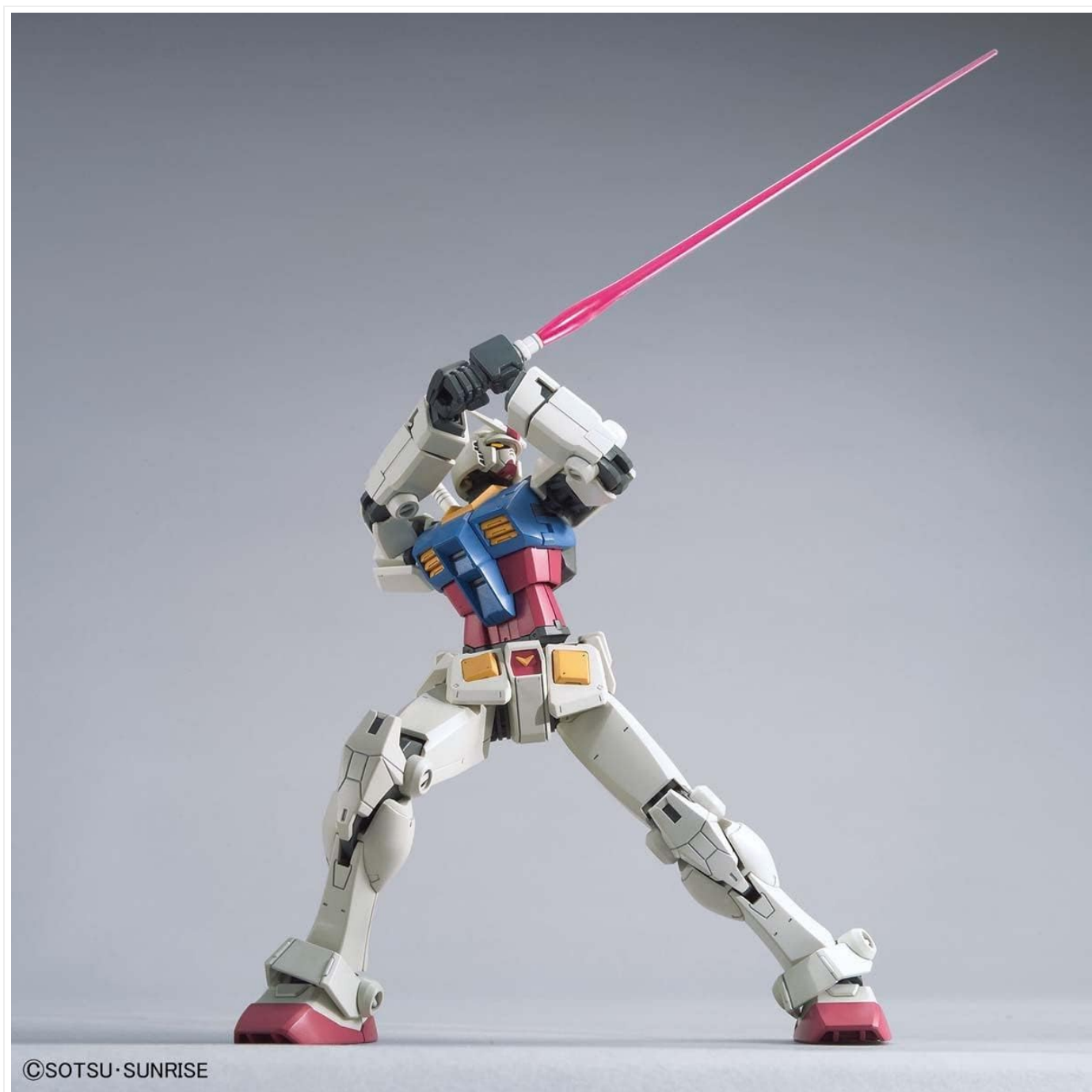
Image: The RX-78-2 Gundam in a dynamic kneeling pose, wielding a beam saber, showcasing its flexible articulation.