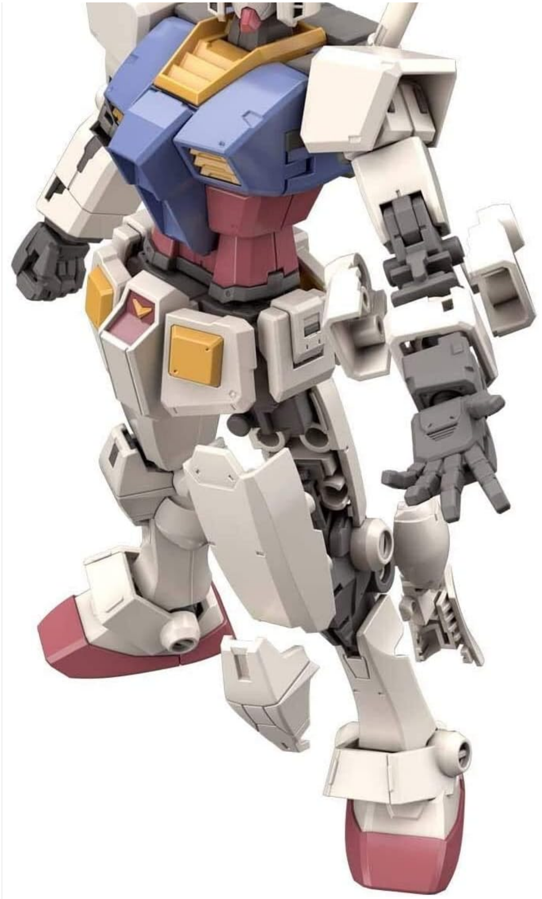
Image: A partially assembled RX-78-2 Gundam, illustrating the internal frame and how external armor pieces attach, highlighting the articulation points.