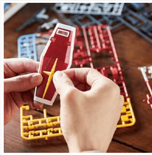
Image: Various plastic runners with parts for the model kit, showing different colors of plastic.