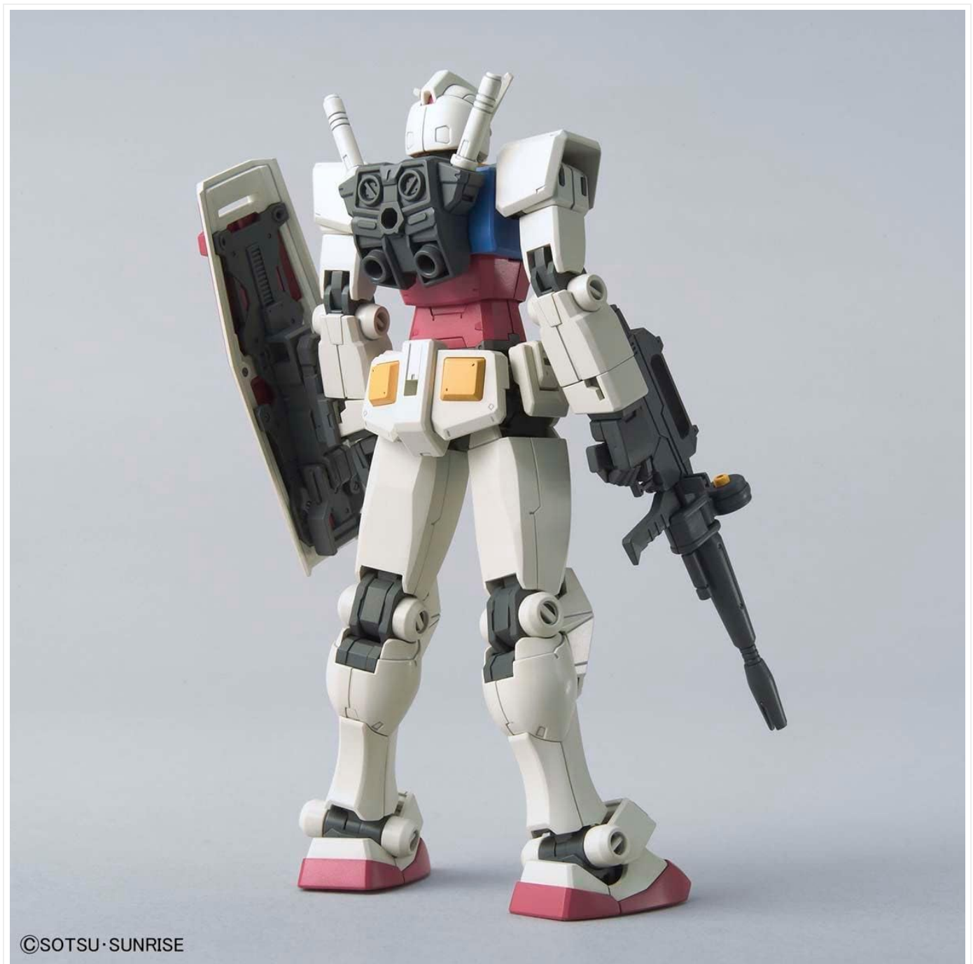
Image: Rear view of the RX-78-2 Gundam model kit, showing the backpack, beam rifle, and shield from behind.