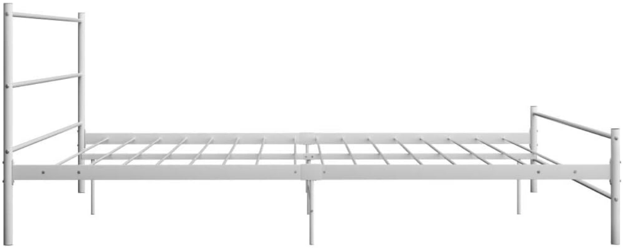
Image 3.3: Side view of the bed frame, highlighting the structure of the metal slatted base.