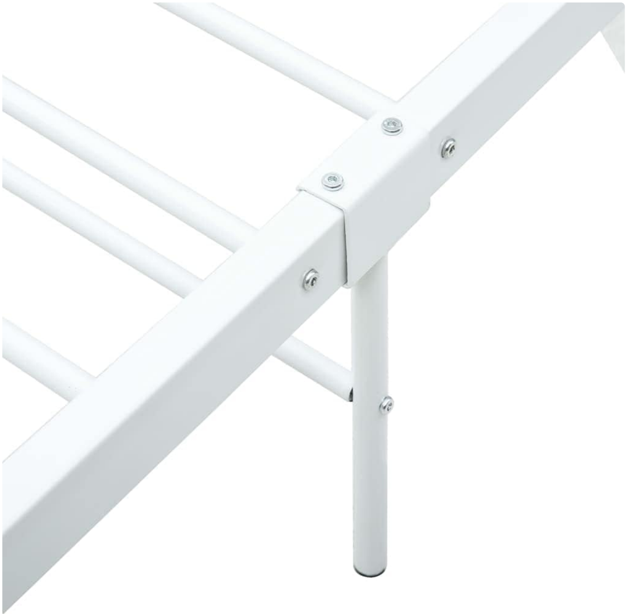
Image 3.2: Detail of a leg attachment point, illustrating how support legs are secured.