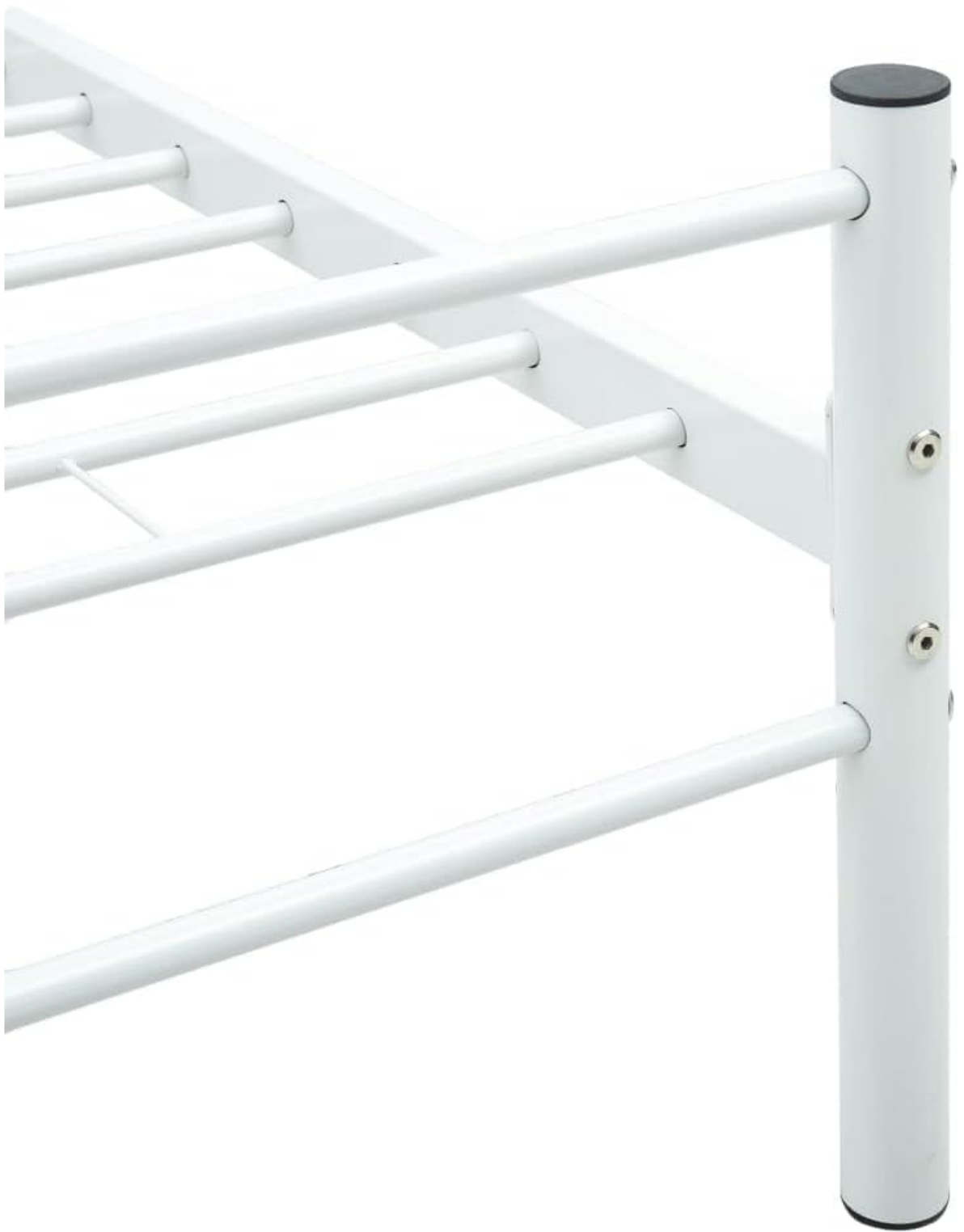
Image 3.1: Detail of a corner joint, showing how frame components connect.