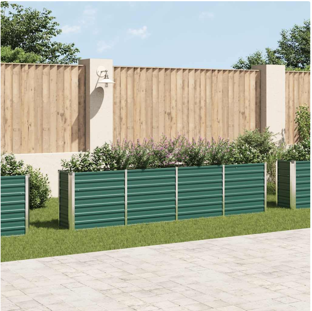
Image 5.1: Multiple vidaXL raised garden beds positioned in a garden, filled with soil and various plants. This illustrates the product in its intended use, enhancing the aesthetic and functionality of an outdoor space.