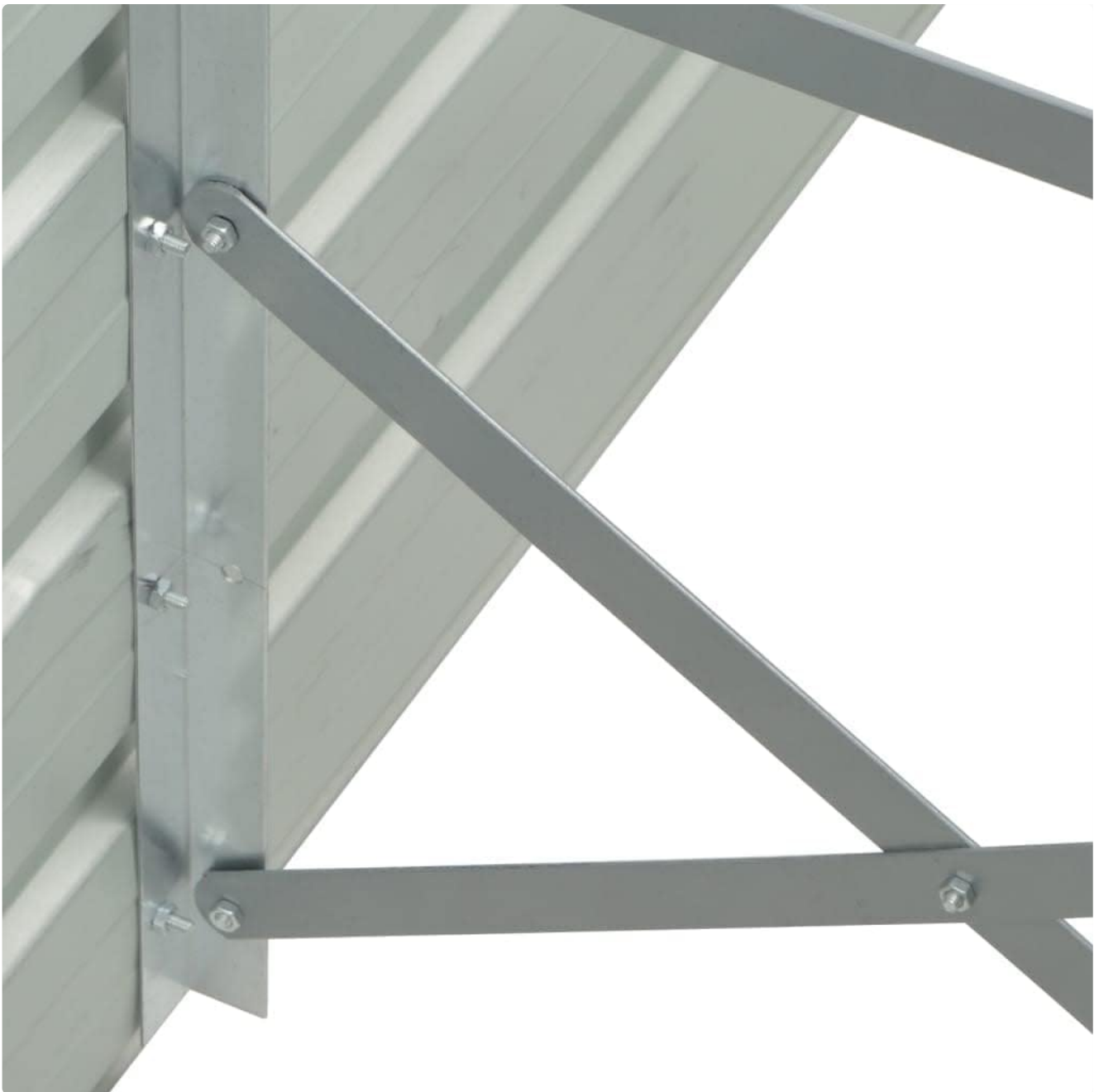
Image 4.2: A close-up view of an internal support bracket within the raised bed structure. These brackets are essential for reinforcing the long sides of the bed, preventing bowing when filled with soil.