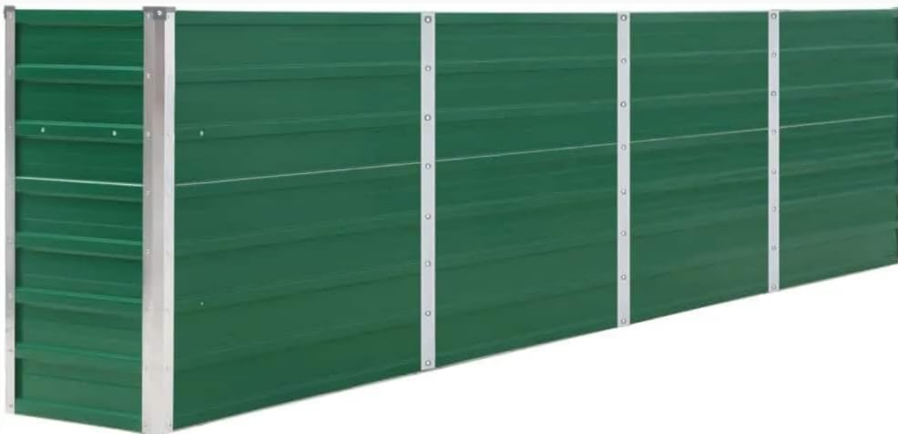
Image 4.1: An assembled vidaXL Galvanised Steel Garden Raised Bed, showcasing its rectangular shape and green finish. This image provides a general view of the final product after successful assembly.