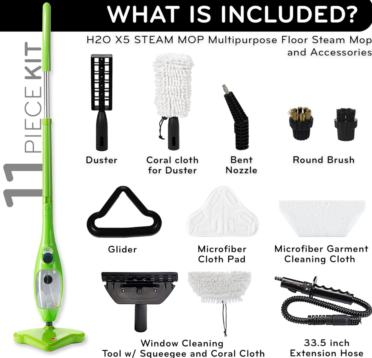
Figure 2.2: All included accessories for the H2O X5 Steam Mop.