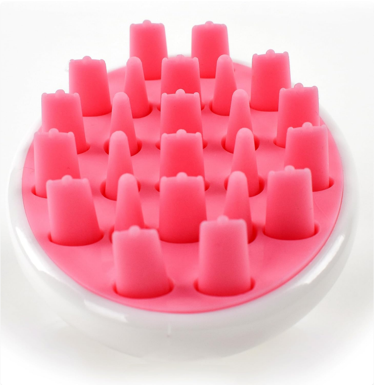
Image: A close-up view of the ZMA-12 scalp massager's pink bristles, showing their varied shapes for effective scalp stimulation.