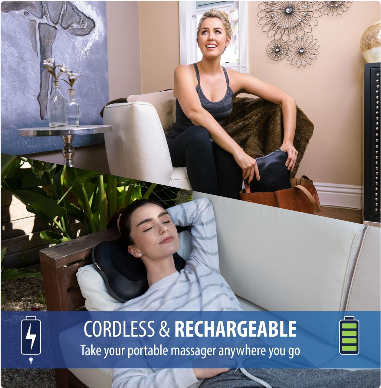
Image: A person using the ZMA-13RB massager in a home setting, illustrating its cordless and rechargeable nature.