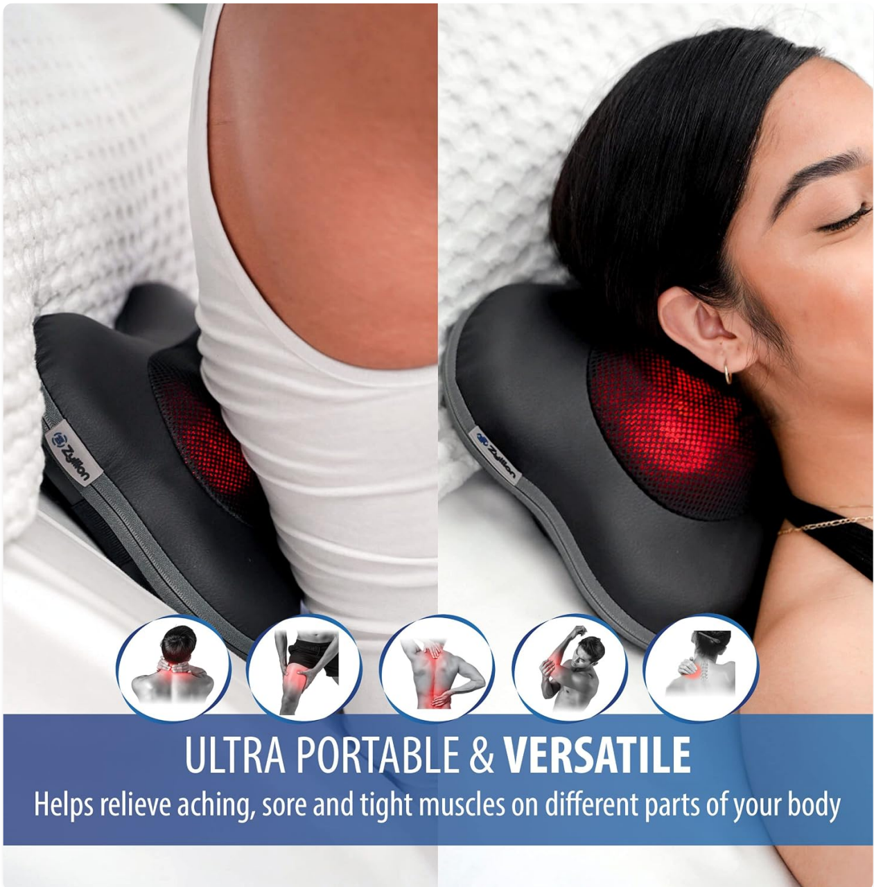
Image: The ZMA-13RB massager being used on various body parts, demonstrating its ultra-portable and versatile application for muscle relief.