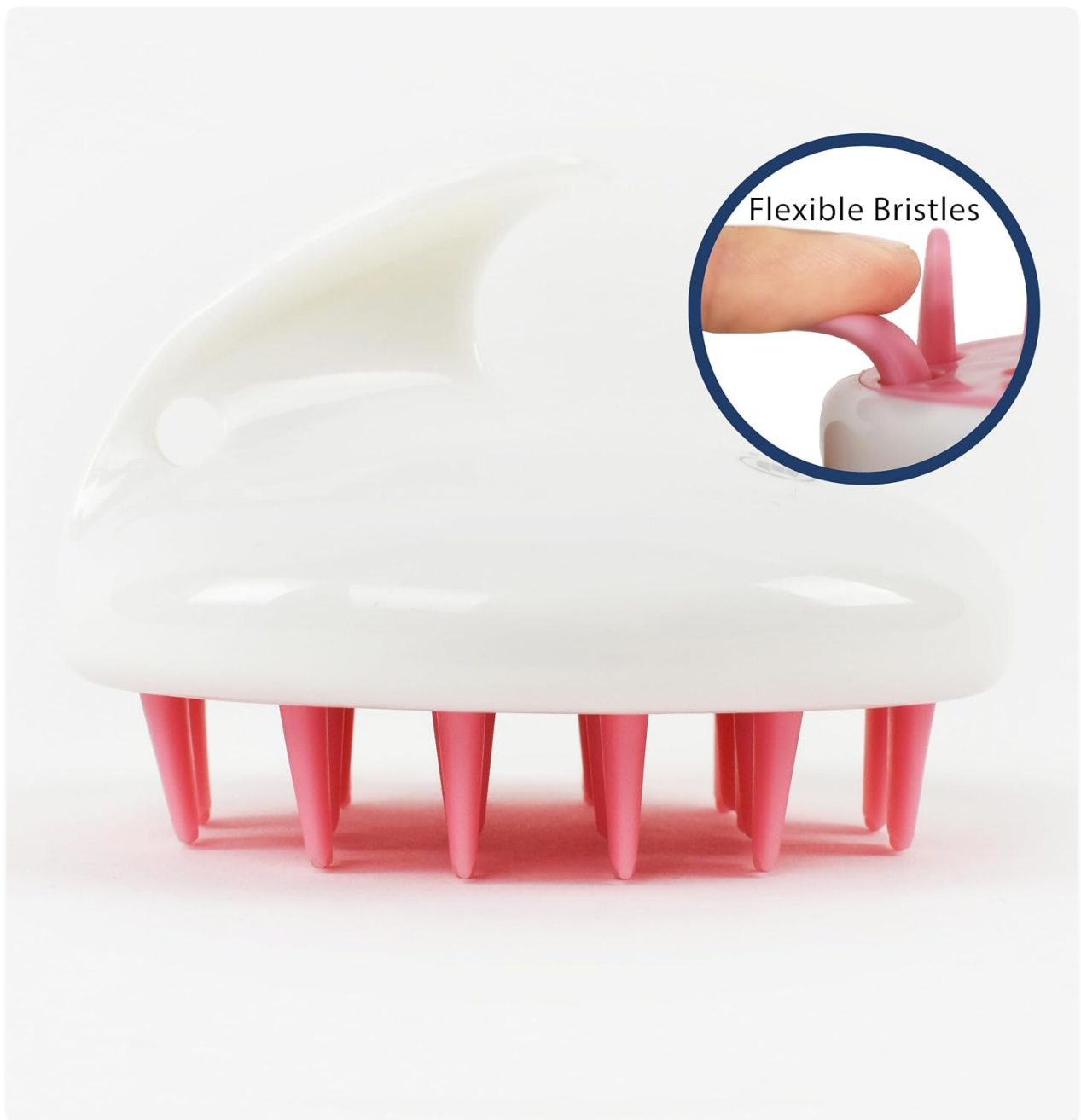
Image: A demonstration of the ZMA-12 scalp massager's flexible bristles, highlighting their ability to adapt to the scalp.