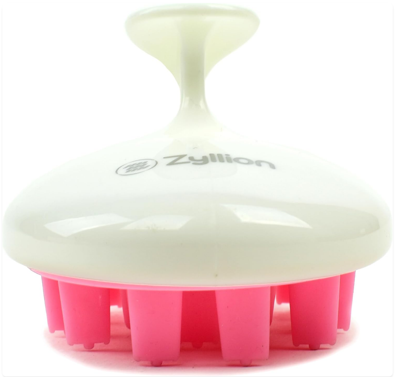
Image: A full view of the ZMA-12 scalp massager, showcasing its ergonomic design and pink bristles.