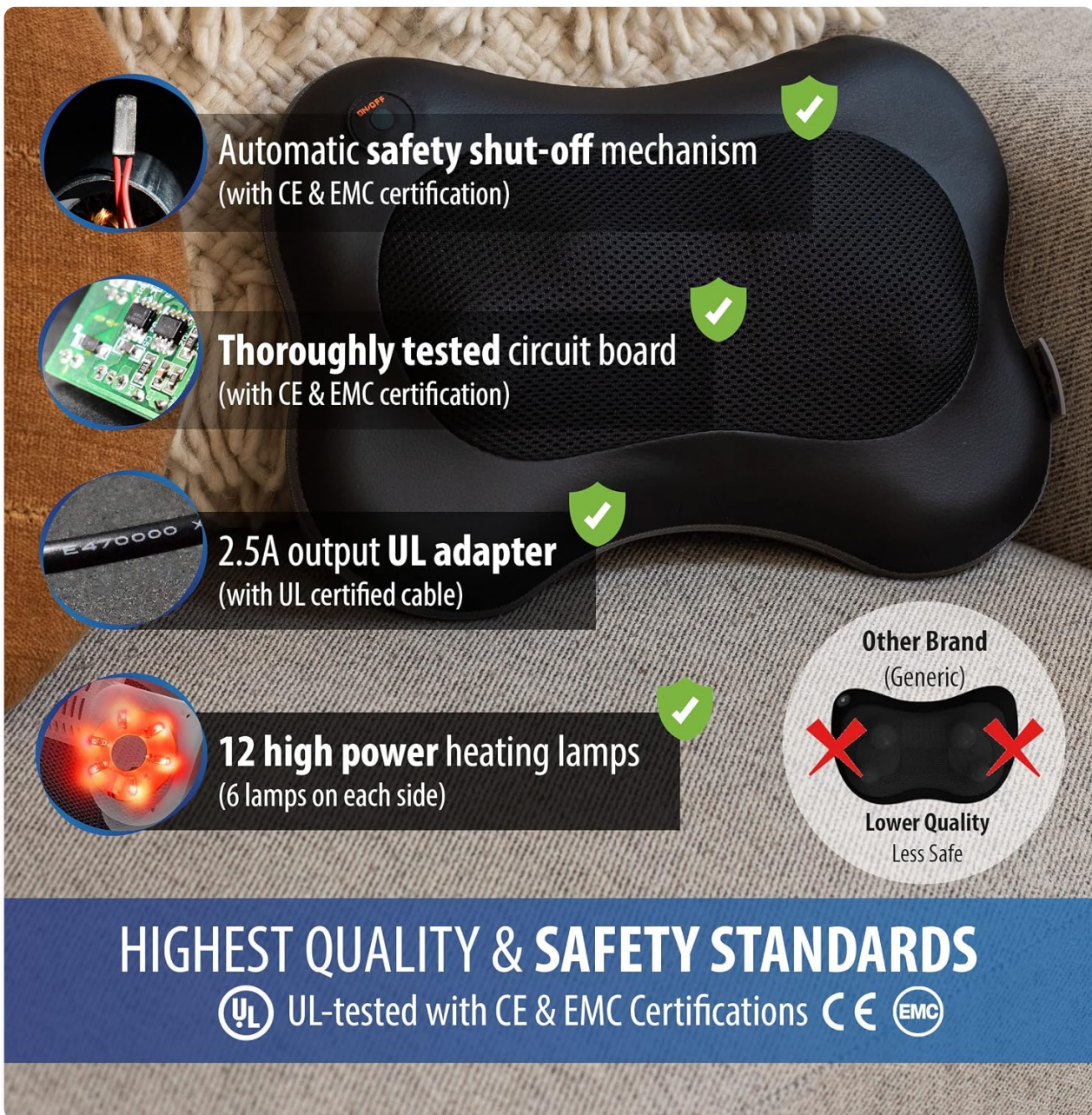
Image: ZMA-13RB massager highlighting safety features including automatic shut-off, tested circuit board, UL adapter, and 12 heating lamps.