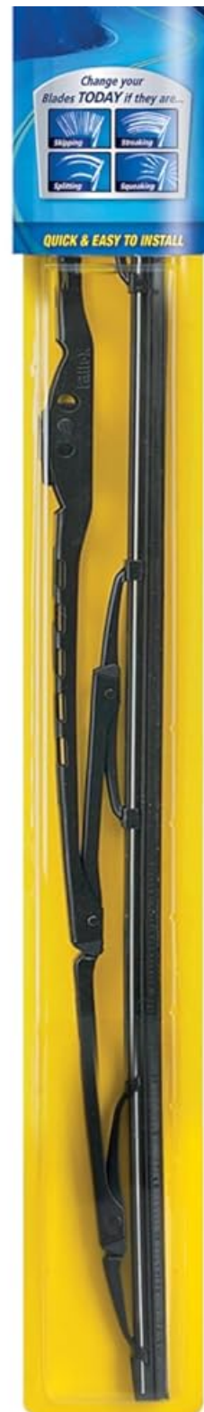
Image: Rain-X WeatherBeater Wiper Blades, 22 inch, in their retail packaging.