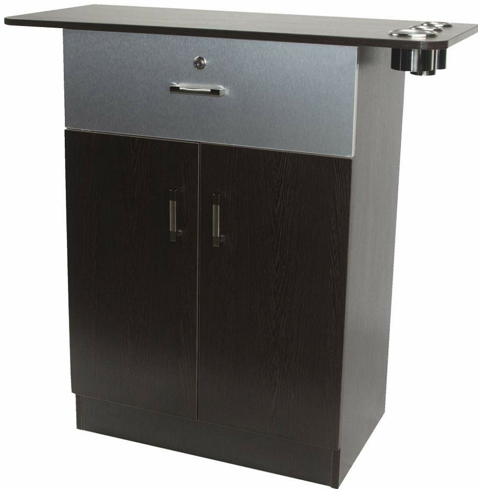
Image 1.1: Front view of the Berkeley CHLOE Styling Station. This image displays the overall design of the styling station, featuring a brown cabinet with a silver top, a lockable drawer, and integrated appliance holders on the right side of the countertop.