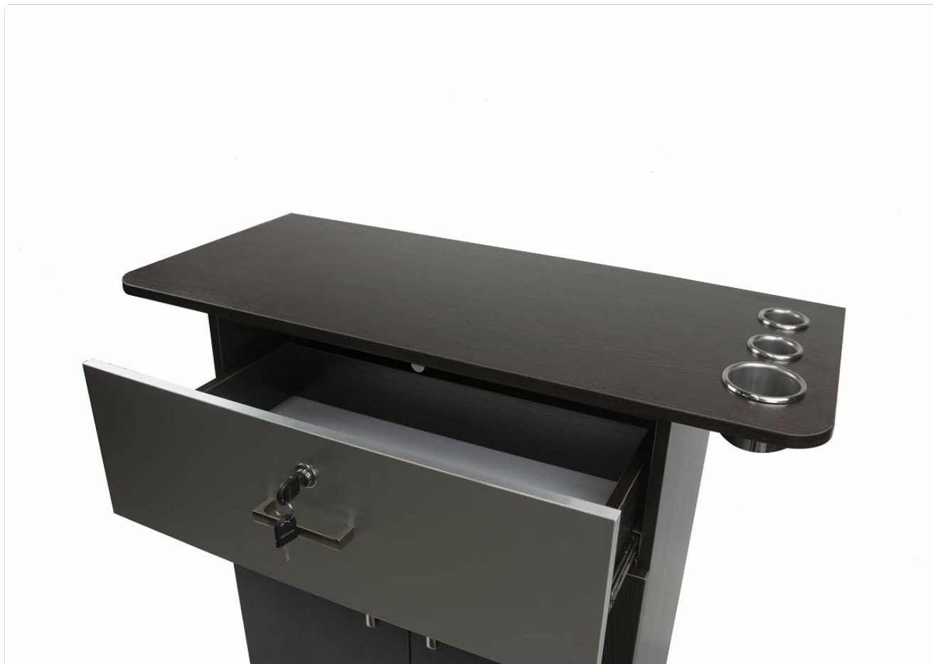
Image 5.1: The lockable drawer of the styling station shown in an open position with the key inserted. This illustrates the drawer's capacity and the locking mechanism.