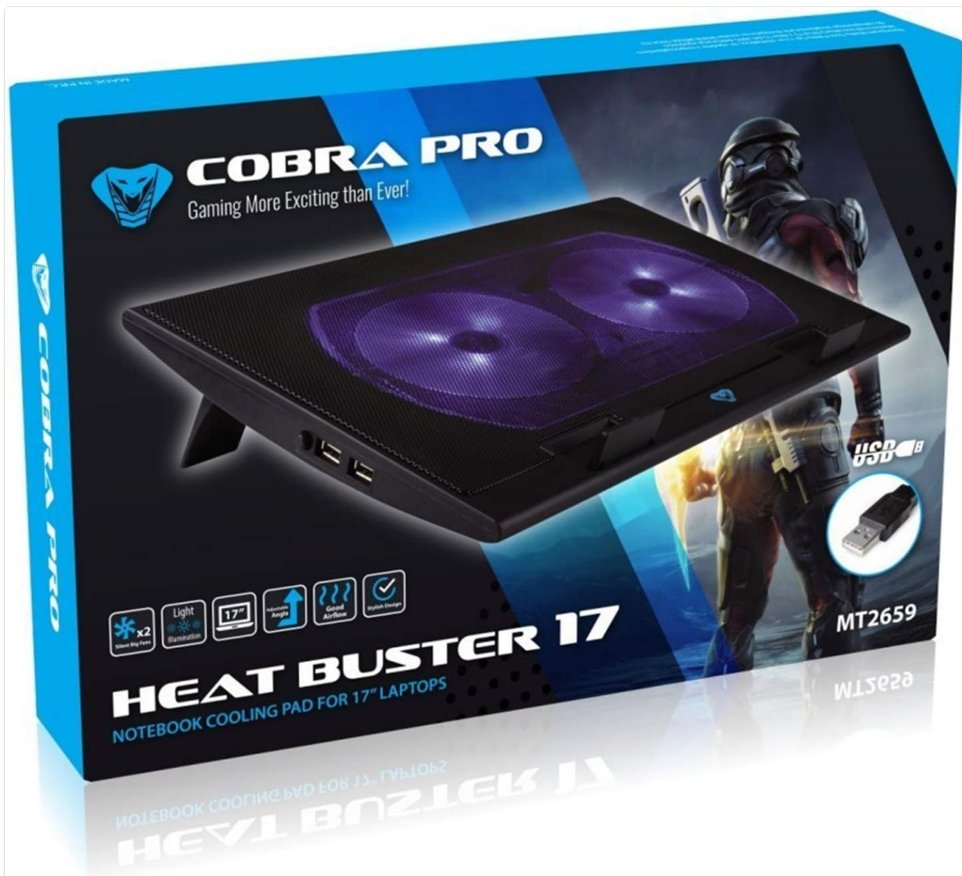
Figure 4: Detailed view of the two USB ports and the power control button located on the side of the cooling pad.