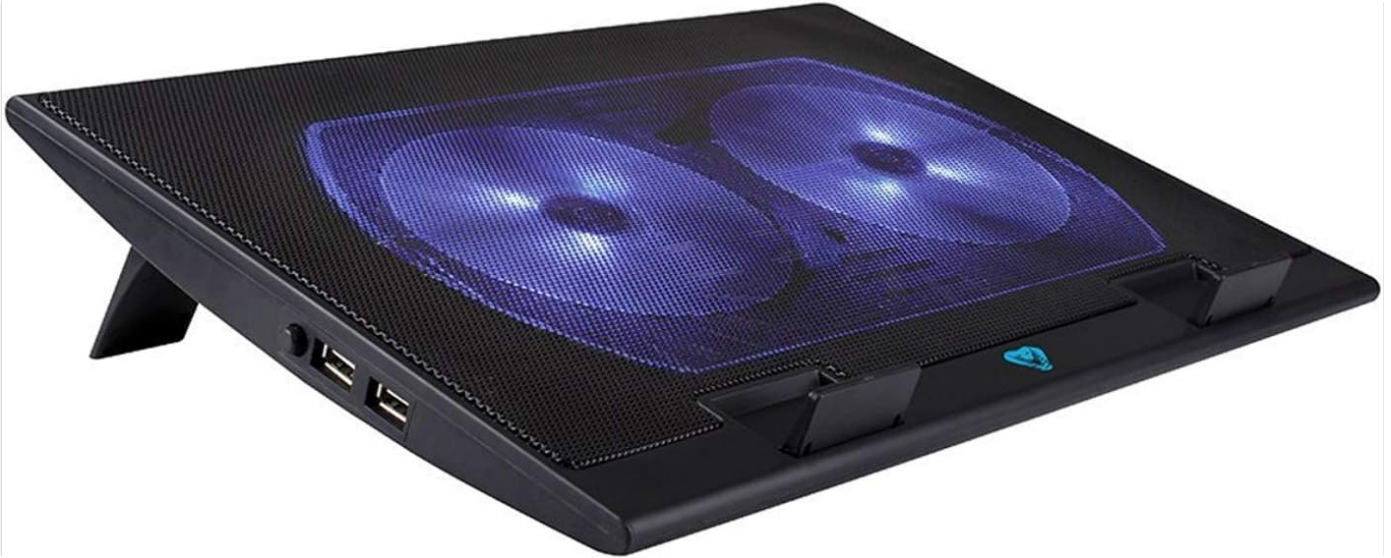
Figure 1: Top view of the Media-Tech Heat Buster 17 cooling pad with its two illuminated fans.