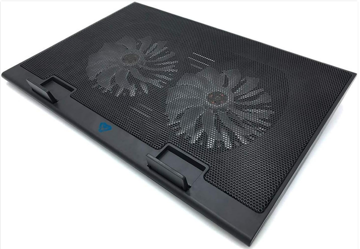
Figure 2: Top-down view of the cooling pad, highlighting the protective mesh over the fans.