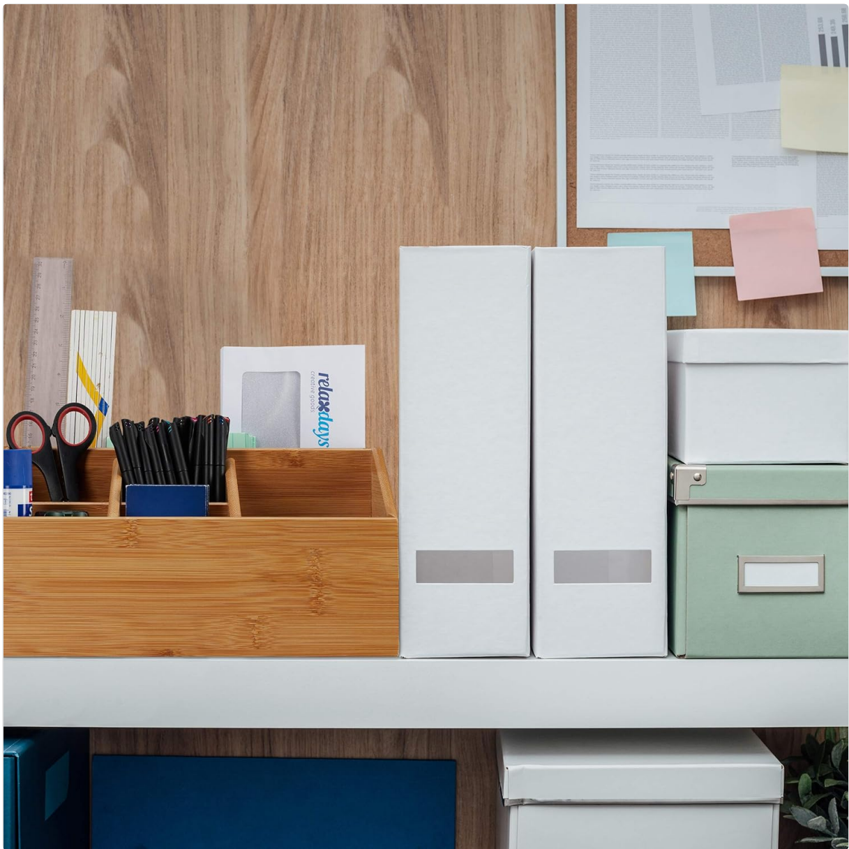
Image 3.2: The organizer placed on a white shelf alongside other office storage boxes, illustrating its versatility for various storage setups.