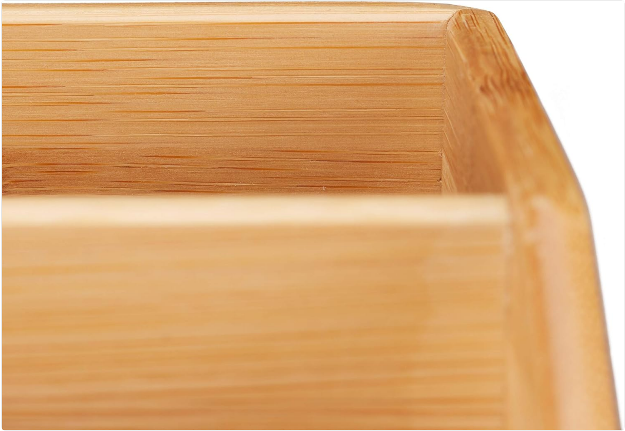
Image 5.1: A close-up view of the smooth, rounded corner of the bamboo organizer, highlighting the quality of craftsmanship and natural wood grain.