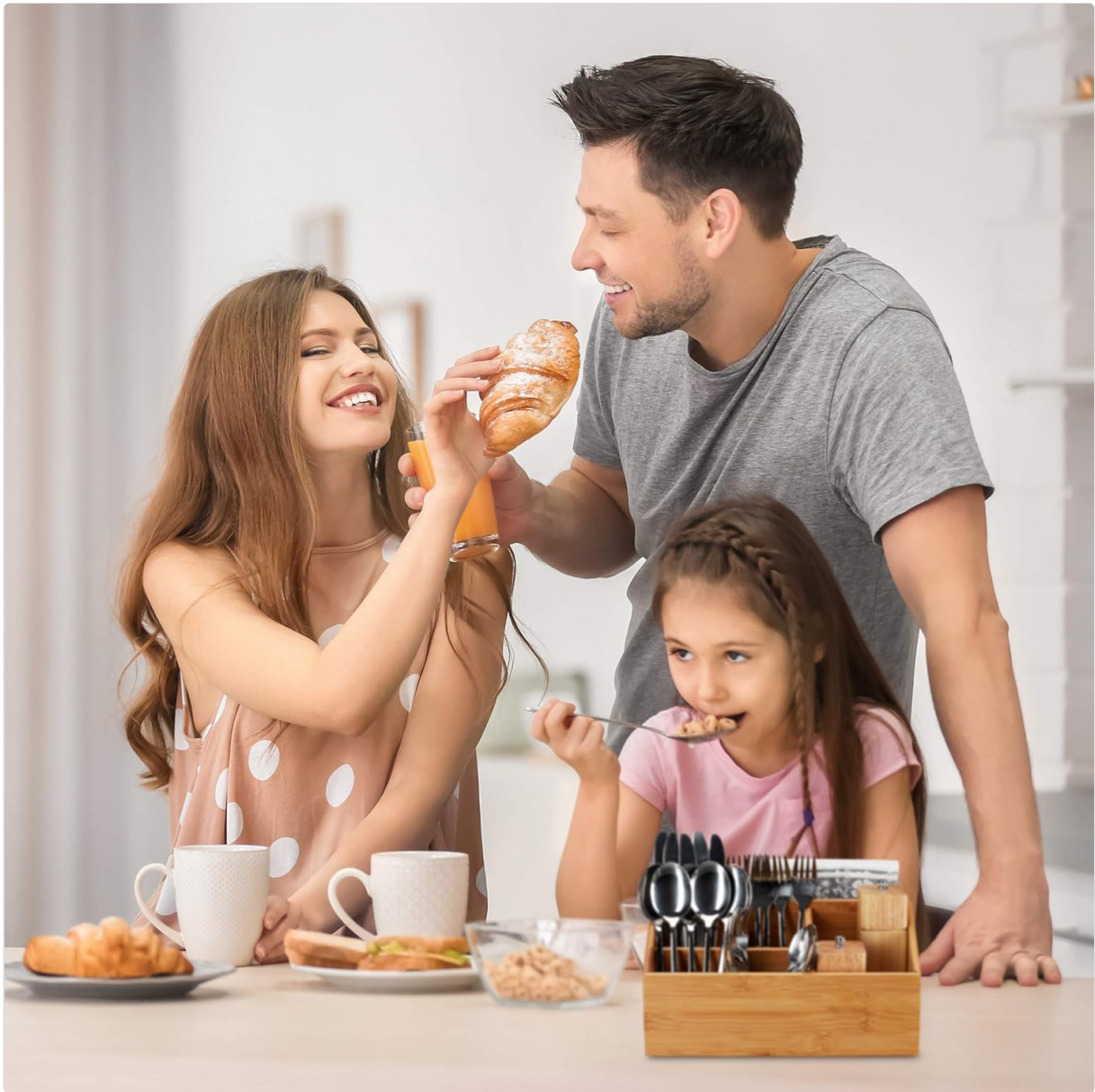
Image 4.1: The bamboo organizer repurposed as a cutlery holder on a kitchen table during a family breakfast, demonstrating its adaptability beyond office use.