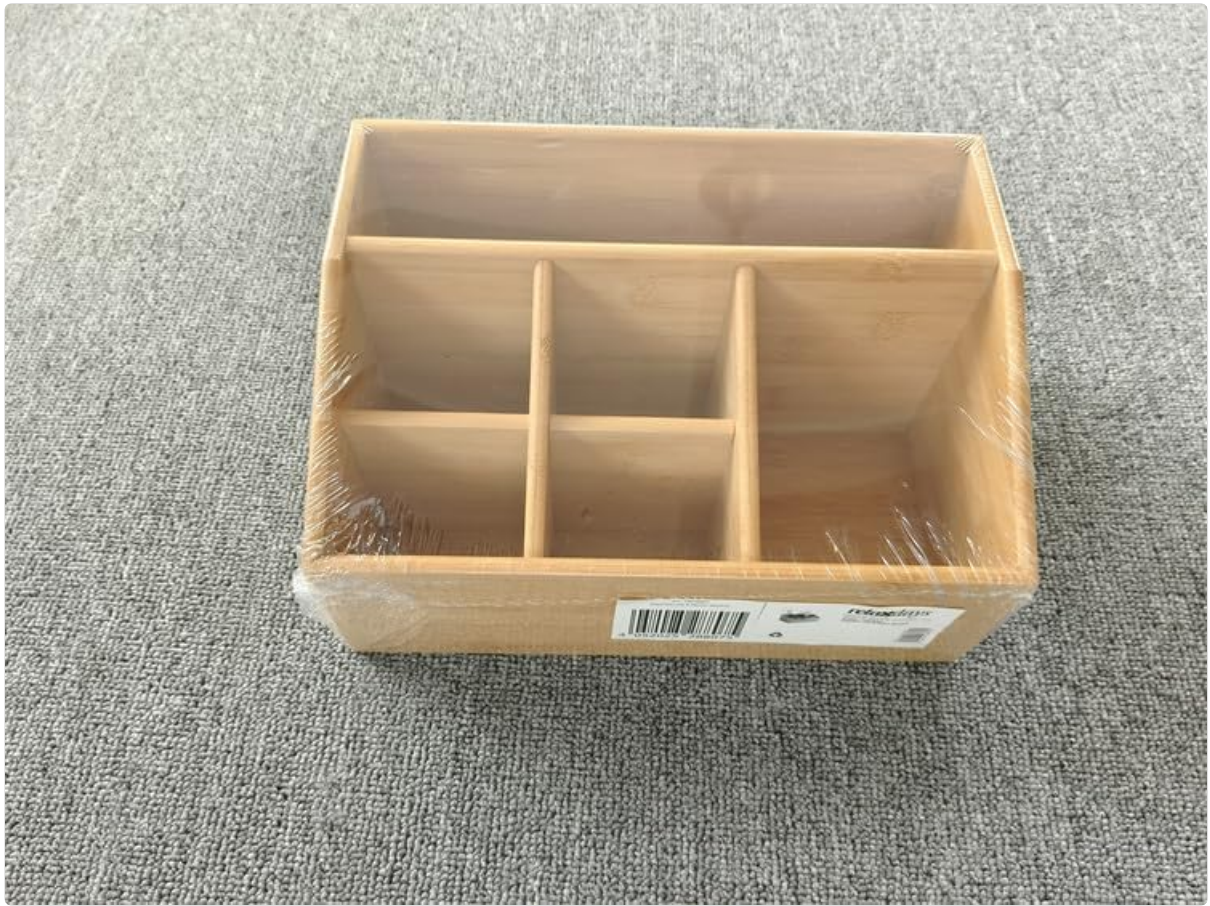
Image 7.2: The bamboo organizer as it appears in its protective plastic packaging, ready for shipment or retail.