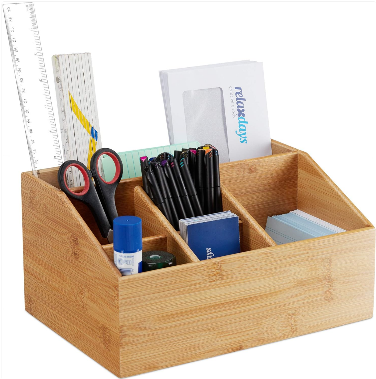
Image 1.1: The Relaxdays Bamboo Organizer, showcasing its six compartments filled with various office supplies such as pens, scissors, glue, and notepads.