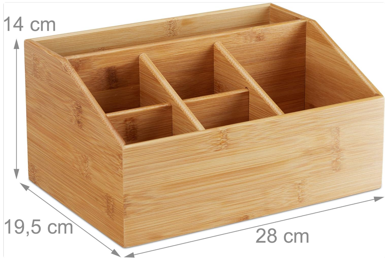
Image 2.1: Detailed dimensions of the organizer: 14 cm (height), 28 cm (width), and 19.5 cm (depth).