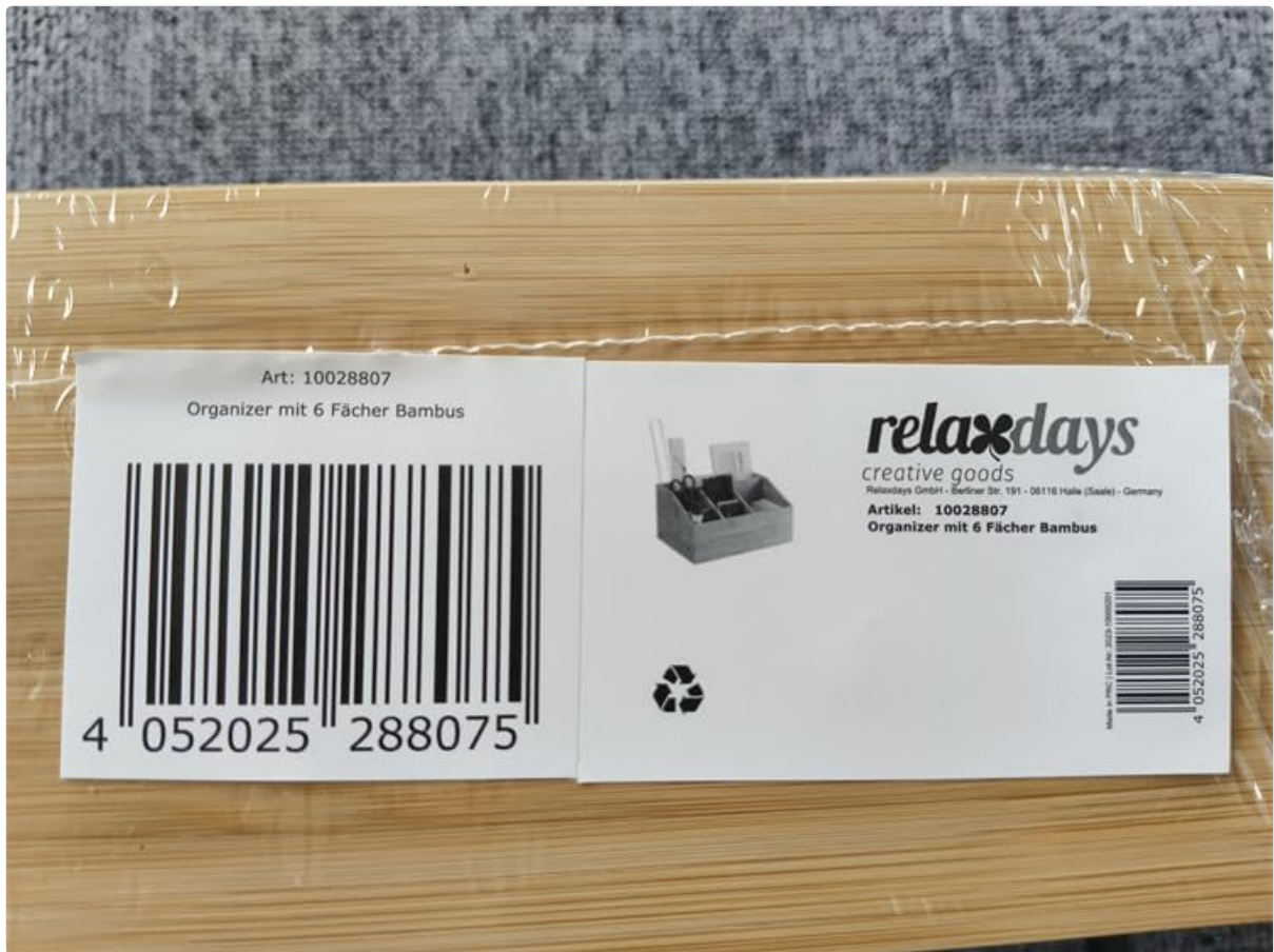
Image 7.1: The product label showing the article number (Art. 10028807) and barcode (4052025288075), confirming product identification.