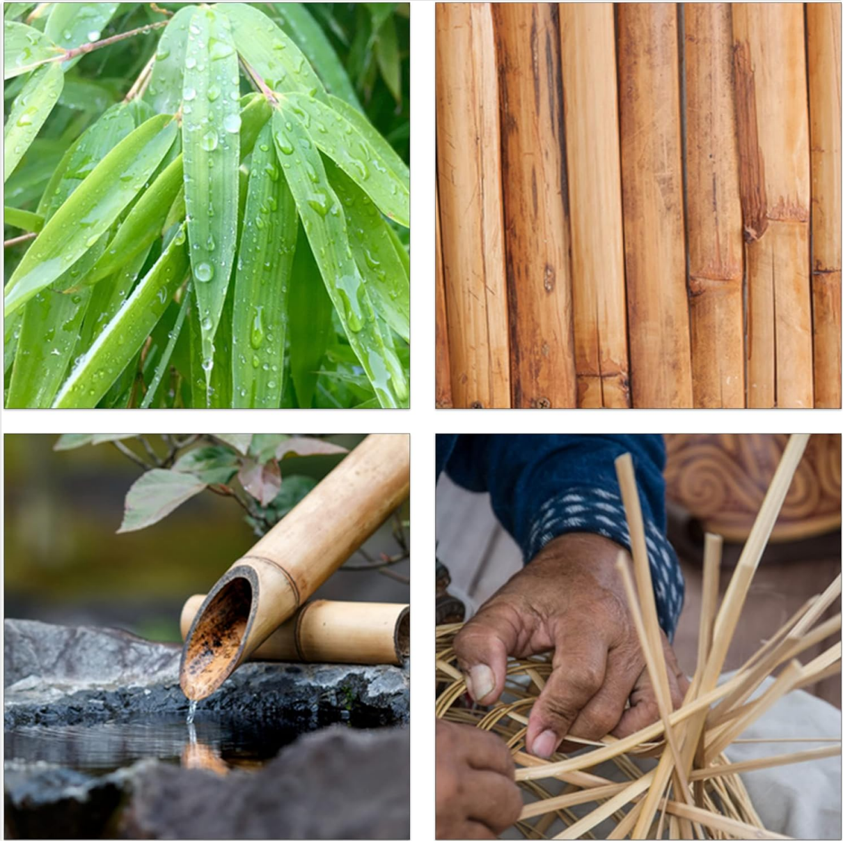
Image 2.2: A collage illustrating the natural bamboo material, showing bamboo leaves, raw bamboo stalks, a bamboo water feature, and bamboo weaving, highlighting the sustainable and natural origin of the product.