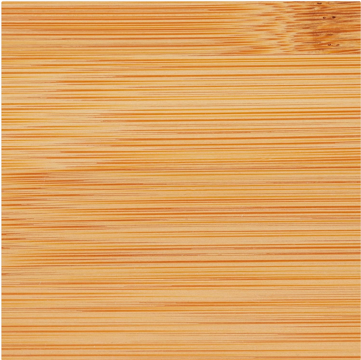
Image 5.2: A detailed close-up showing the natural striped pattern and texture of the bamboo wood, characteristic of its unique grain.