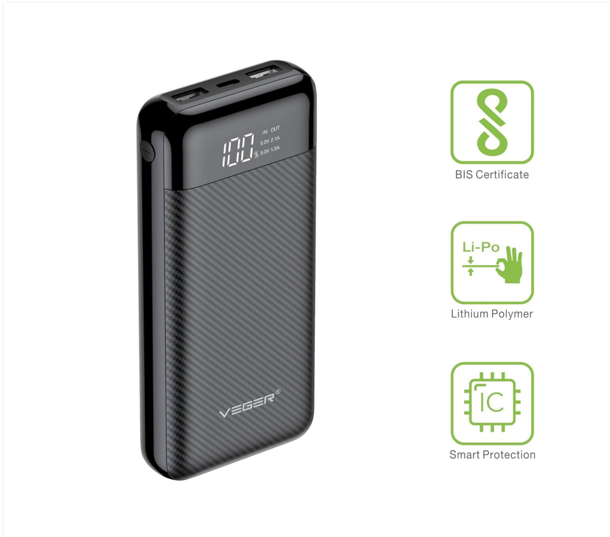
Figure 2: VEGER W2019 Power Bank alongside icons representing key features: BIS Certificate, Lithium Polymer battery, and Smart Protection (IC chip).