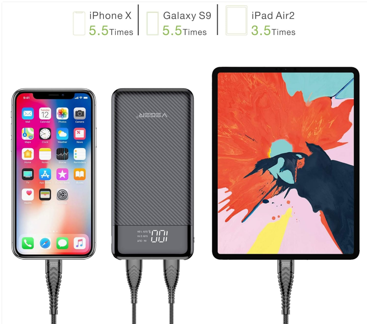
Figure 5: Illustration of the VEGER W2019 Power Bank charging an iPhone X, a Galaxy S9, and an iPad Air 2, indicating approximate charge cycles (5.5 times for phones, 3.5 times for iPad).

4. To stop charging, simply disconnect your device.