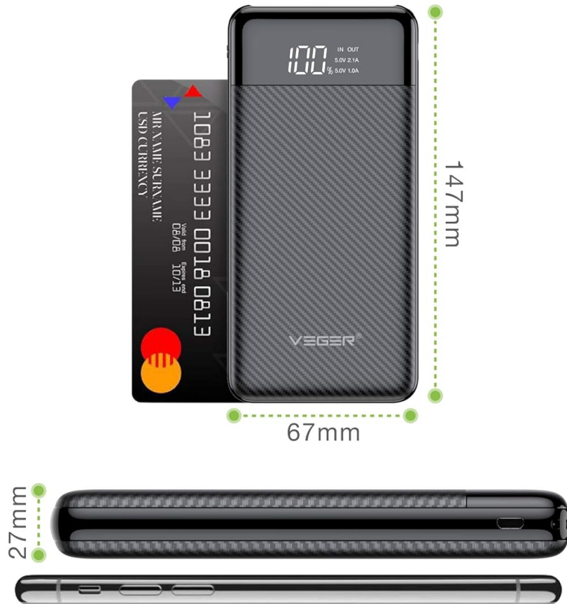
Figure 4: Size comparison of the VEGER W2019 Power Bank with a credit card, showing its dimensions (147mm length, 67mm width, 27mm thickness) to illustrate its "Small Body, Big Capacity".