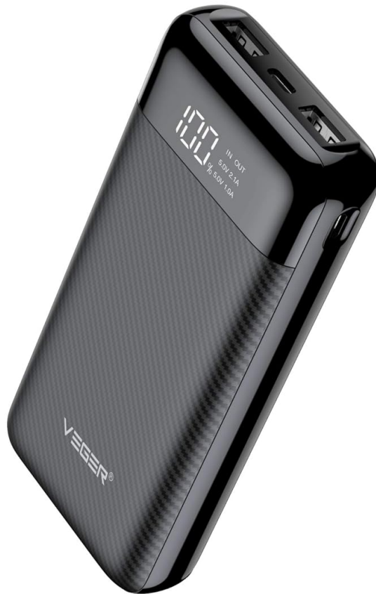
Figure 1: Main product view of the VEGER W2019 Power Bank, showing its sleek black design with a digital display indicating "100%" charge and input/output specifications.