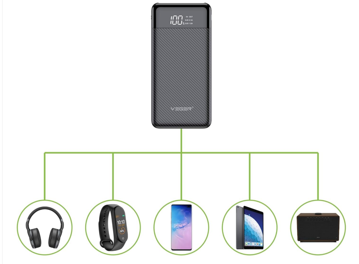
Figure 6: Diagram illustrating the "Universal Compatibility" of the VEGER W2019 Power Bank, showing it connected to headphones, a fitness band, a smartphone, a tablet, and a Bluetooth speaker.