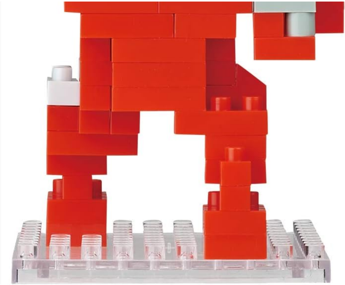
Figure 6: Back view of the assembled Ultraman Ultraseven nanoblock model.