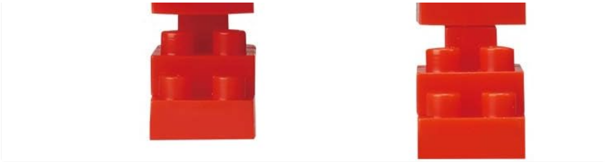
Figure 4: Front-right view of the assembled Ultraman Ultraseven nanoblock model.