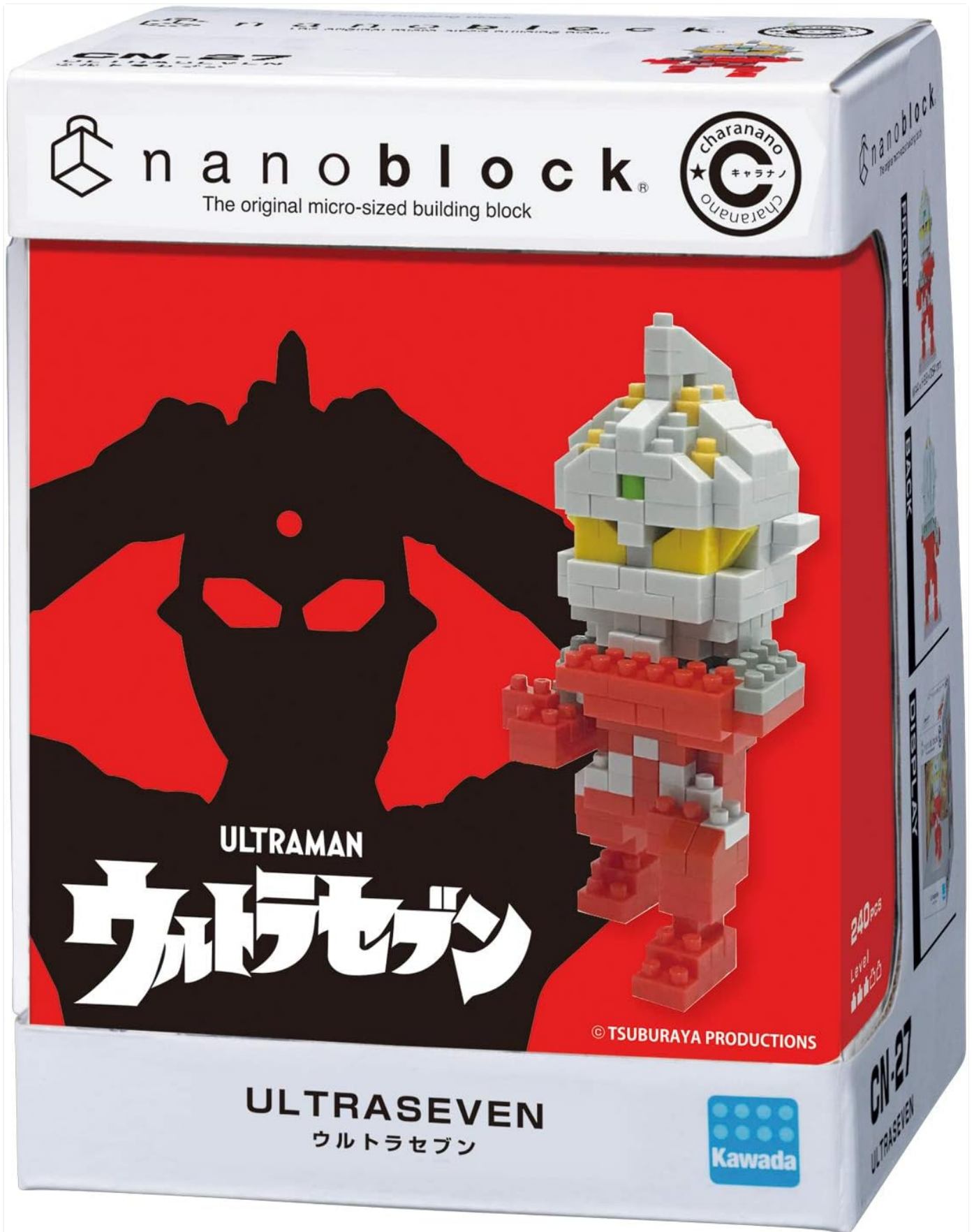
Figure 2: Front-left view of the assembled Ultraman Ultraseven nanoblock model.