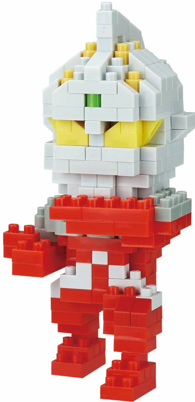
Figure 1: Product packaging for nanoblock charanano Ultraman Ultraseven CN-27.