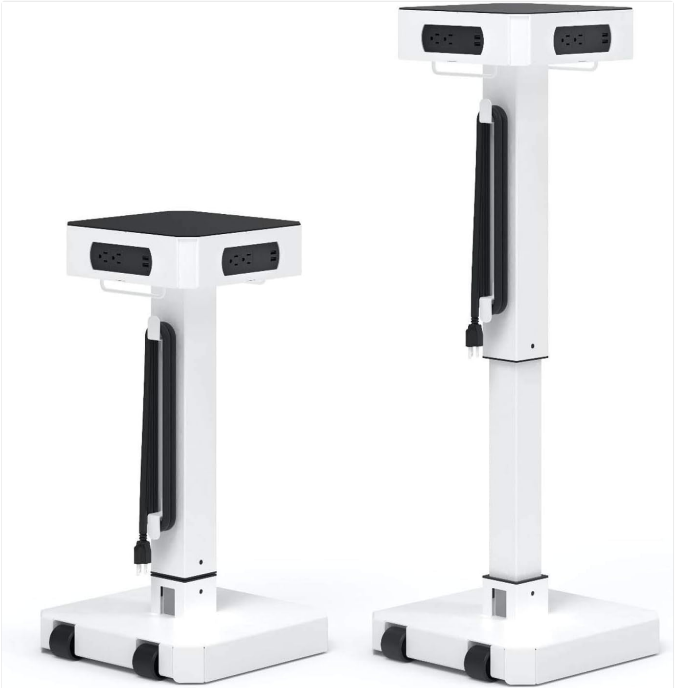
The charging tower displayed at its lowest (26.5") and highest (40") adjustable settings.