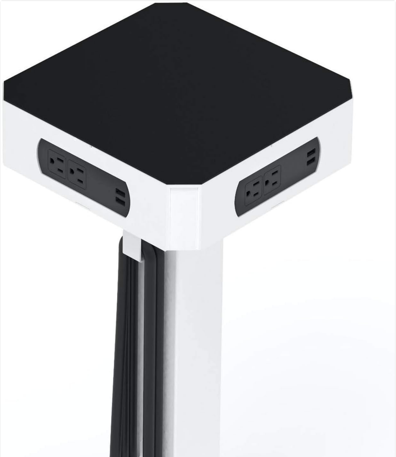
A detailed view of the charging tower's top section, illustrating the accessible AC outlets and USB ports.