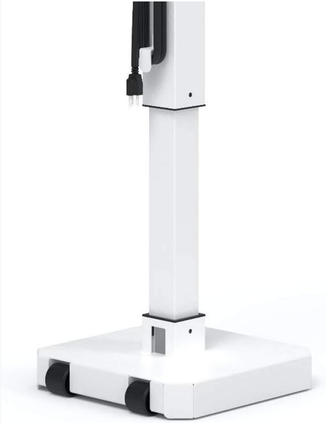
Front view of the Luxor LuxPower Mobile AC and USB Charging Tower, showcasing its sleek white design and integrated power outlets.

Your browser does not support the video tag.