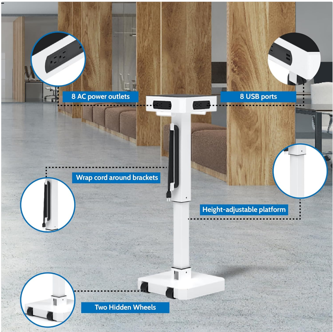
Visual representation of the tower's key features, including its hidden wheels, cord wrap, and accessible AC and USB ports.