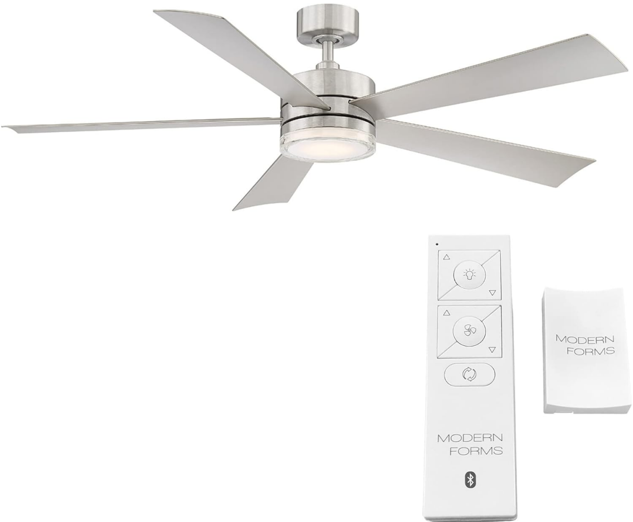
Figure 2: Fan components including the remote control