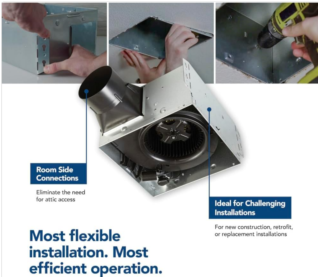
Figure 2: Room-side connections for simplified installation.