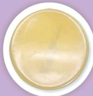
With SurfaceShield™ No visible bacteria colonies