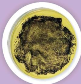
Without SurfaceShield™ Bacteria colonies grow