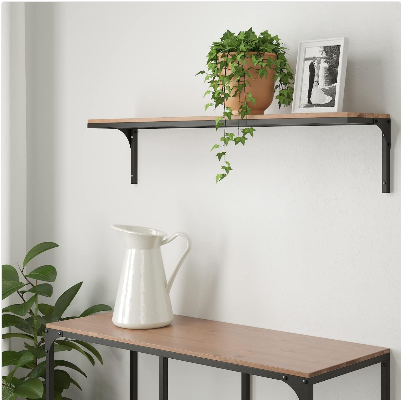
Figure 1: The IKEA FJÄLLBO Wall Shelf in a typical home setting, showcasing its design and utility.