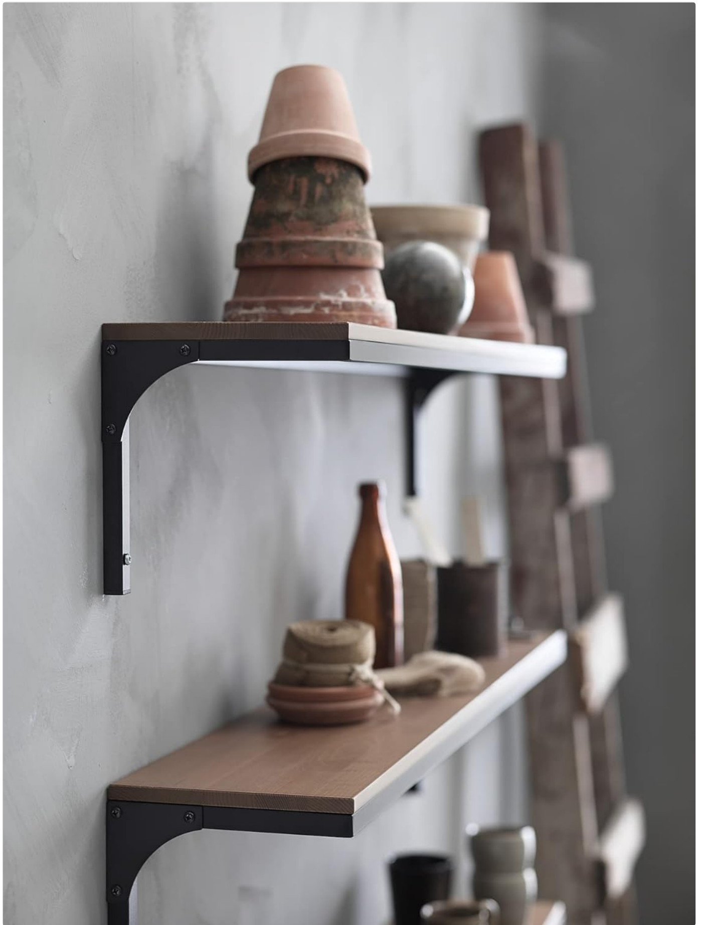
Figure 2: Multiple FJÄLLBO Wall Shelves used together, demonstrating versatility in display.

prolonged periods, as this can affect the wood and metal components.