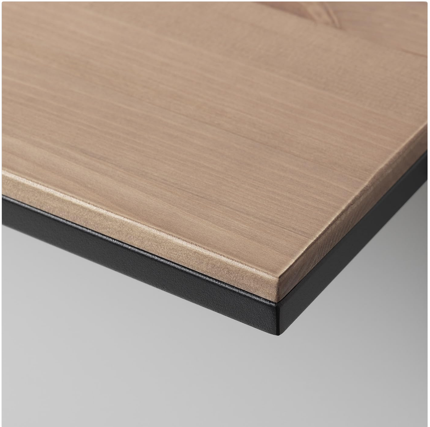
Figure 3: Detail of the shelf's construction, showing the solid pine and powder-coated steel.