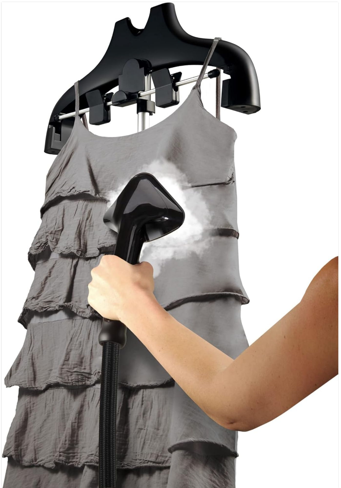
Figure 5.4: Steaming a dress.