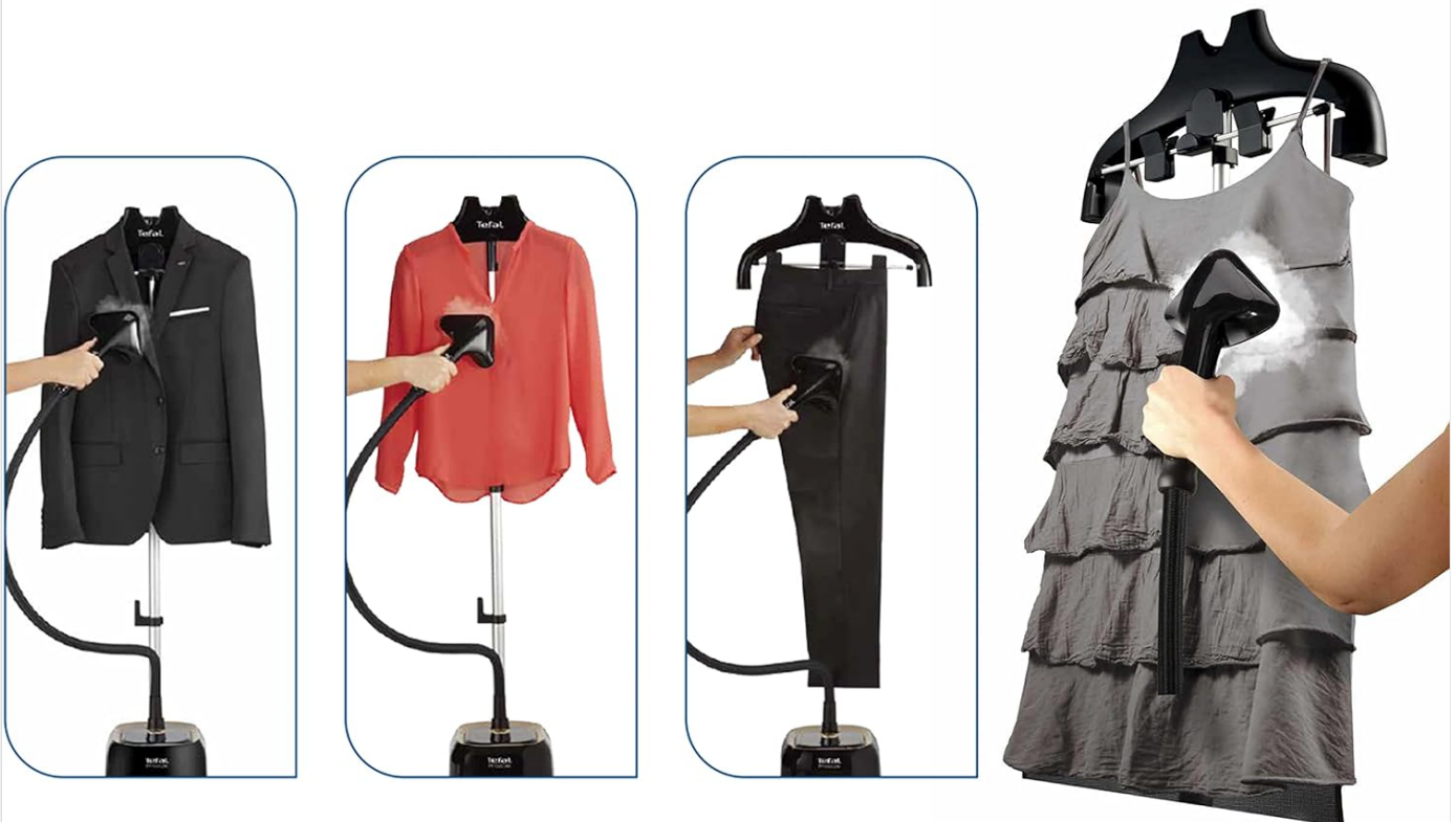
Figure 5.1: Examples of steaming different types of garments.