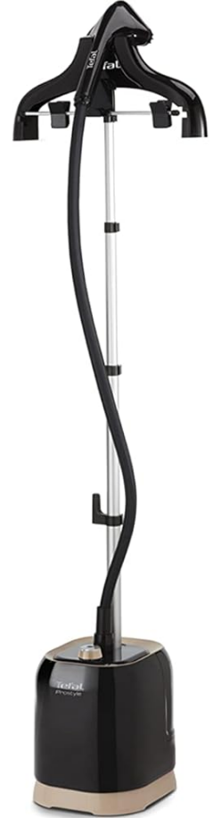
Figure 3.2: Overview of steamer features and included accessories (fabric brush, hanger hooks).