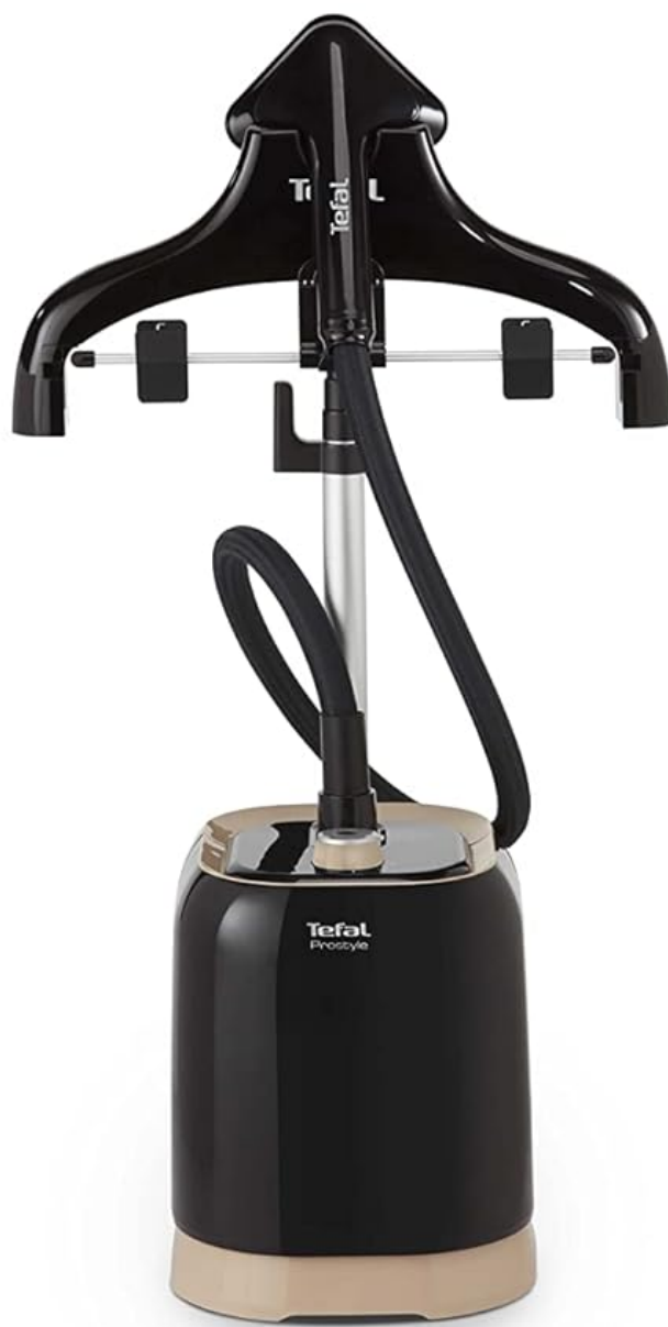
Figure 3.1: Fully assembled Tefal ProStyle Garment Steamer IT3420E0.