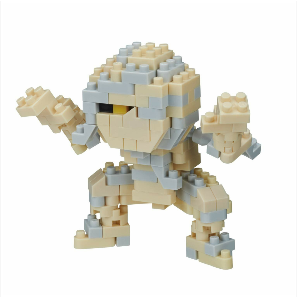
Figure 1: Completed nanoblock Mummy model. This image displays the fully assembled nanoblock Mummy model, highlighting its detailed design and the micro-sized blocks used in its construction.