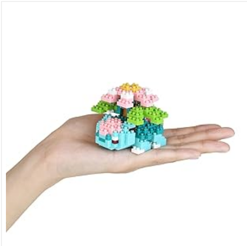
Figure 2: Scale reference for nanoblock pieces. An image showing a nanoblock Pokemon model resting in the palm of a hand, emphasizing the miniature scale of nanoblock pieces.