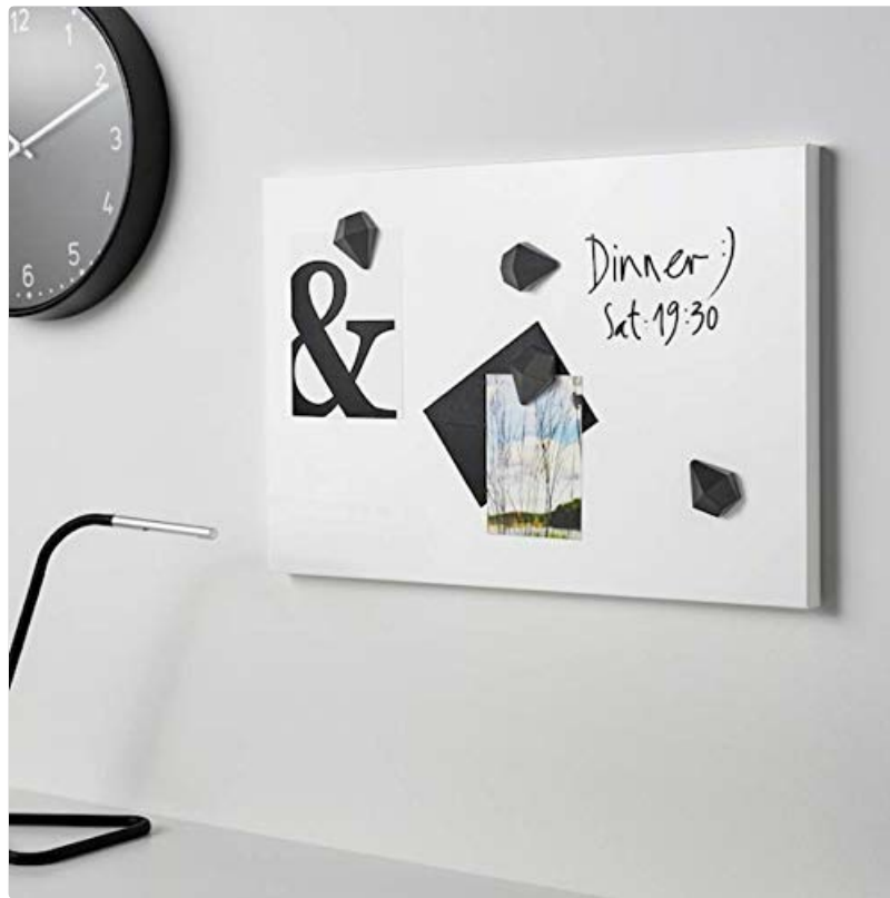
Image: The Svensas Memo Board in a home office setting, showcasing its magnetic functionality with various items attached.