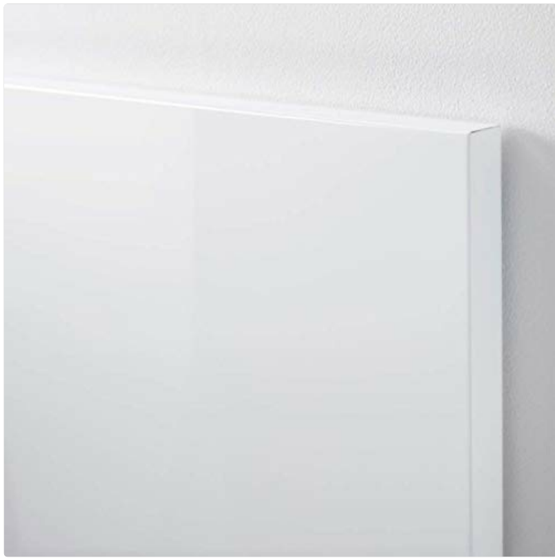
Image: A detailed view of the board's edge, highlighting its construction and finish.