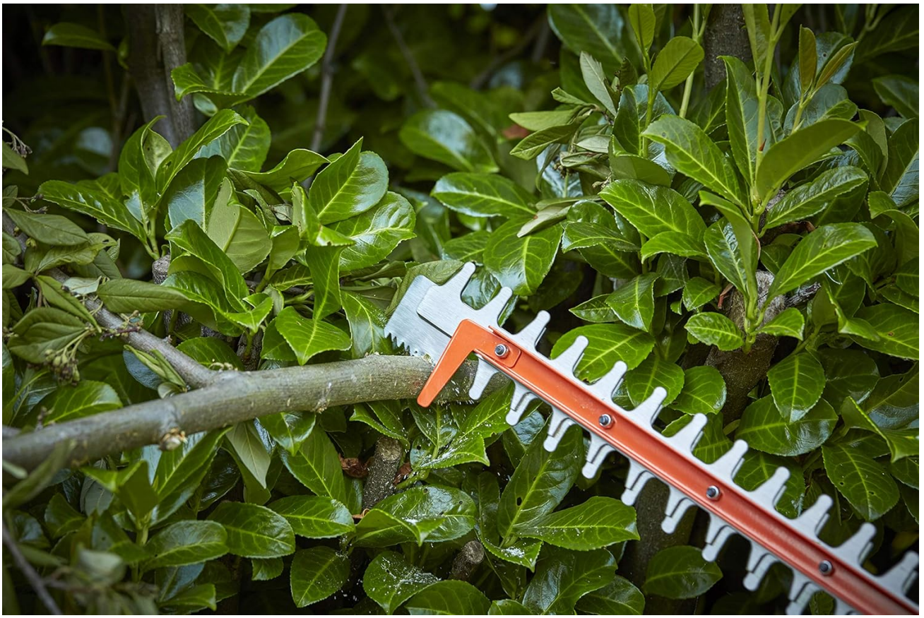
Figure 6: The blade's saw function engaging with a thicker branch, demonstrating its capability for larger cuts.