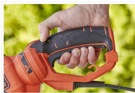
Figure 2: Detail of the main handle with the power trigger, designed for comfortable grip and control.