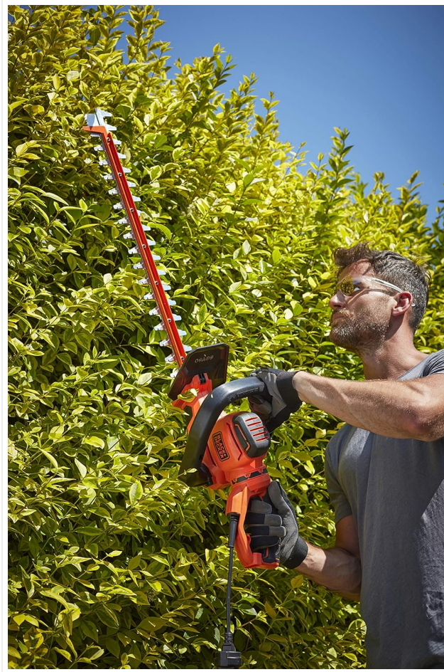
Figure 5: Illustrates horizontal trimming, maintaining a steady, even pass along the top of the hedge.