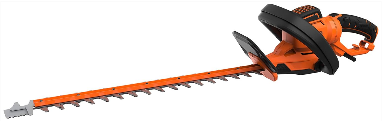
Figure 1: Overall view of the BLACK+DECKER BEHTS551-QS Electric Hedge Trimmer, showcasing its orange and black design with a long blade.

The BLACK+DECKER BEHTS551-QS is an electric hedge trimmer designed for efficient trimming of hedges and shrubs. It features a 60cm blade and a powerful 650W motor.