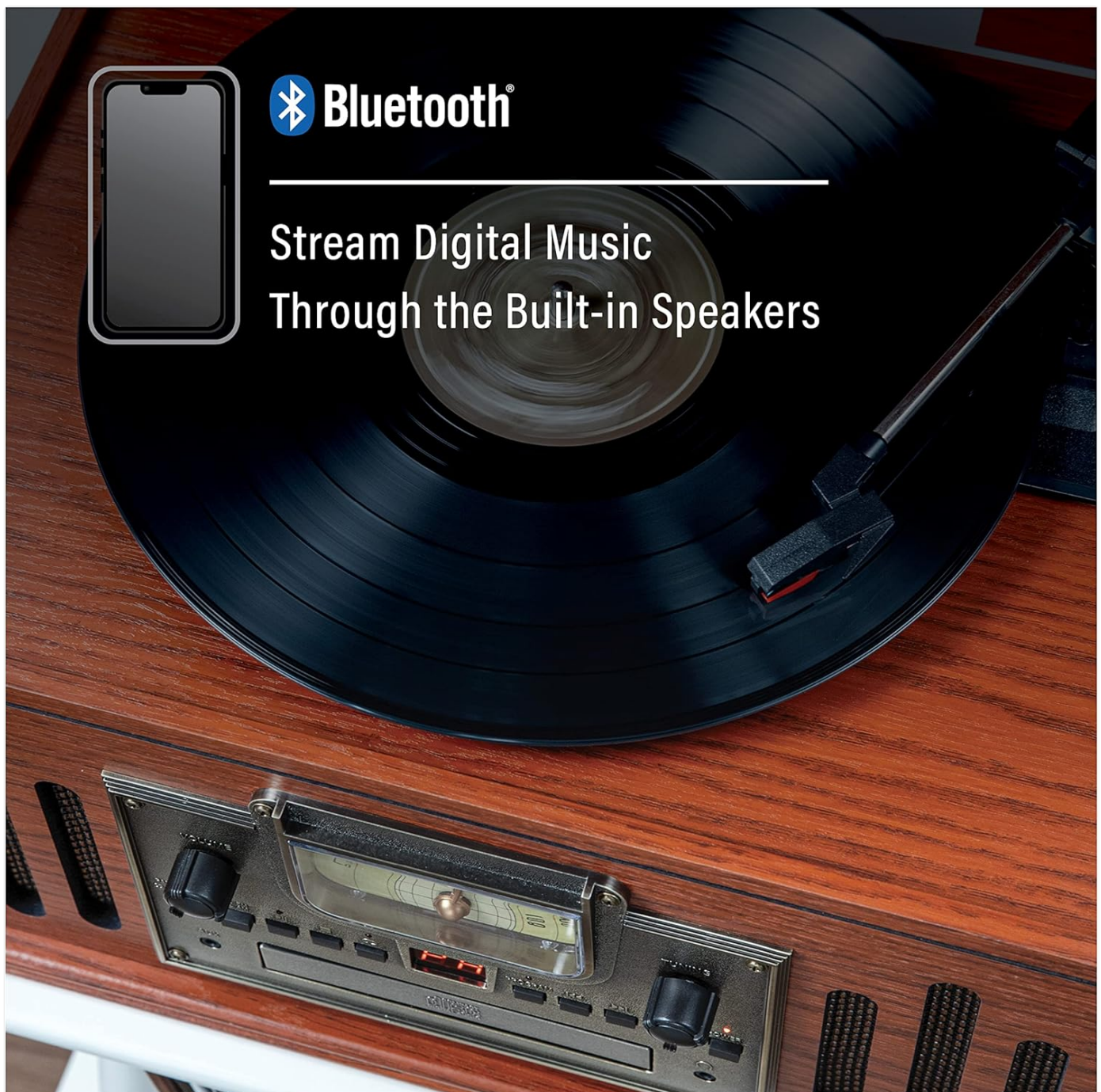
Figure 6: Demonstrates streaming digital music via Bluetooth to the unit.