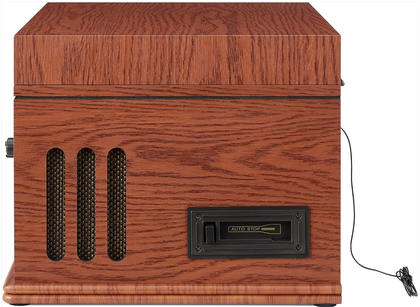
Figure 3: Rear view of the unit, showing the power input and FM antenna connection.