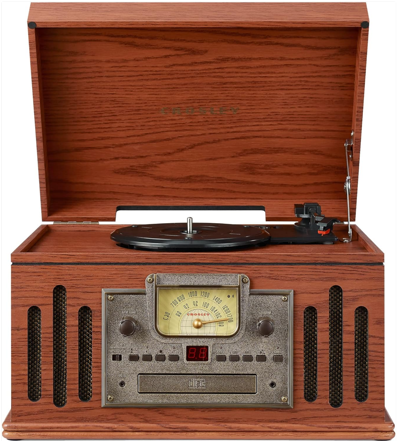
Figure 1: Top view of the Crosley Musician CR704B-PA with the lid open, showing the turntable.