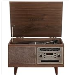
Figure 5: Detail of the cassette player slot.