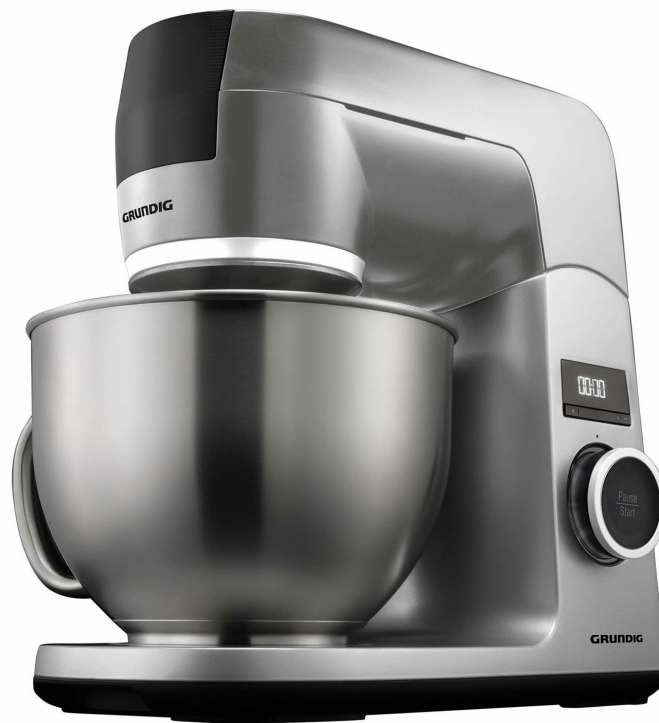
Figure 1: Grundig KMP 8650 S Kitchen Machine with whisk attachment. This image shows the main unit, the stainless steel mixing bowl, and the whisk attachment in place.

Familiarize yourself with the components of your Grundig KMP 8650 S Kitchen Machine.