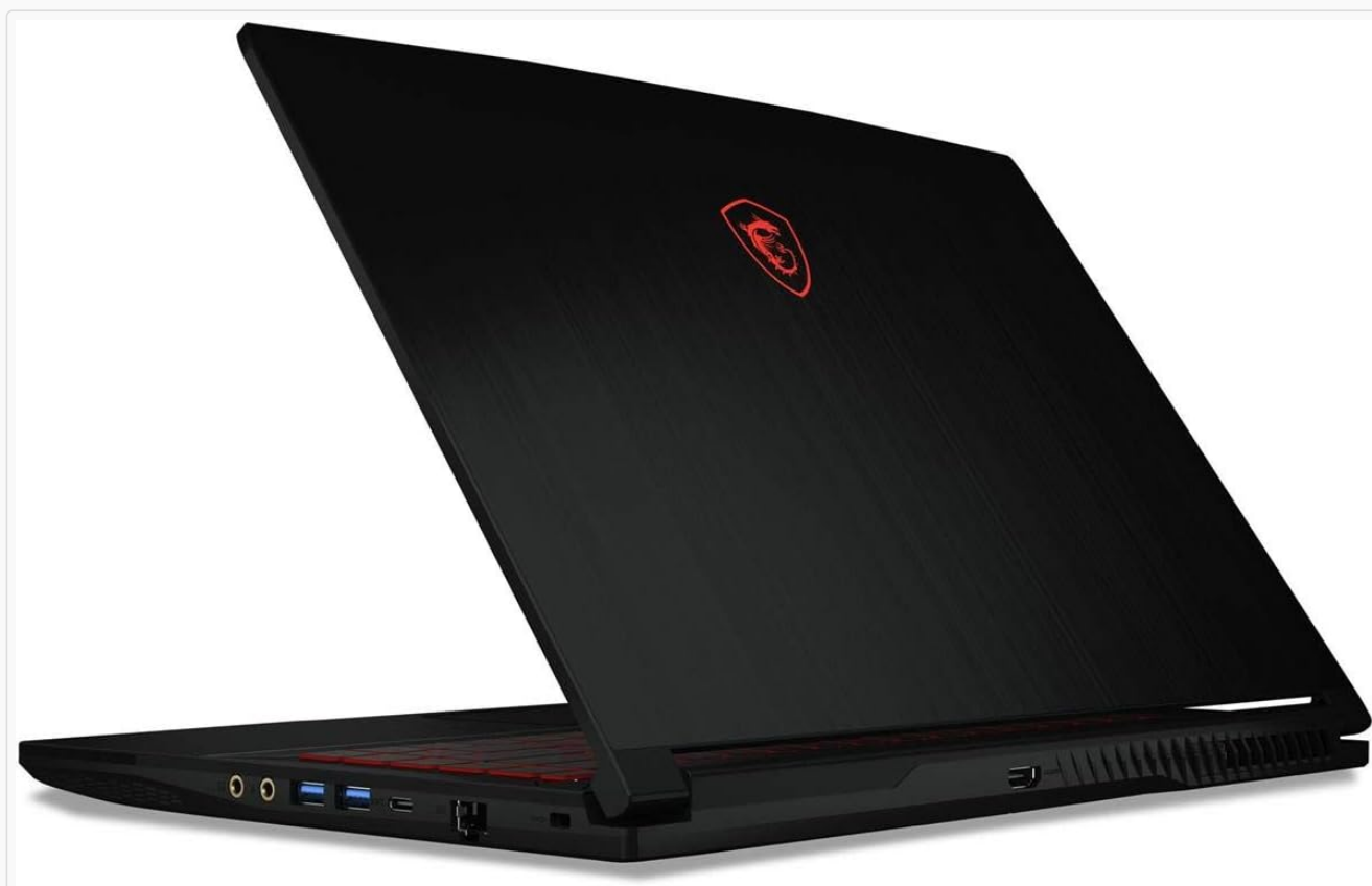
Figure 2.2: Rear view of the MSI GF63 Thin 9SCX-005 laptop, highlighting the lid design with the MSI dragon logo.