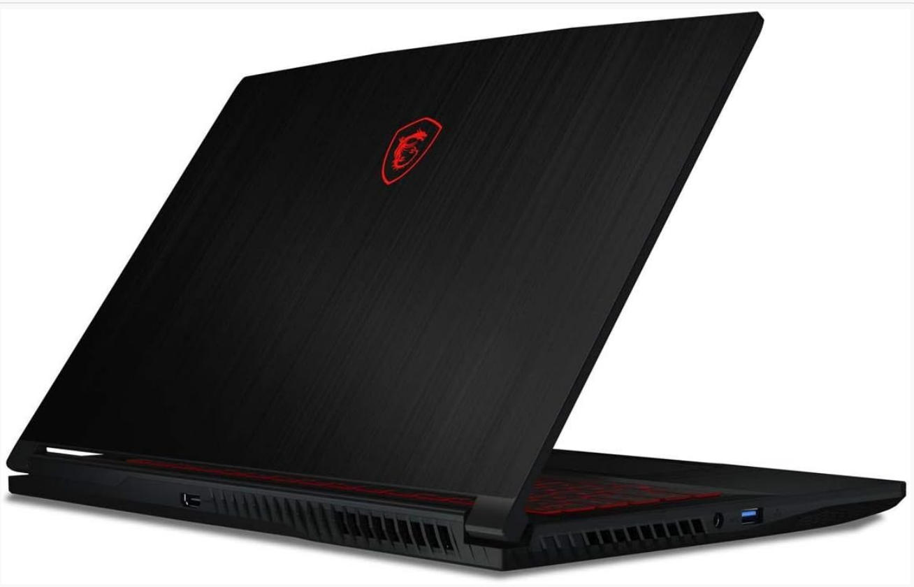
Figure 2.4: Right side view of the MSI GF63 Thin 9SCX-005 laptop, displaying additional ports and the power input.