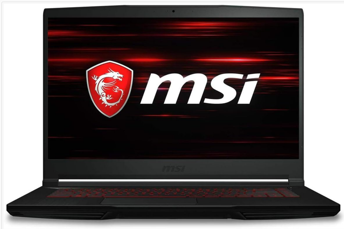
Figure 2.1: Front view of the MSI GF63 Thin 9SCX-005 laptop, showcasing the display and keyboard area.