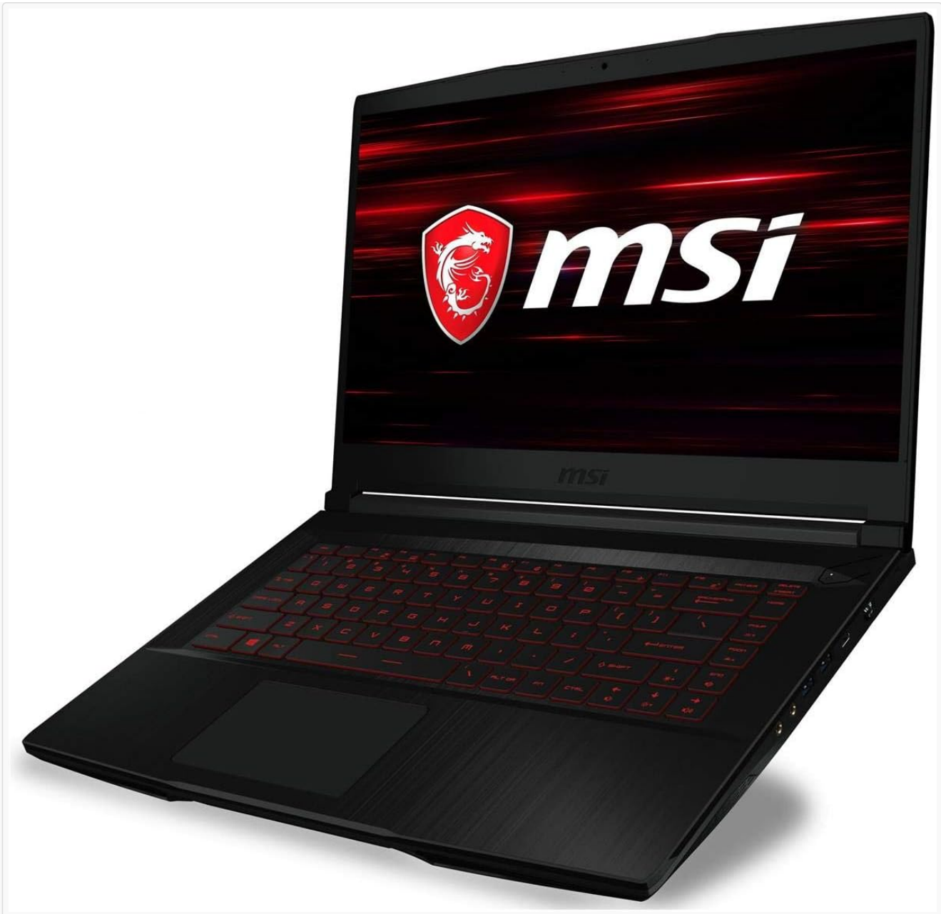
Figure 2.5: Angled view of the MSI GF63 Thin 9SCX-005 laptop, providing a comprehensive look at its design and keyboard layout.