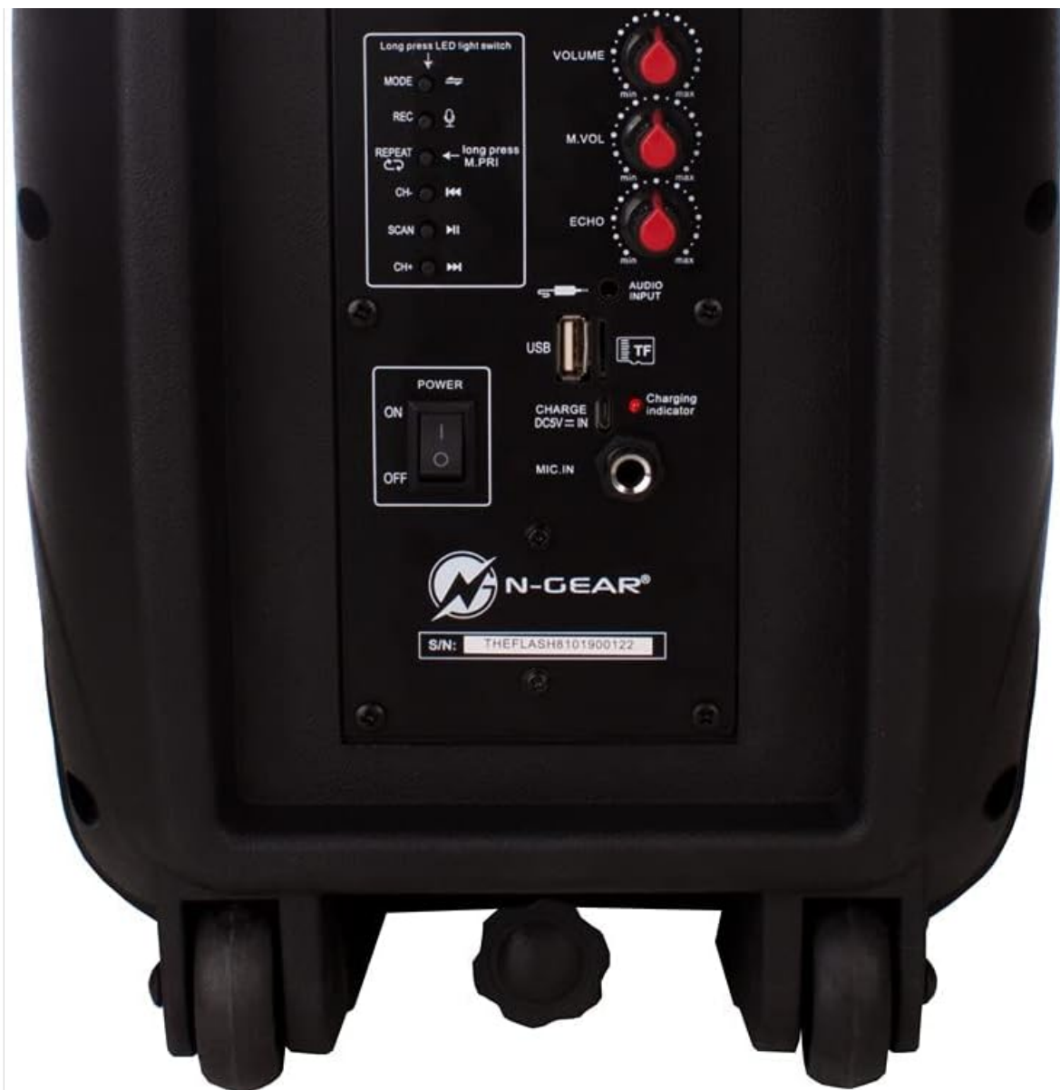
Figure 4.4: Detailed close-up of the N-GEAR Flash 810 speaker's control panel, showing the LED display, various knobs, buttons, and input ports.