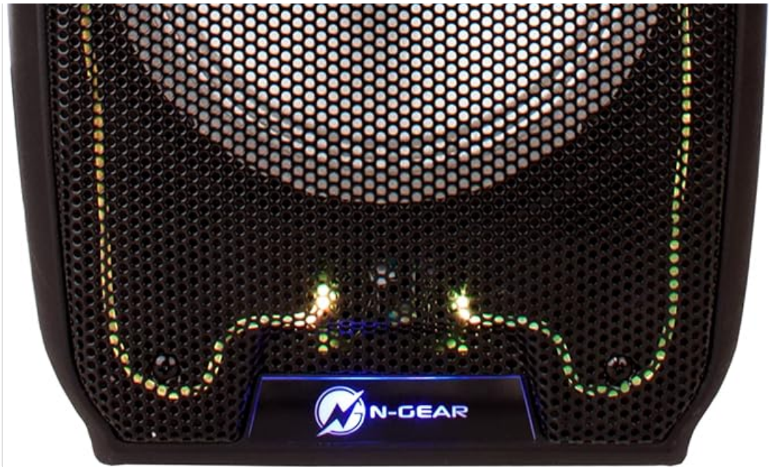
Figure 4.1: Front view of the N-GEAR Flash 810 speaker with the trolley handle extended, showcasing the main speaker grille and integrated LED lights.