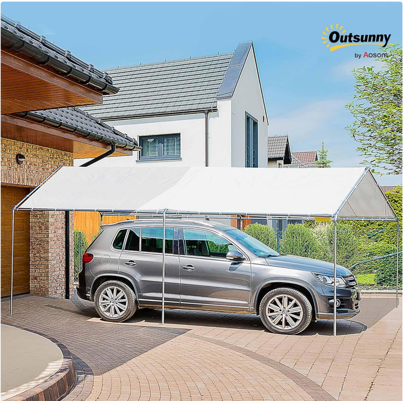
Image: The Outsunny carport providing shelter for a car, demonstrating its primary function and assembled appearance.