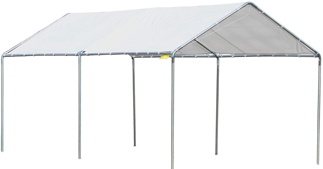
Image: The Outsunny 10'x20' Carport, fully assembled, showcasing its white canopy and galvanized steel frame.

The Outsunny 10'x20' Carport is designed to provide reliable shelter for vehicles and outdoor activities. Its spacious open design allows for easy vehicle access, protecting small to medium cars from various weather conditions. Constructed with a robust galvanized steel frame and a durable PE cloth fabric canopy, this carport offers strength and longevity. It includes essential accessories like ground stakes and guy ropes for enhanced stability.