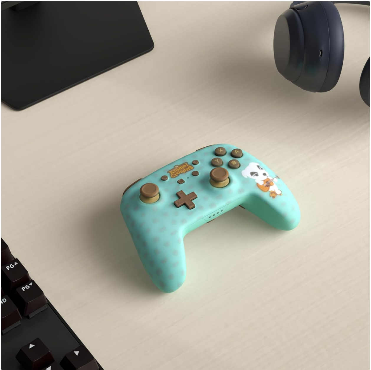
Image: Front view of the controller highlighting its buttons and design elements.