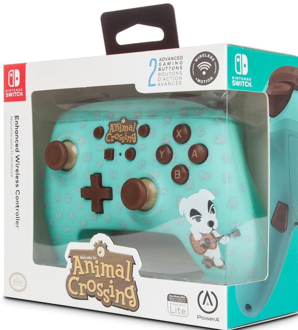
Image: Retail packaging of the PowerA Enhanced Wireless Controller.